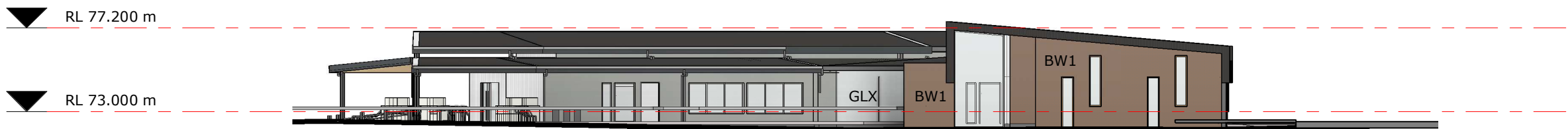
3 CHILD CARE CENTRE - ELEVATION_ SOUTH 1 : 250