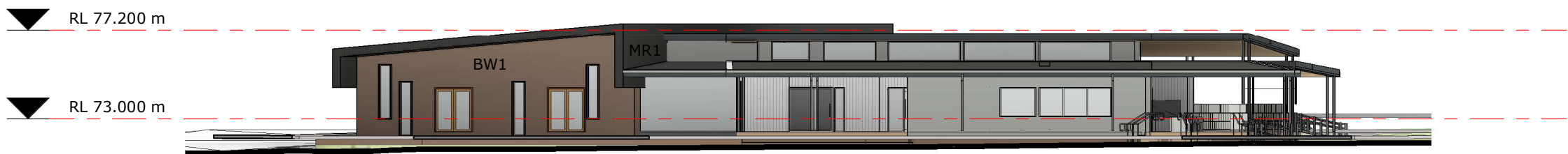
1 CHILD CARE CENTRE - ELEVATION_ NORTH 1 : 250