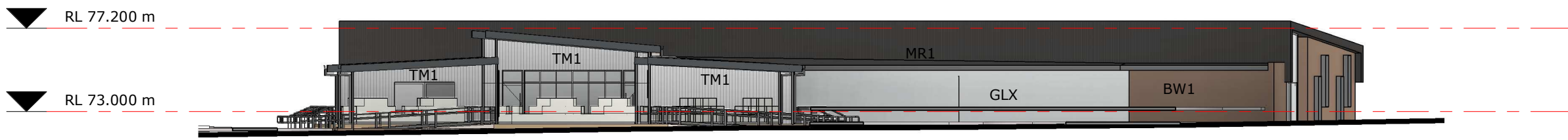
4 CHILD CARE CENTRE - ELEVATION_ WEST 1 : 250