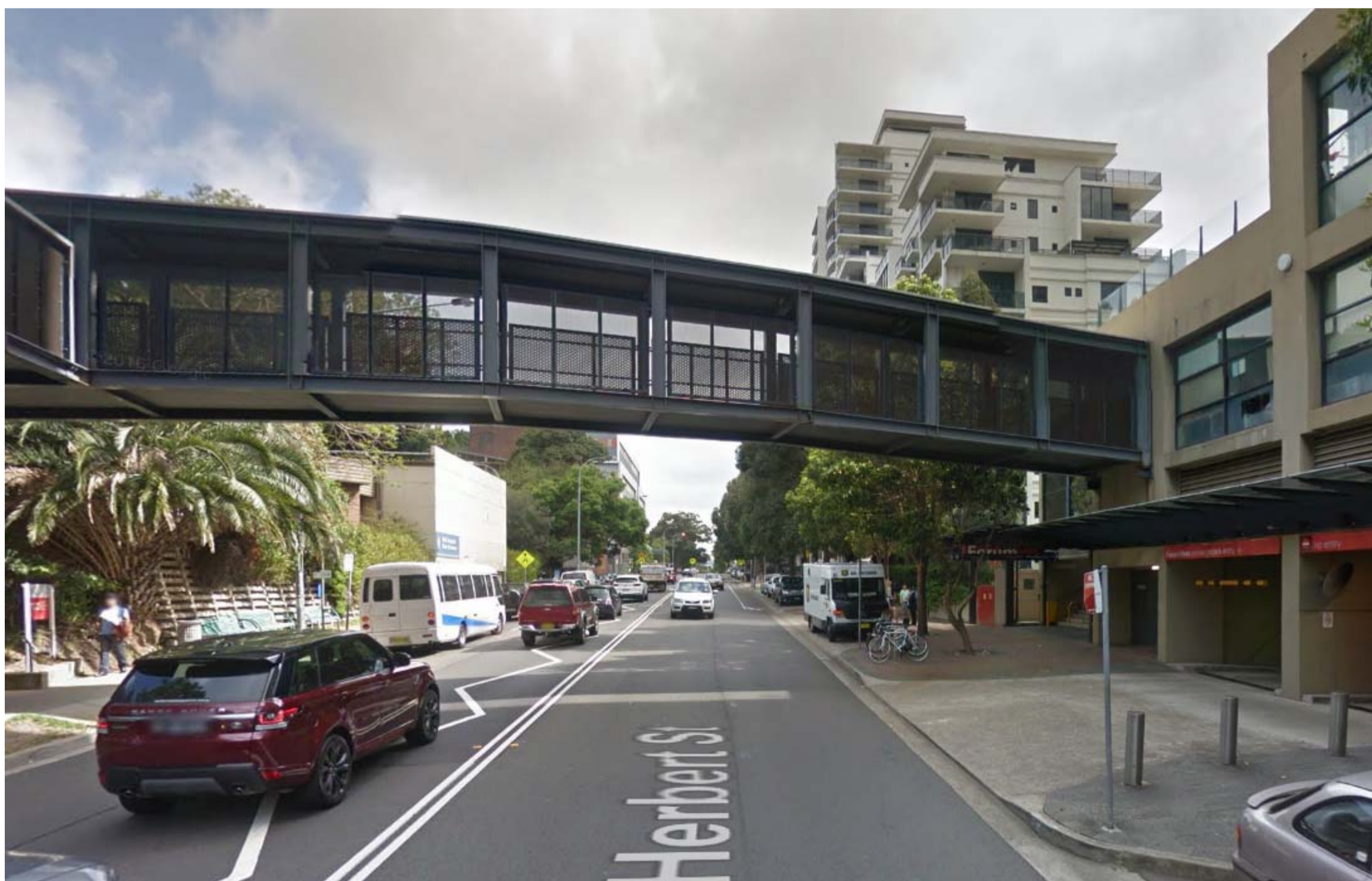
EXISTING PEDESTRIAN FOOTBRIDGE OVER HERBERT STREET