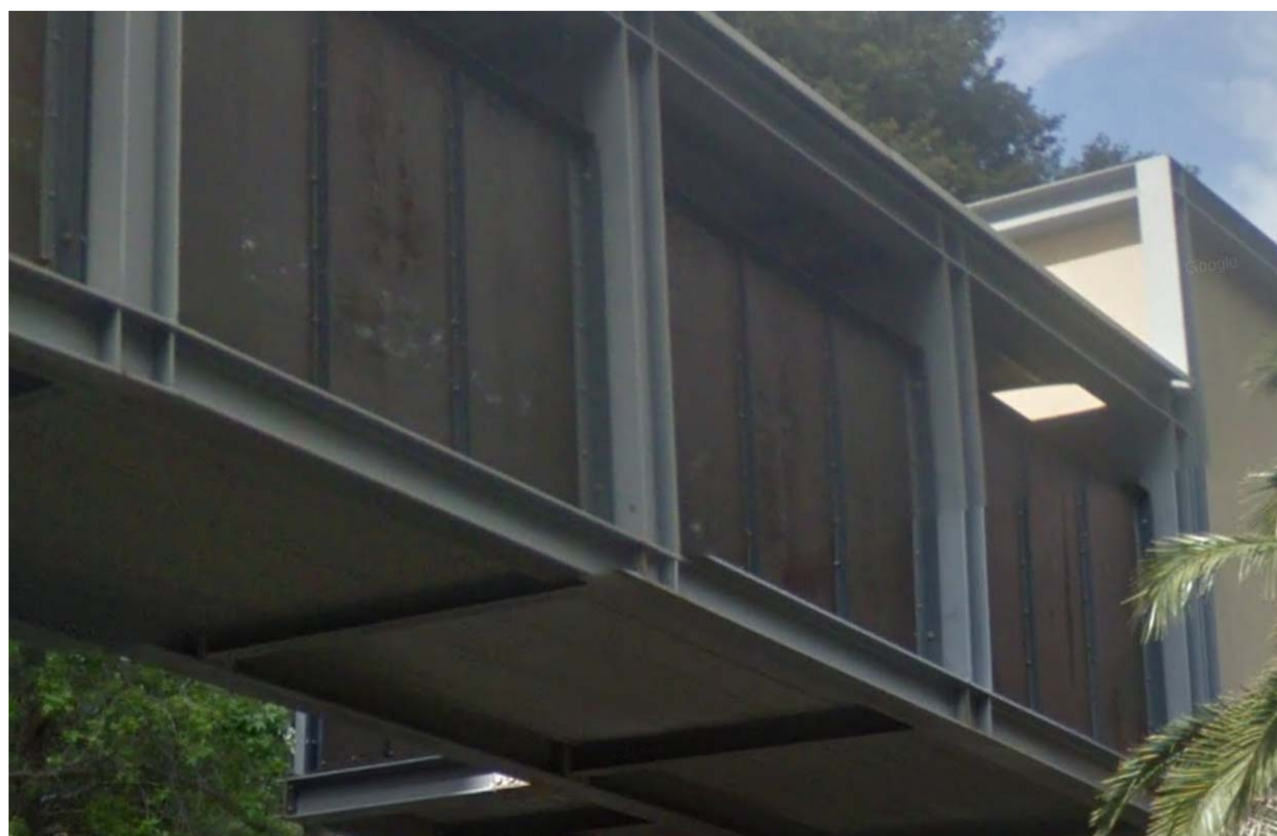
EXISTING FOOTBRIDGE DETAIL