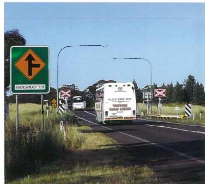
Newell Highway at the Welcome railway crossing

All feedback must be received by 5pm Friday 10 February 2017.