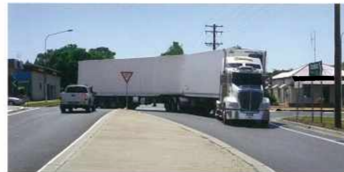
Truck turning right from Clarinda Street into Mitchell Street along the Newell Highway