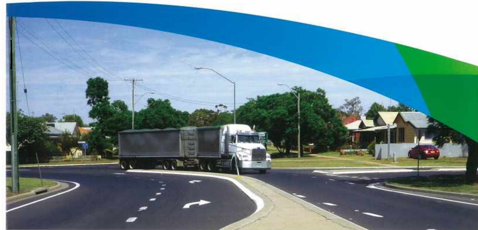
A truck negotiating the Mitchell and Bogan street intersection