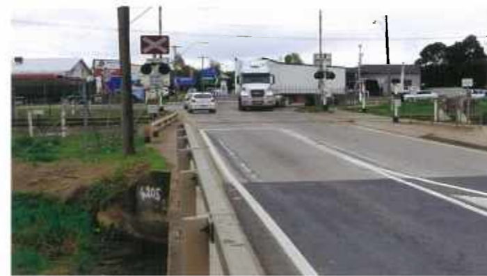
Truck turning over the level crossing from Hartigan Avenue