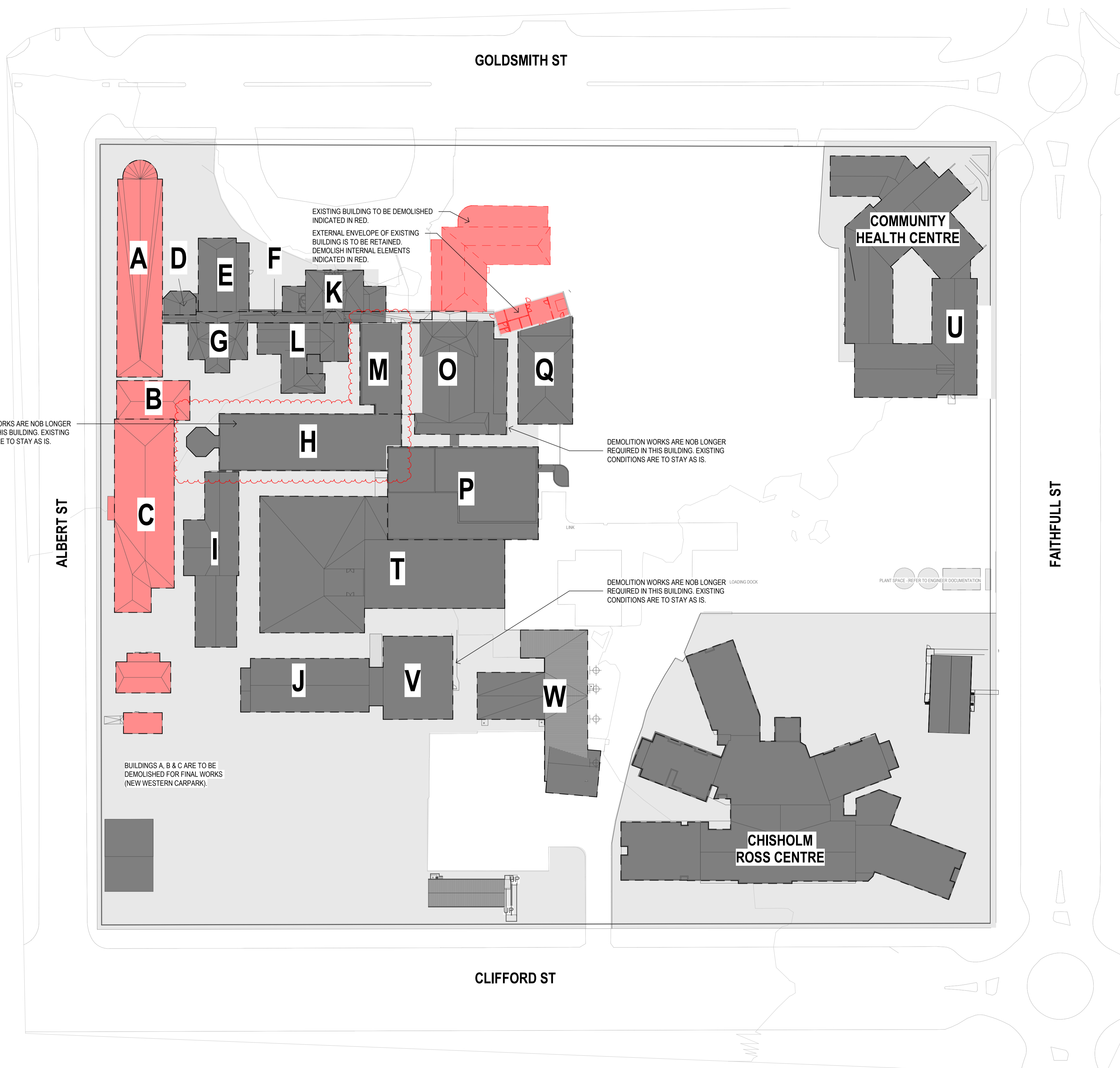
1 Site Plan - Demolition SCALE: 1:500