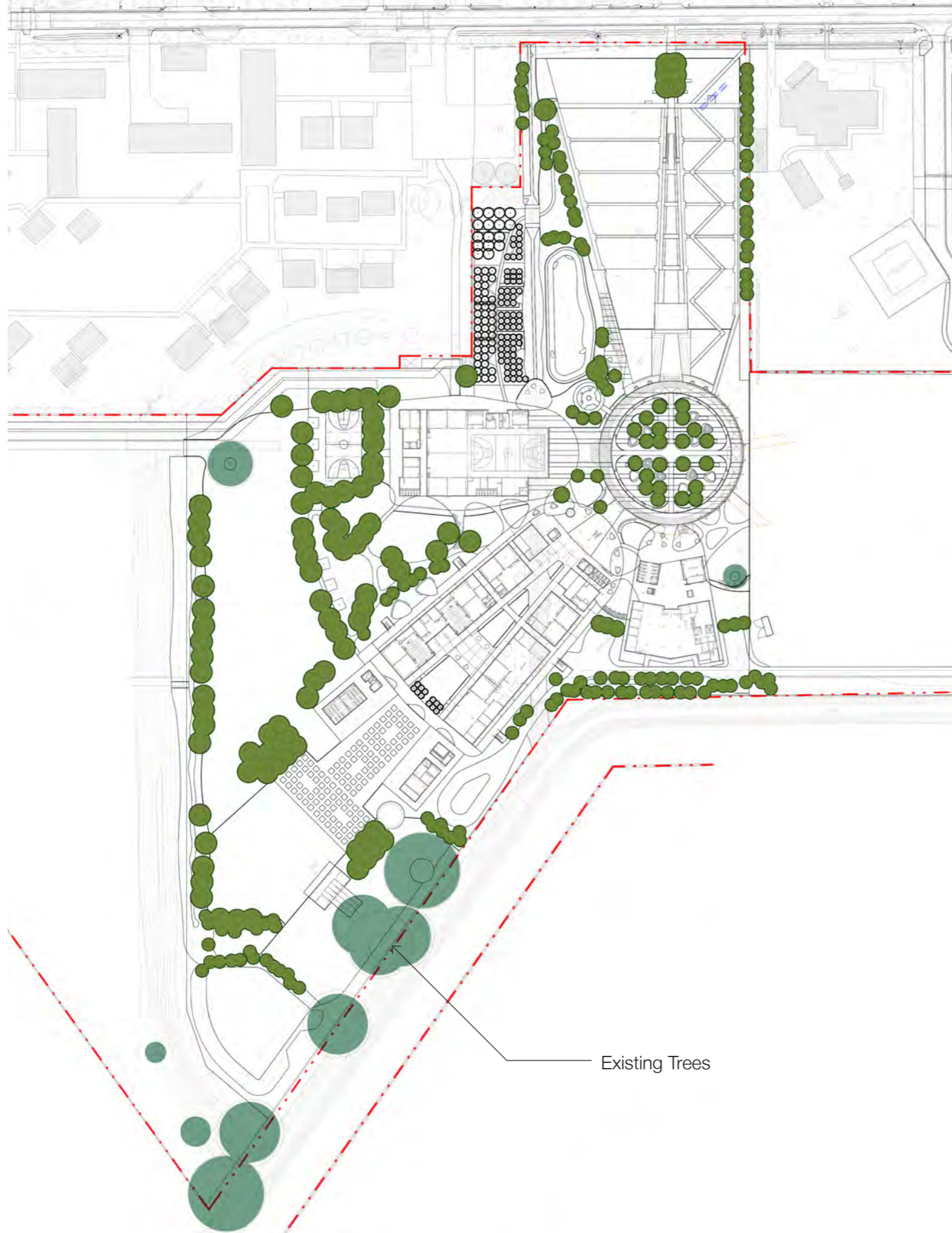
TREE CANOPY COVERAGE IN 10 YEARS TIME - Most of the trees will have average 8.0 meter wide spread - Marked trees are non-agricultural