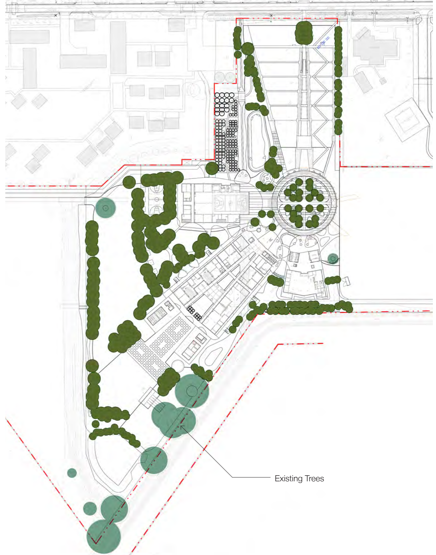
TREE CANOPY COVERAGE IN 15 YEARS TIME - Most of the trees will have average 12.0-15.0 meter wide spread - Marked trees are non-agricultural