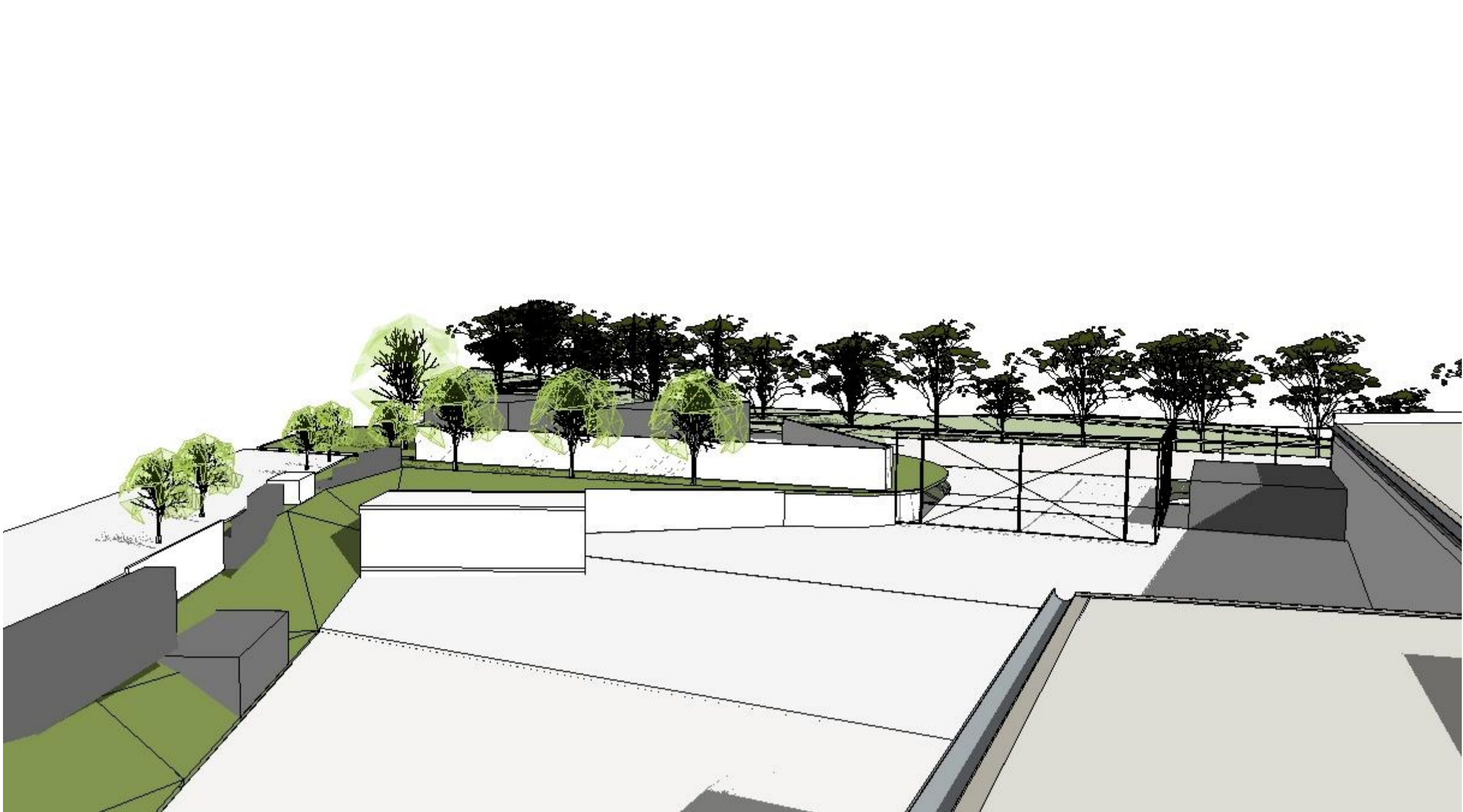
BOH VIEW 1