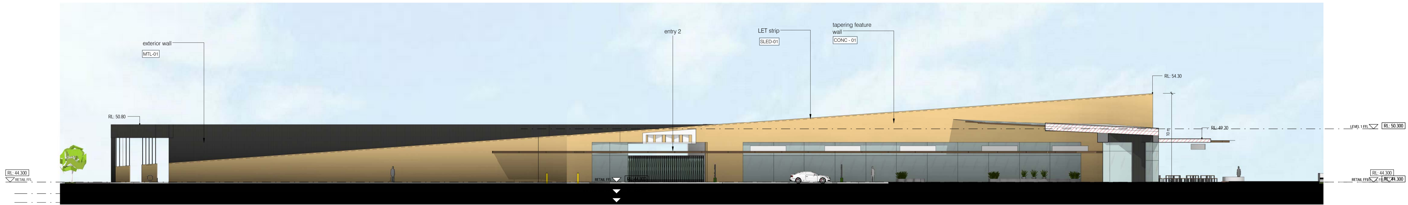
TRUE ELEVATION EAST