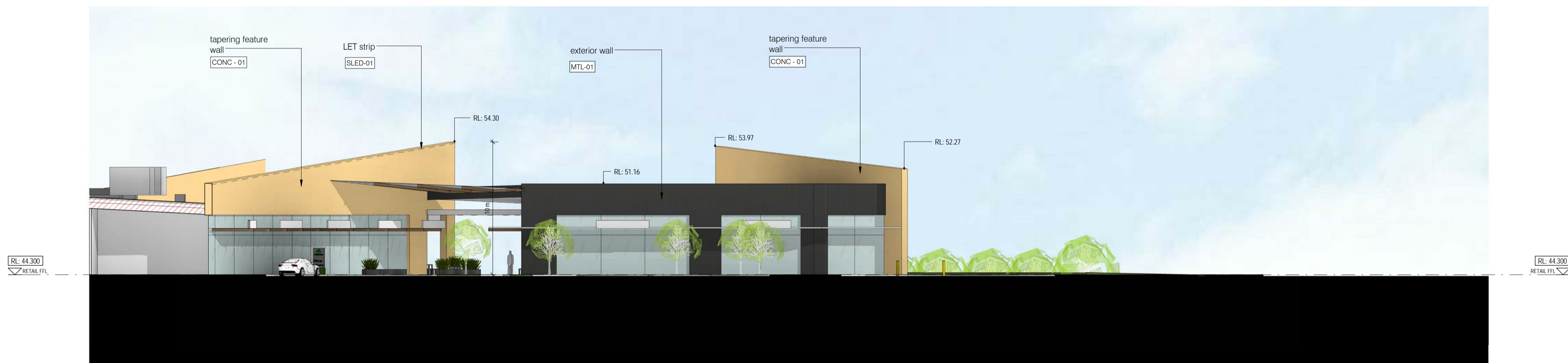
TRUE ELEVATION SOUTH