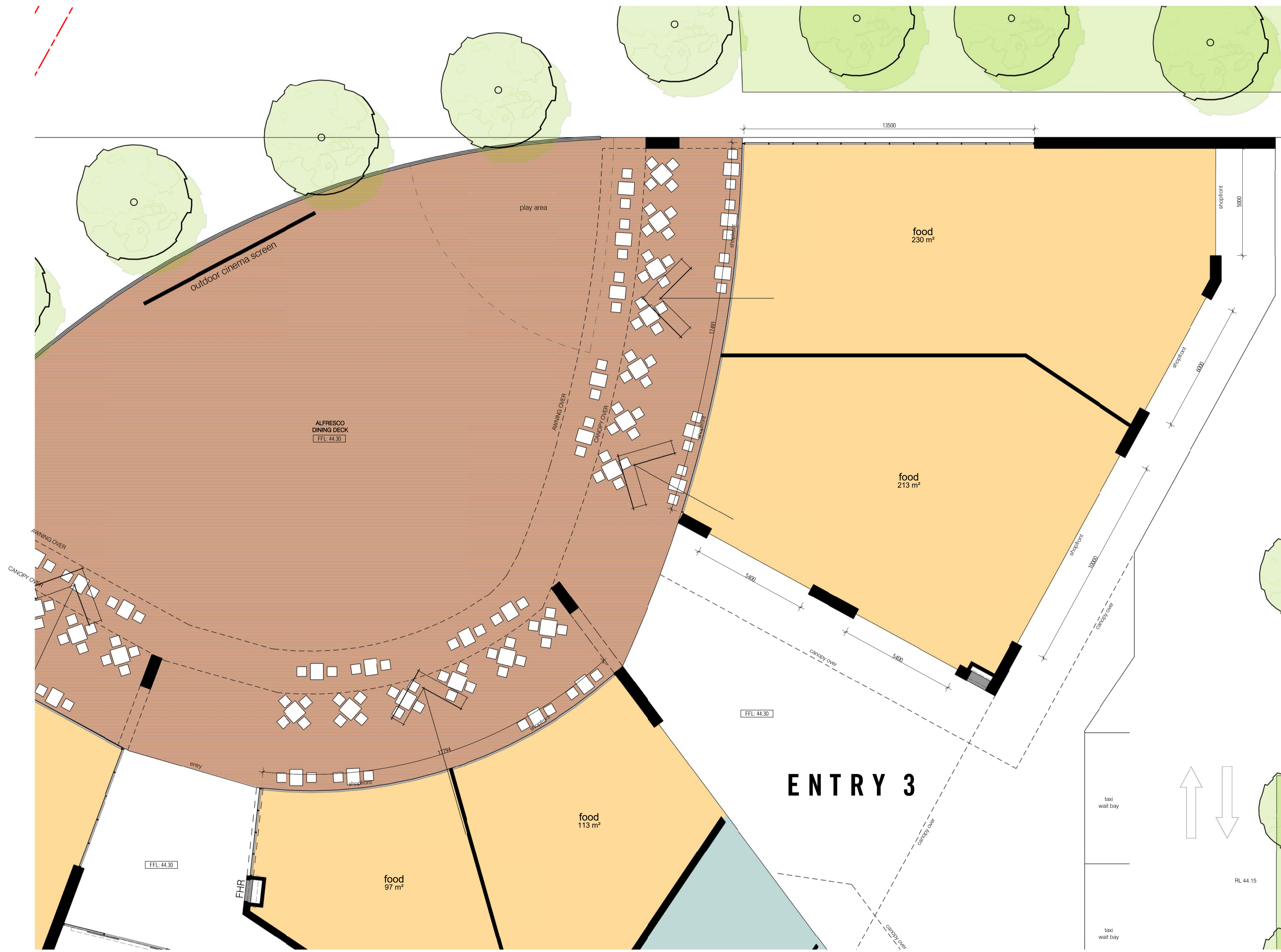
PROPOSED ZONE C PLAN (SLOW FOOD PRECINCT) 1 : 100