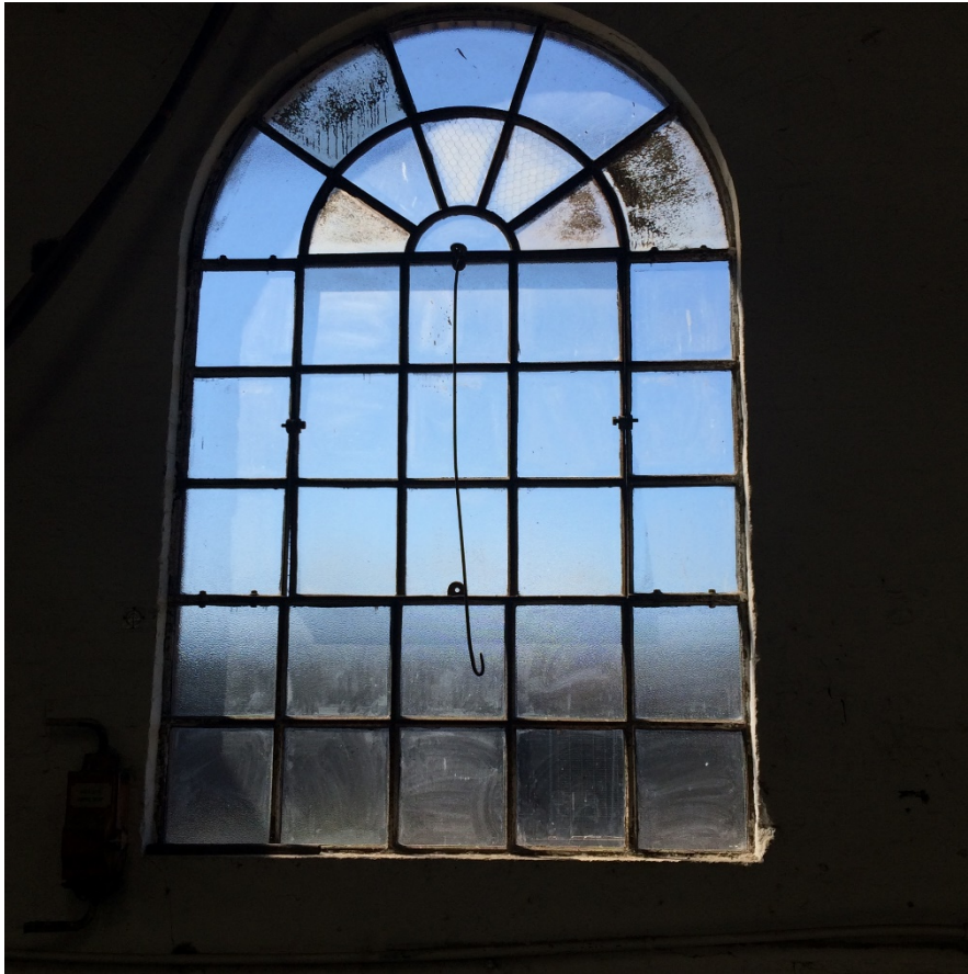
Figure 2: Heritage arched window – internal view

Curio considers to be essential for the wording of the Conditions of Consent to be altered in order to ensure that the windows maintain their integrity and original quality, without having any visual impact on the heritage fabric of the building, as it will secure the new glass panels match the original ones surrounding them. The proposed wording is described below: