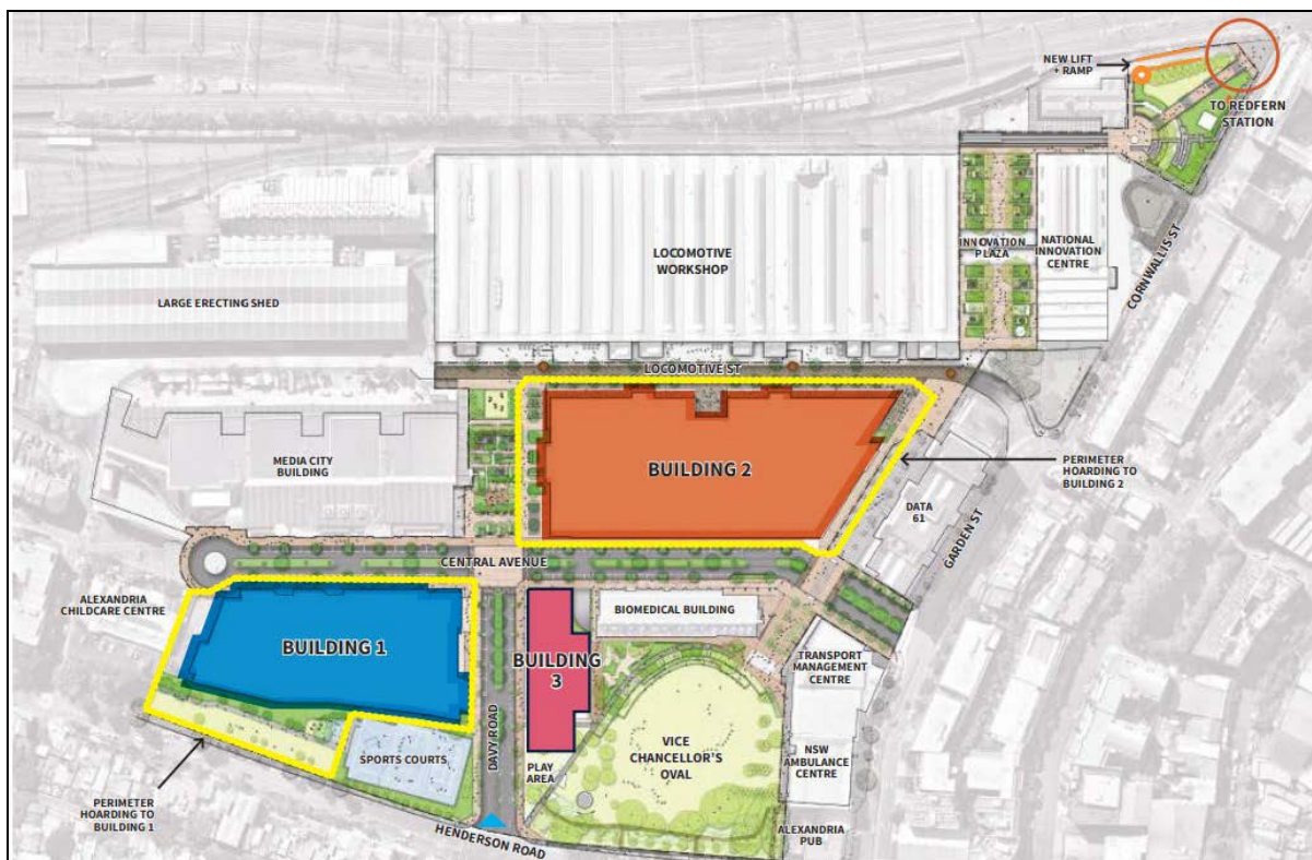
Figure 1 | The Australian Technology Park

The site is the Locomotive Workshop, located within the northern portion of the ATP. The ATP is located approximately 5 km south of the Sydney central business district (CBD), 8 km north of Sydney airport and 200 m from Redfern railway station ( Figure 1 ). The site is located within the City of Sydney local government area (LGA).