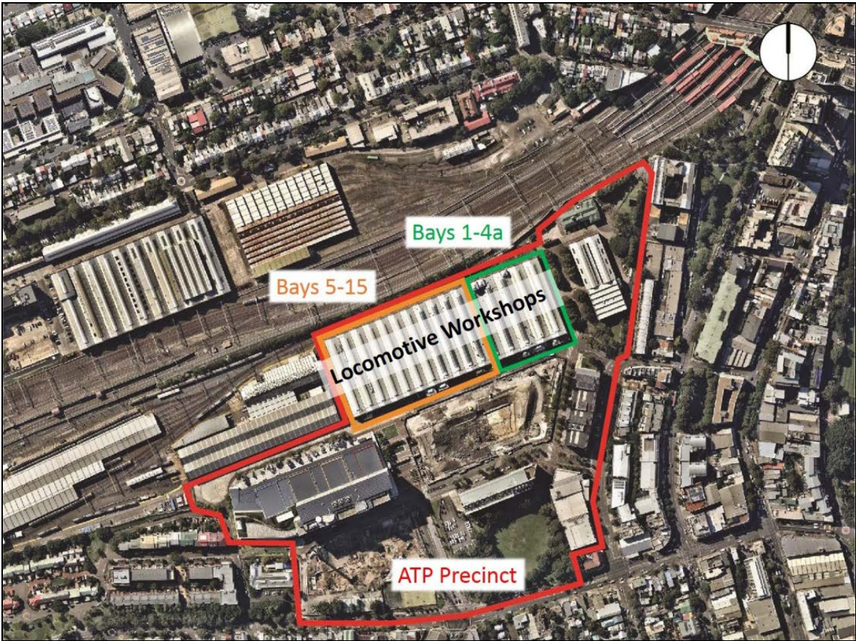
Figure 2 | Aerial view of Locomotive Workshop and ATP

The Locomotive Workshop is divided into 16 equal sized bays orientated north south. Bays 1 to 4a contained trades, including blacksmiths and boiler makers, while Bays 5 to 15 contained machines, tool and assembly areas ( Figure 2 ). The workshop shut in 1988 and converted to commercial office space in the mid-1990s.