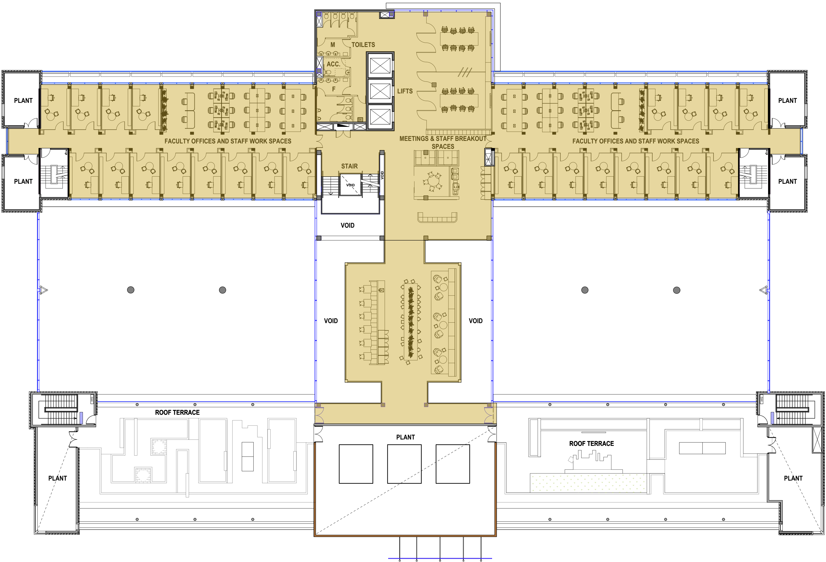
25 WALLY'S WALK B - LEVEL 6

Ryde Local Environment Plan 2014 gross floor area means the sum of the floor area of each floor of a building measured from the internal face of external walls, or from the internal face of walls separating the building from any other building, measured at a height of 1.4 metres above the floor, and includes: (a) the area of a mezzanine, and (b) habitable rooms in a basement or an attic, and (c) any shop, auditorium, cinema, and the like, in a basement or attic, but excludes: (d) any area for common vertical circulation, such as lifts and stairs, and (e) any basement; (f) storage, and (g) any area for common vertical circulation, such as lifts and stairs, and (h) any space used for the loading or unloading of goods (including access to it), and (i) terraces and balconies with outer walls less than 1.4 metres high, and (j) voids above a floor at the level of a storey or storey above.