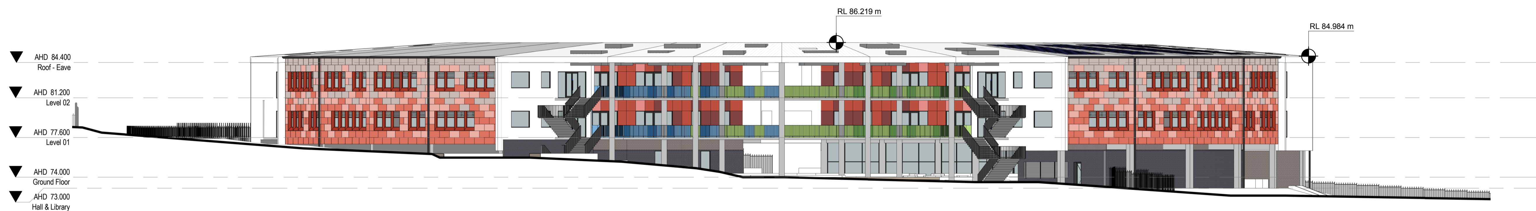
2 South East Elevation 2100 1:200