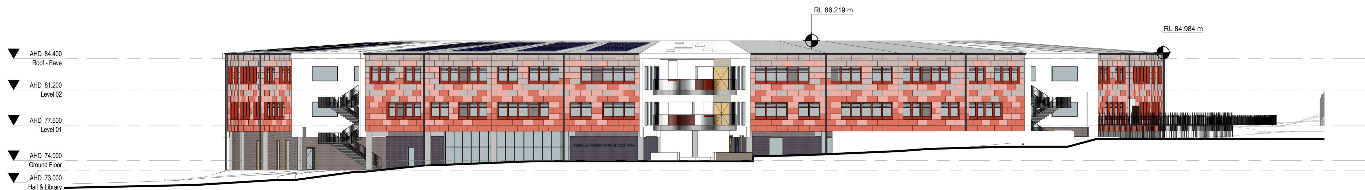
4 North West Elevation 2100 1:200