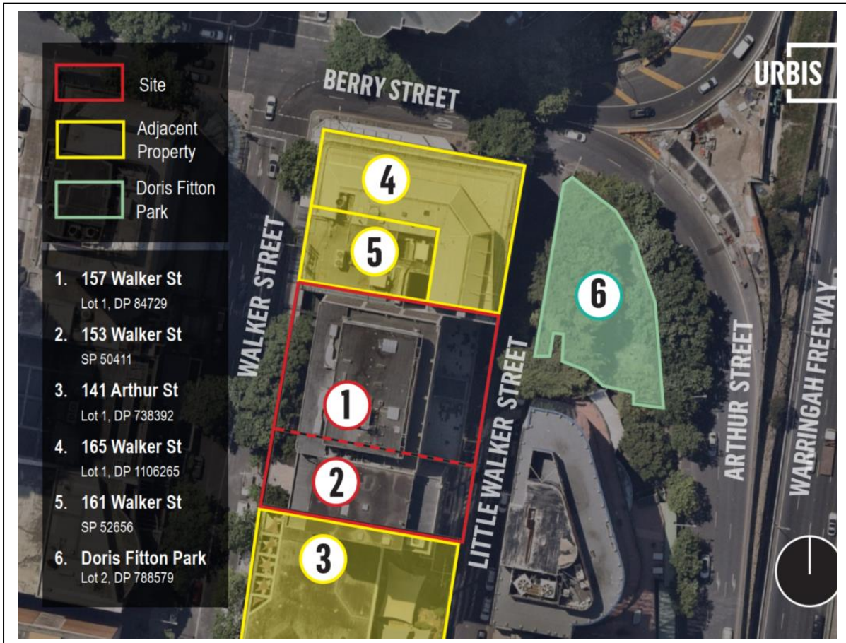
Figure 1: Site Plan

The site is located at 153-157 Walker St, North Sydney NSW, as shown in Figure.1 (boundaries are indicative only). The site has frontages to Little Walker Street and Walker Street, with vehicle access via Little Walker Street.