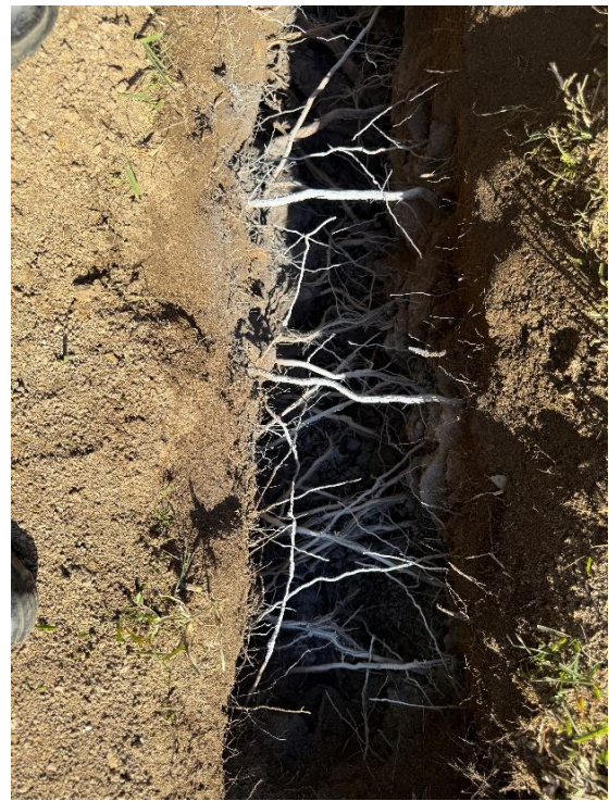
Figure 1. Dead Root 30mm