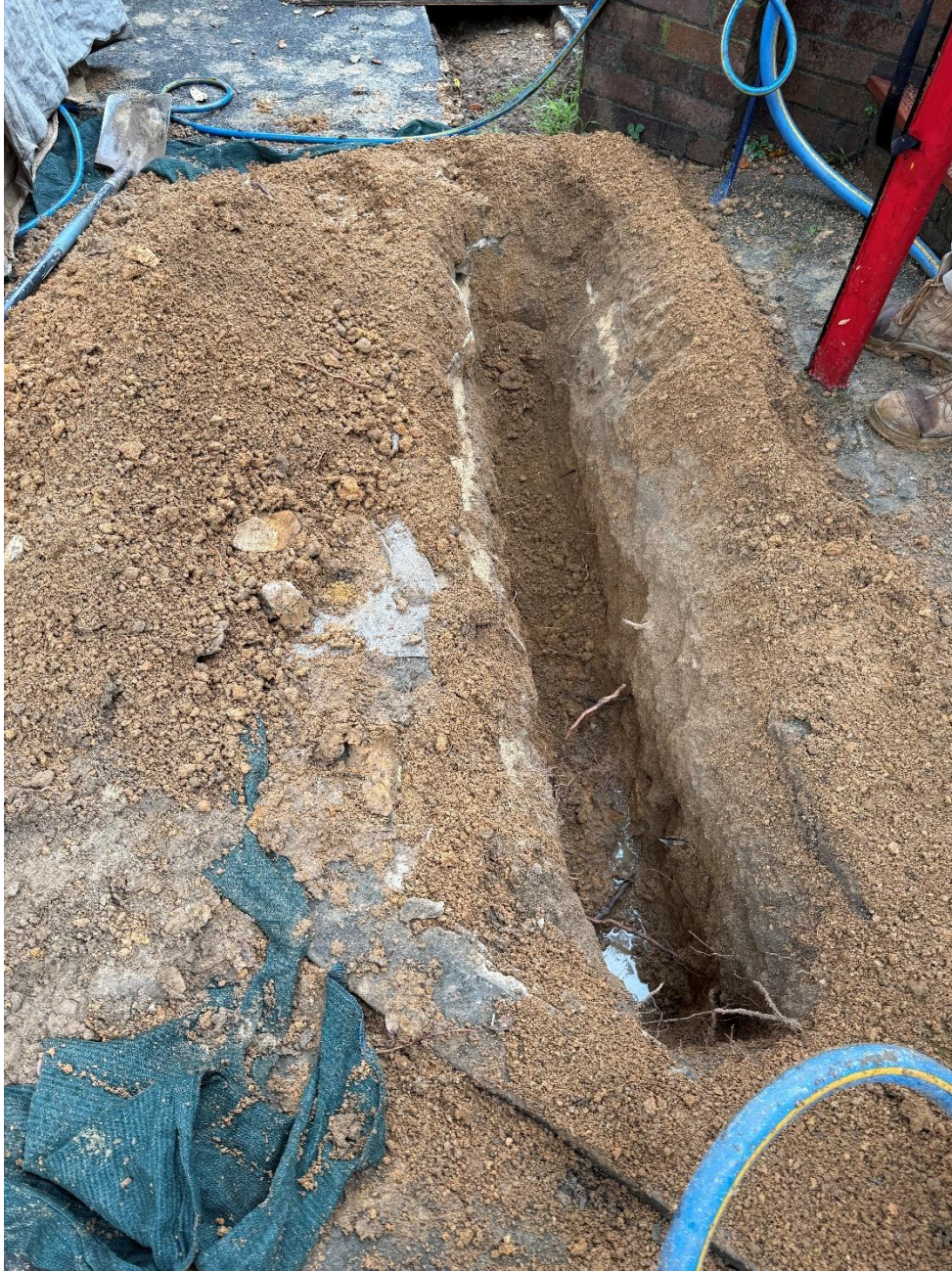
Tree 18 A. Trench to 2m length 600mm depth