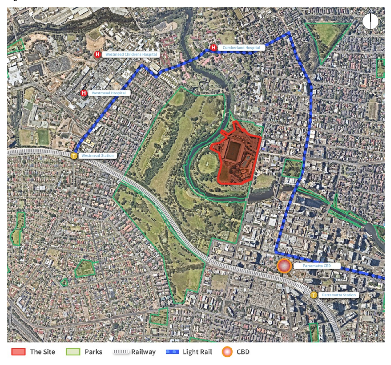
Figure 1 – Site context Plan

The site has an area of approximately 95,000m<sup>2</sup> and owned by Venues NSW and The Parramatta Park Trust. The site is irregular in shape and is illustrated in Figure 2 below.