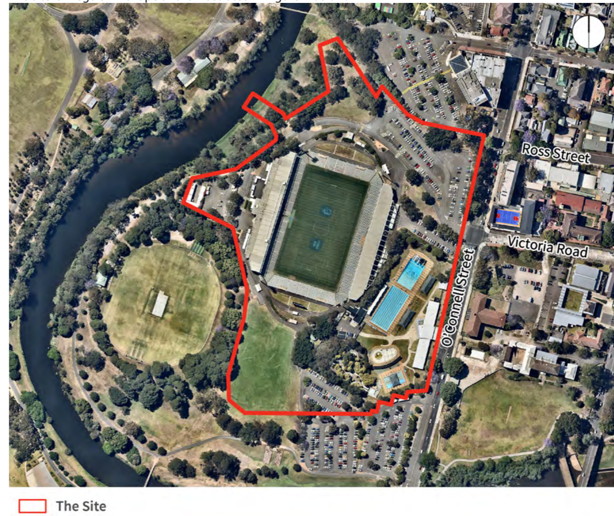
Figure 2 – Site Aerial Plan

The site is irregular in shape and is illustrated in Figure 2 below.