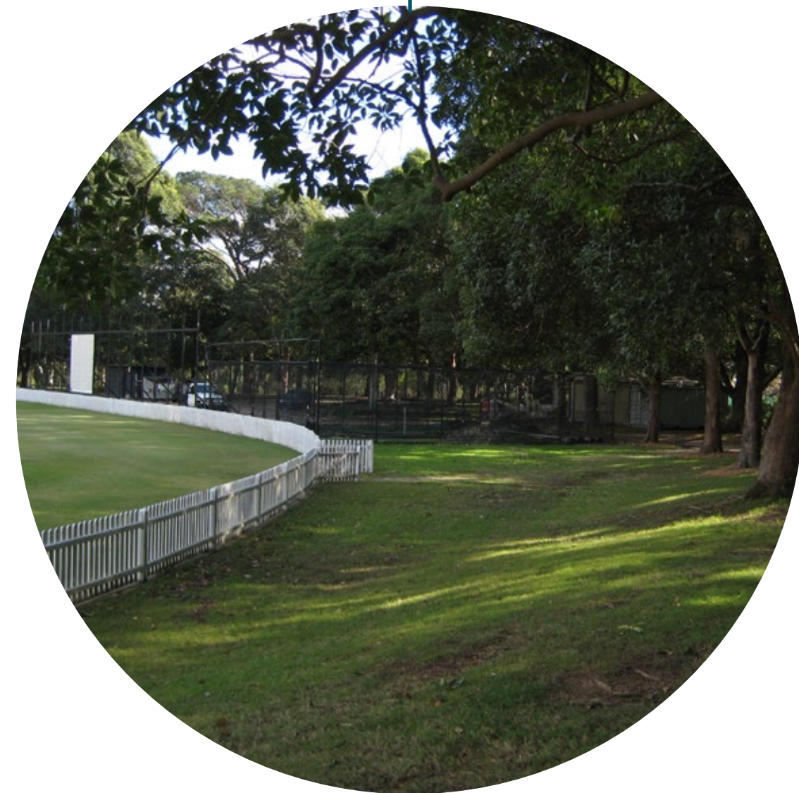
Significant tree canopy retained around Old Kings Oval