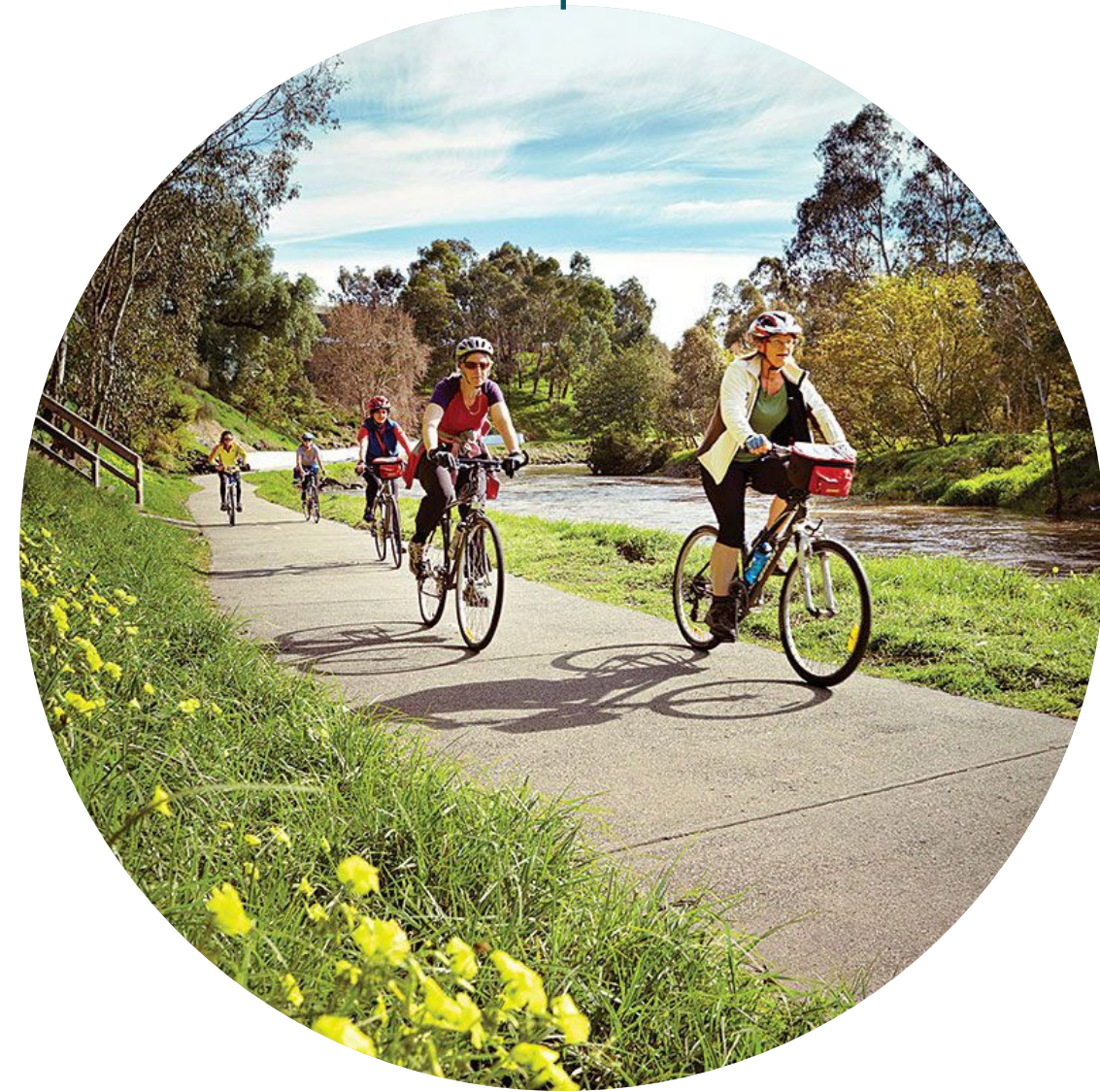
Shared path for pedestrians and cyclists create connections through site, improving ease of circulation through site.