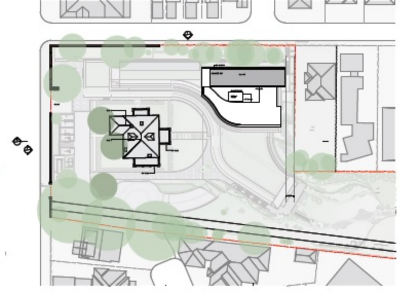
Revised Layout Plans in response to Community Consultation No. 01 L/Roof