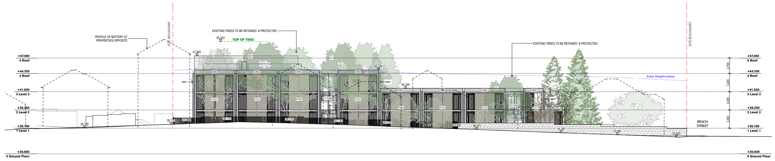
1 ELEVATION Battery Street Elevation 1:200