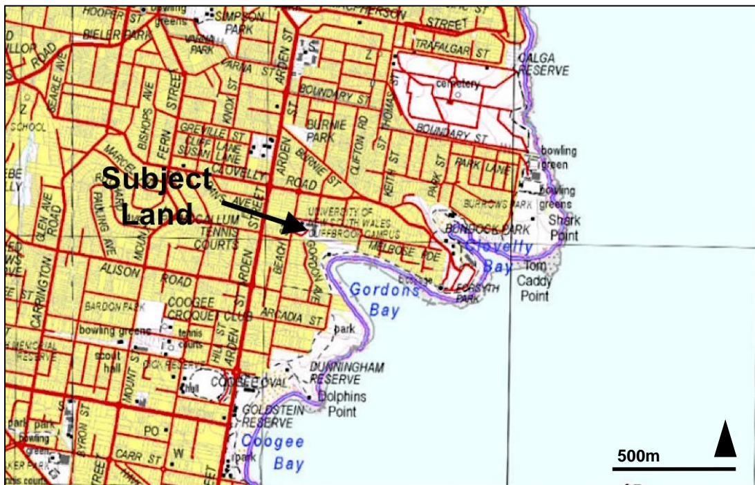
Figure 1. The subject land in its local context.

The subject land is approximately 1.15ha in size and is situated on Gordon's Bay, approximately 6km southeast of the Sydney CBD and 10km north of Botany Bay ( Figure 1 ). It is located within the Randwick Local Government Area, Parish of Alexandria and lies within the Office of Environment and Heritage Metropolitan South West Region. It is bounded to the south by Gordon's Bay, to the west by Beach Street, to the north by Battery Street and to the east by Tower Street (Error! Reference source not found.). The subject land currently contains the UNSW Cliffbrook Campus which comprises four main buildings (CC1 - CC4) with thoroughfares and car parking areas, landscaped gardens and lawns, as well as steeply sloping vegetated land above the bay. The centrepiece is the landmark, state heritage-listed 1920s mansion - Cliffbrook House (CC1). Most of the buildings are currently tenanted as offices, with the majority (including the offices of UNSW Press) located in Building CC4. In addition, Lot 8 DP8162 (10 Battery St) is an adjoining residential allotment which is also under consideration as part of the current assessment