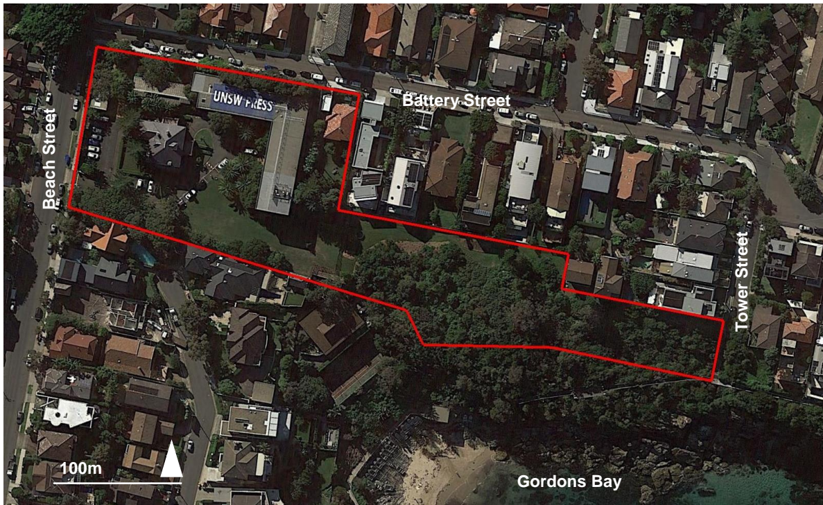
Figure 2. Aerial view of the subject land.