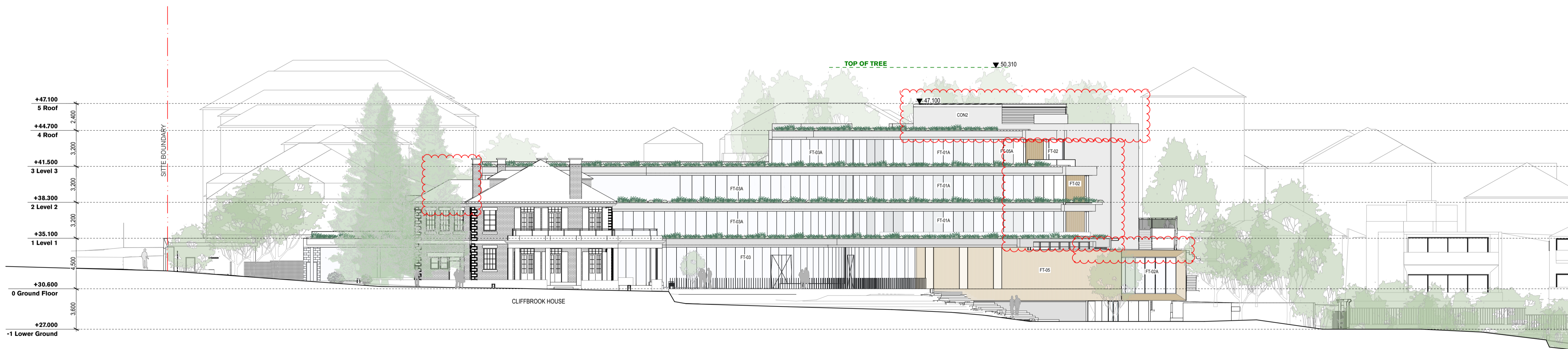
04 ELEVATION South Elevation 1:200