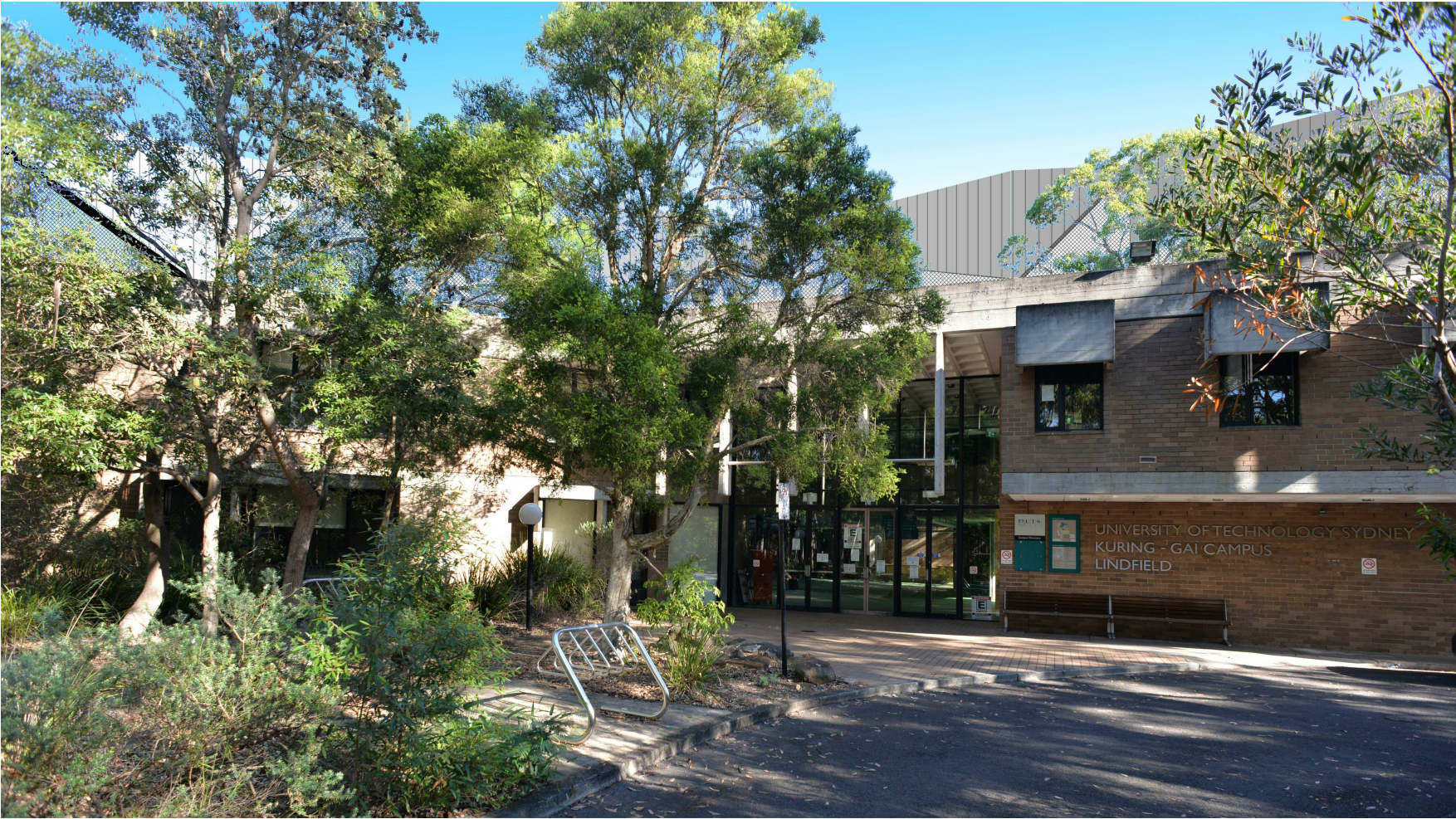
EXTERNAL VIEW OF MAIN ENTRANCE - PHASE 1 & 2