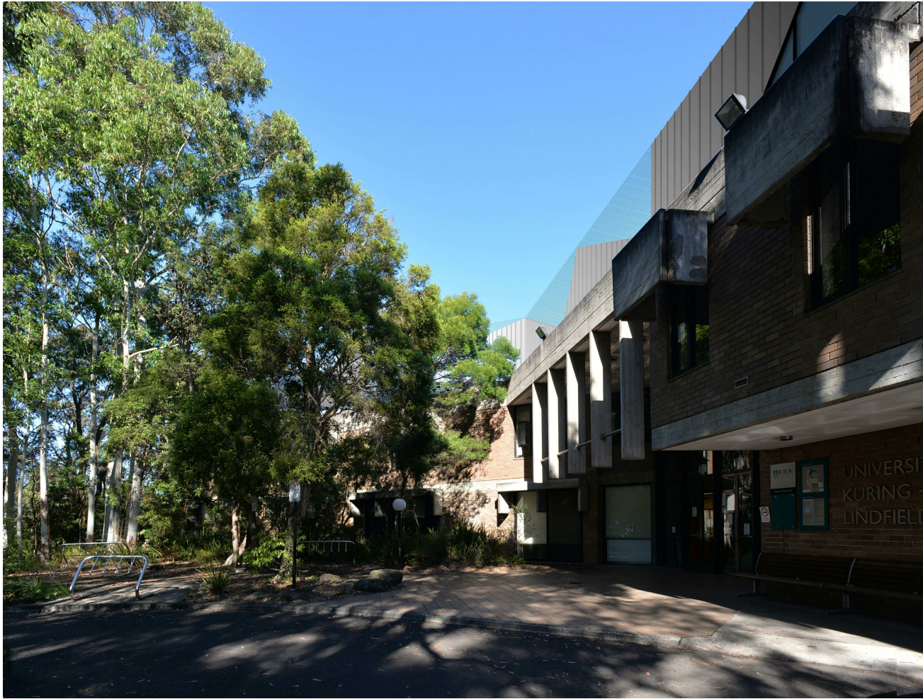
EXTERNAL VIEW OF MAIN ENTRANCE - PHASE 1 & 2