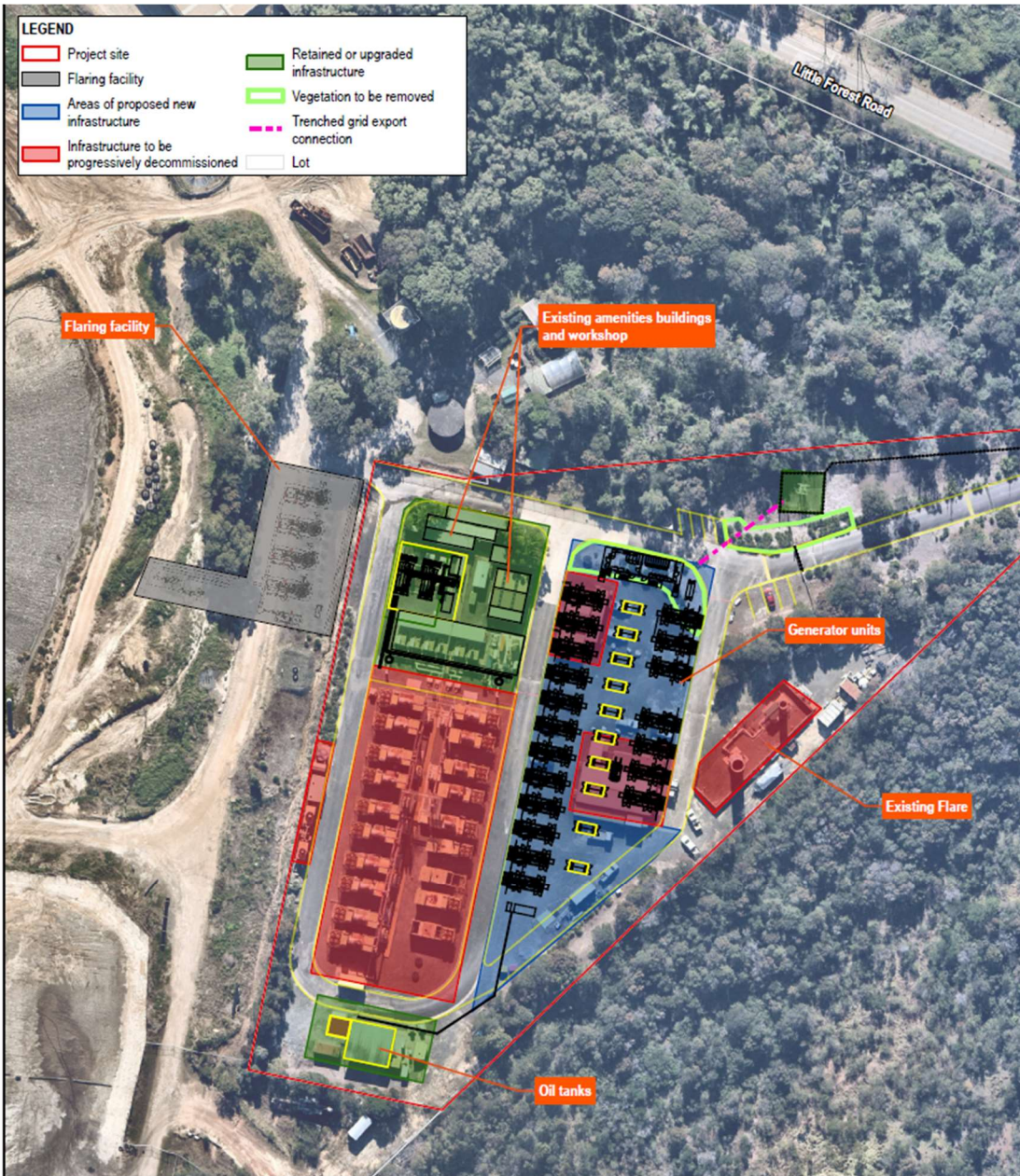
Figure 3 Proposed Plan