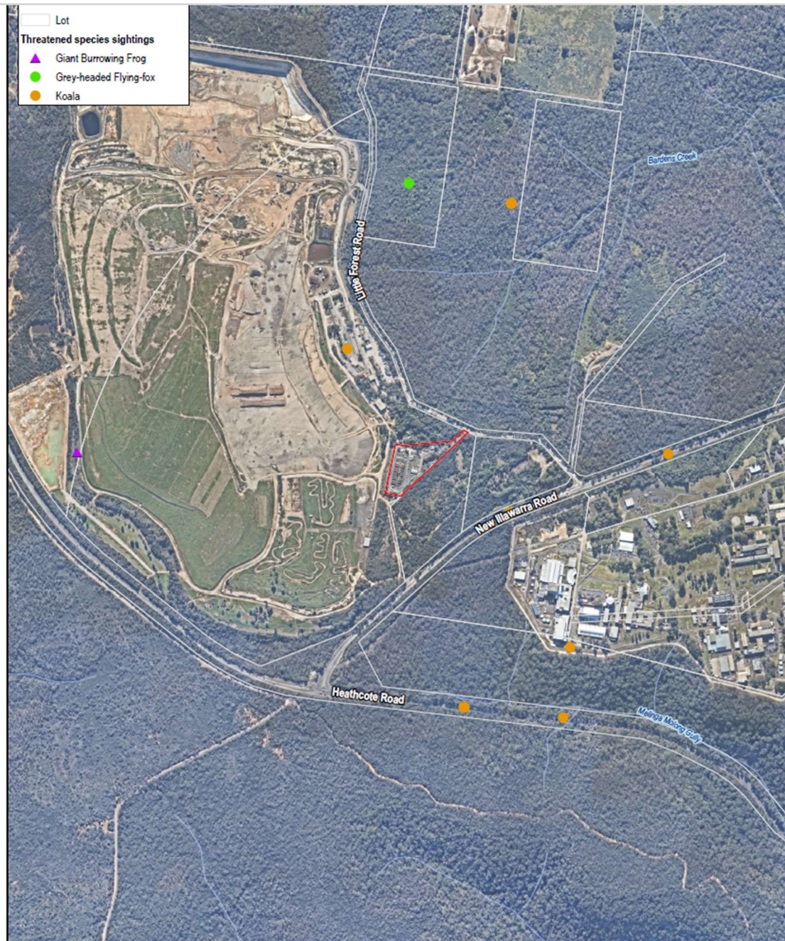
Figure 4 Threatened Species Records