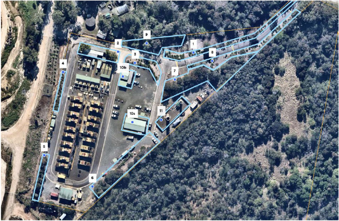
Figure 2 Location key of vegetation and potential biodiversity values within the project site (Nearmap, 2025)