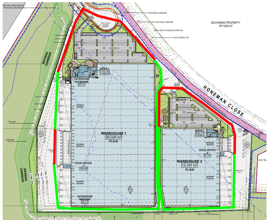
Figure 2 – Perimeter Vehicular Access Non-compliances