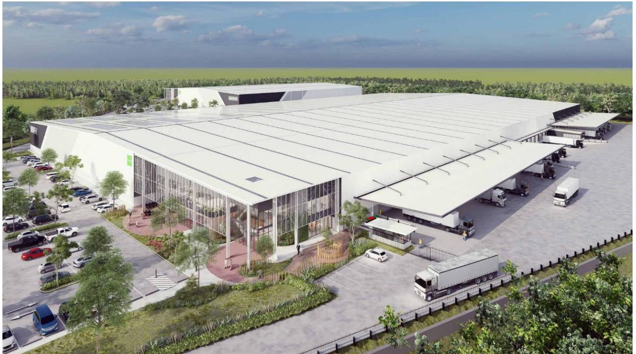
Figure 1 – Artist Impression WH1 – North-East (Source: SBA Architects Dwg. No. DA10/A)

bm+g have been commissioned by Goodman to undertake an assessment of the Honeman Close Industrial Facility at Honeman Close, Huntingwood against the relevant provisions of the Building Code of Australia 2022 (BCA) for SSD 79500208 application . Note: See full project description in Section 2.1.