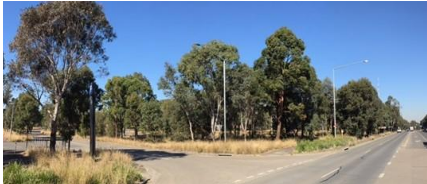
Before (23 August 2017) Looking south across P5 Carpark entry and Hill Road intersection