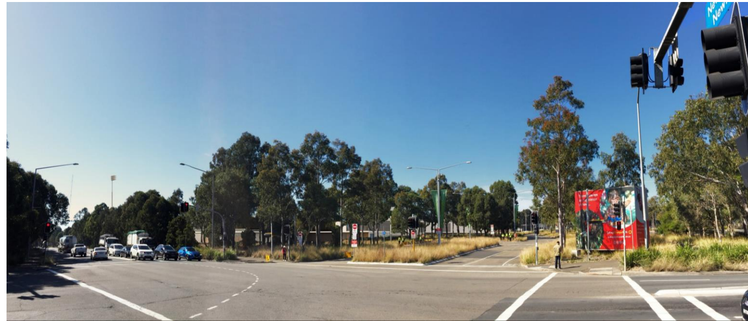
Before (23 August 2017) Looking east across Holker Busway and Hill Road intersection