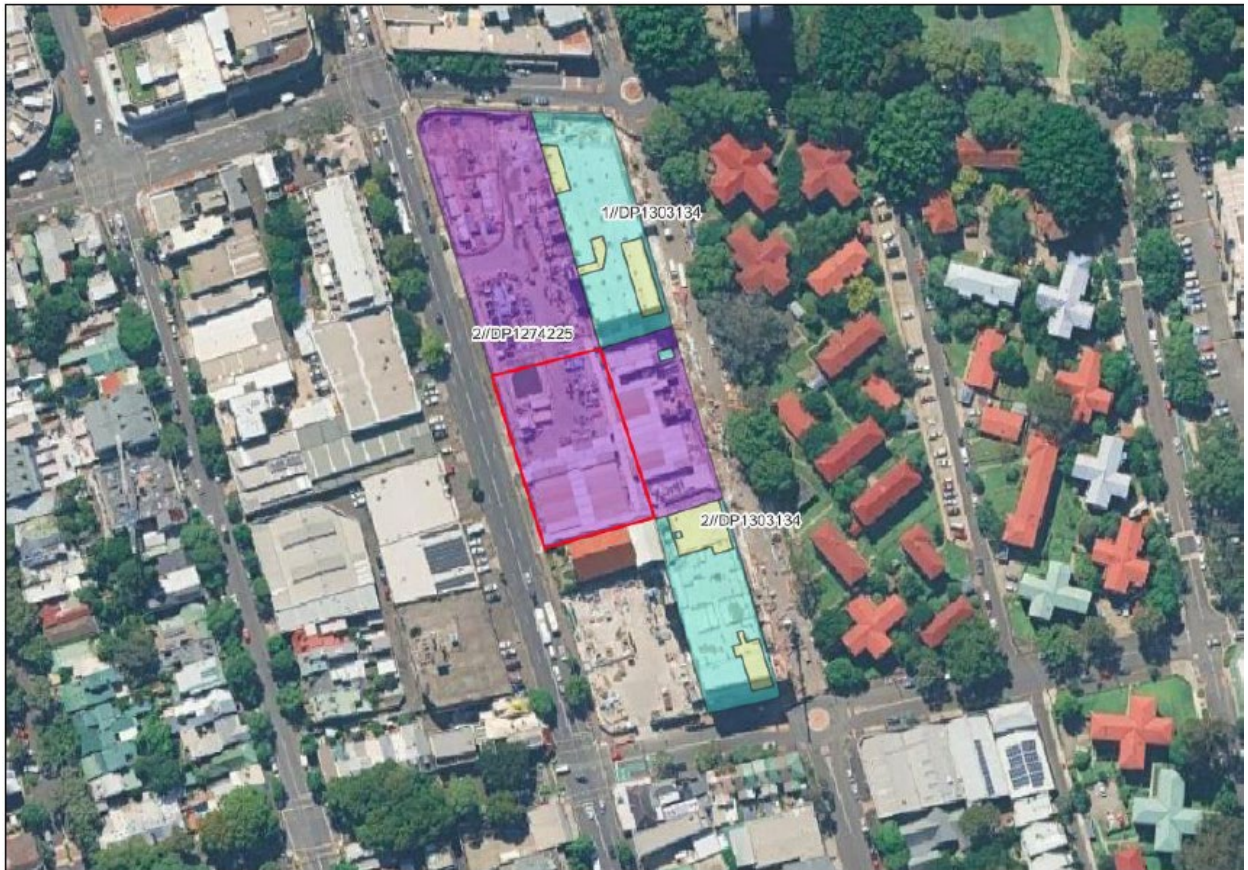
Figure 1 Location Map - (subject site shown in red)