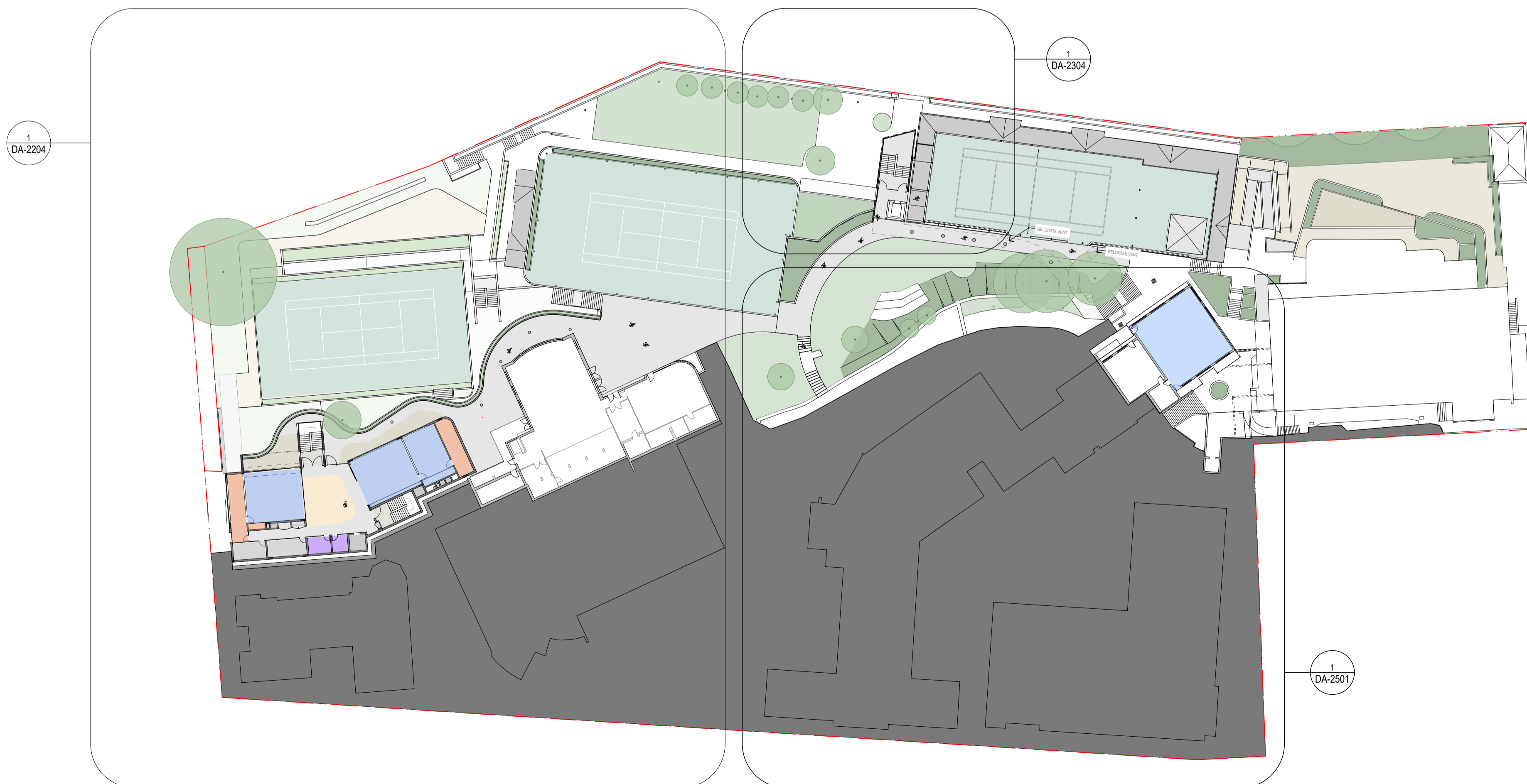
2 PLAN LOWER GROUND 1 1:500