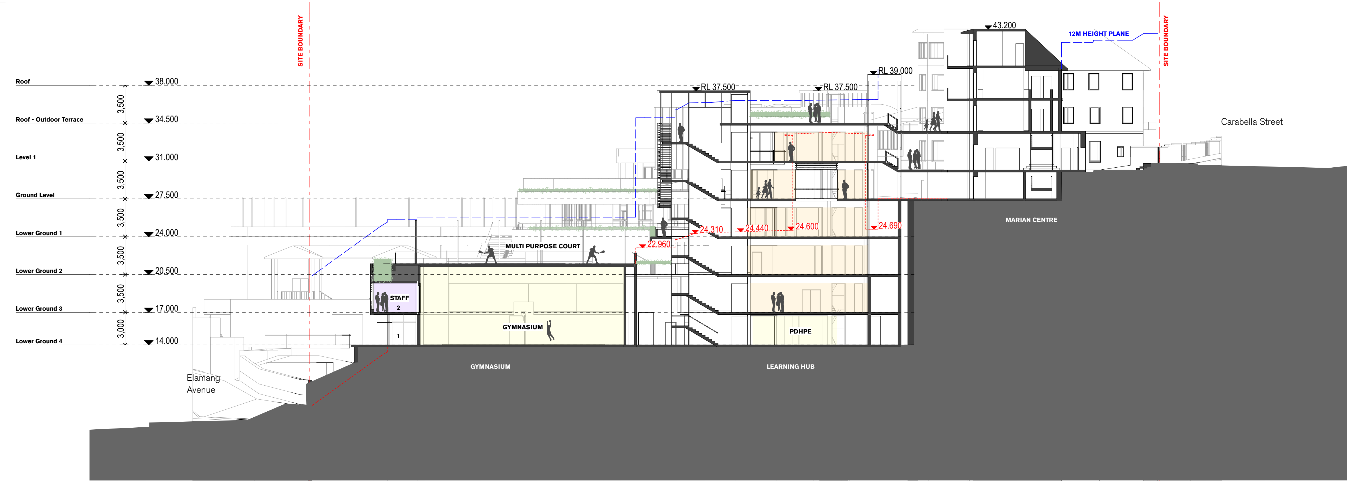
2 SECTION 1:200