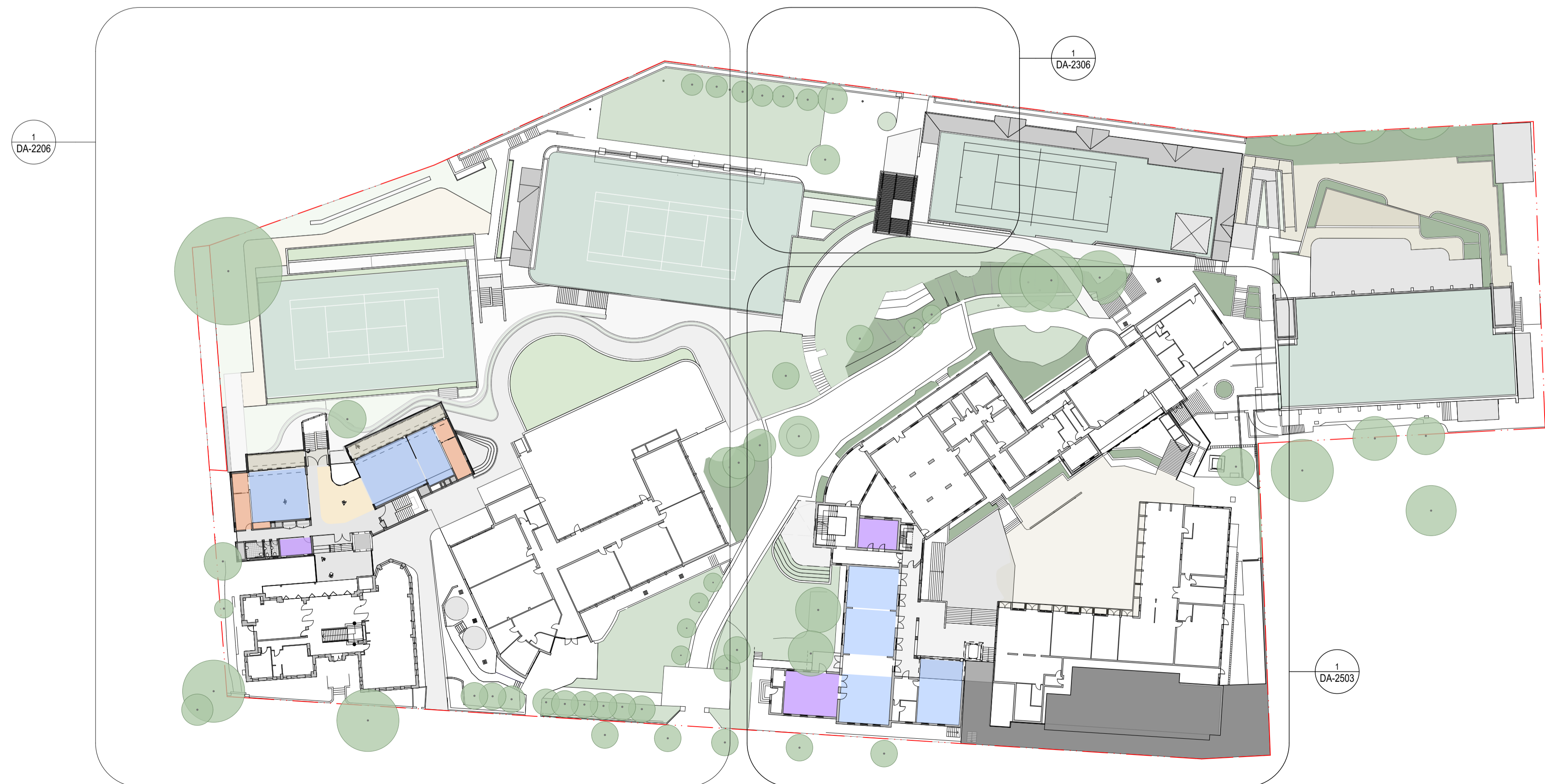
2 PLAN LEVEL 1 1:500