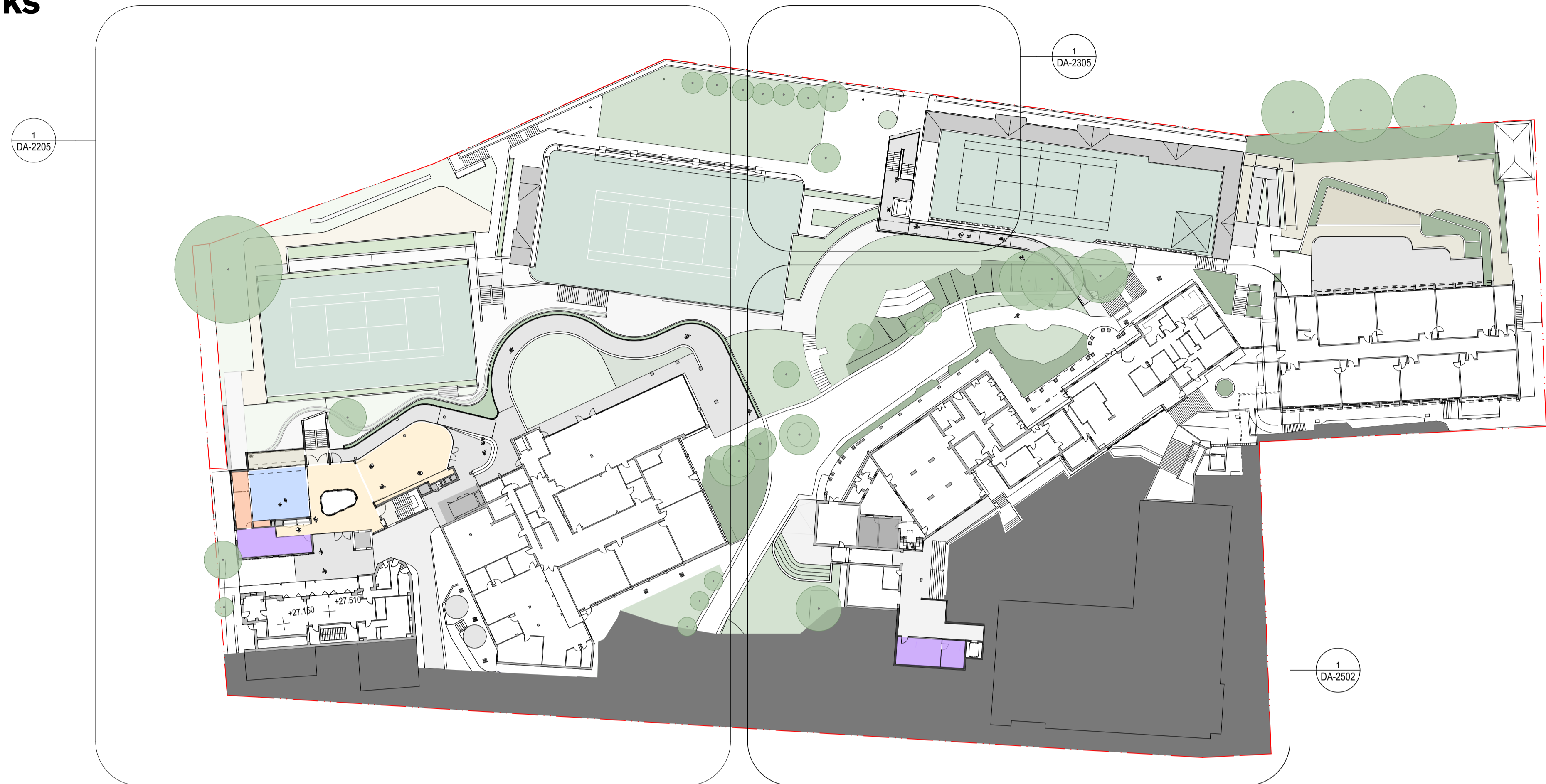
1 PLAN GROUND 1:500