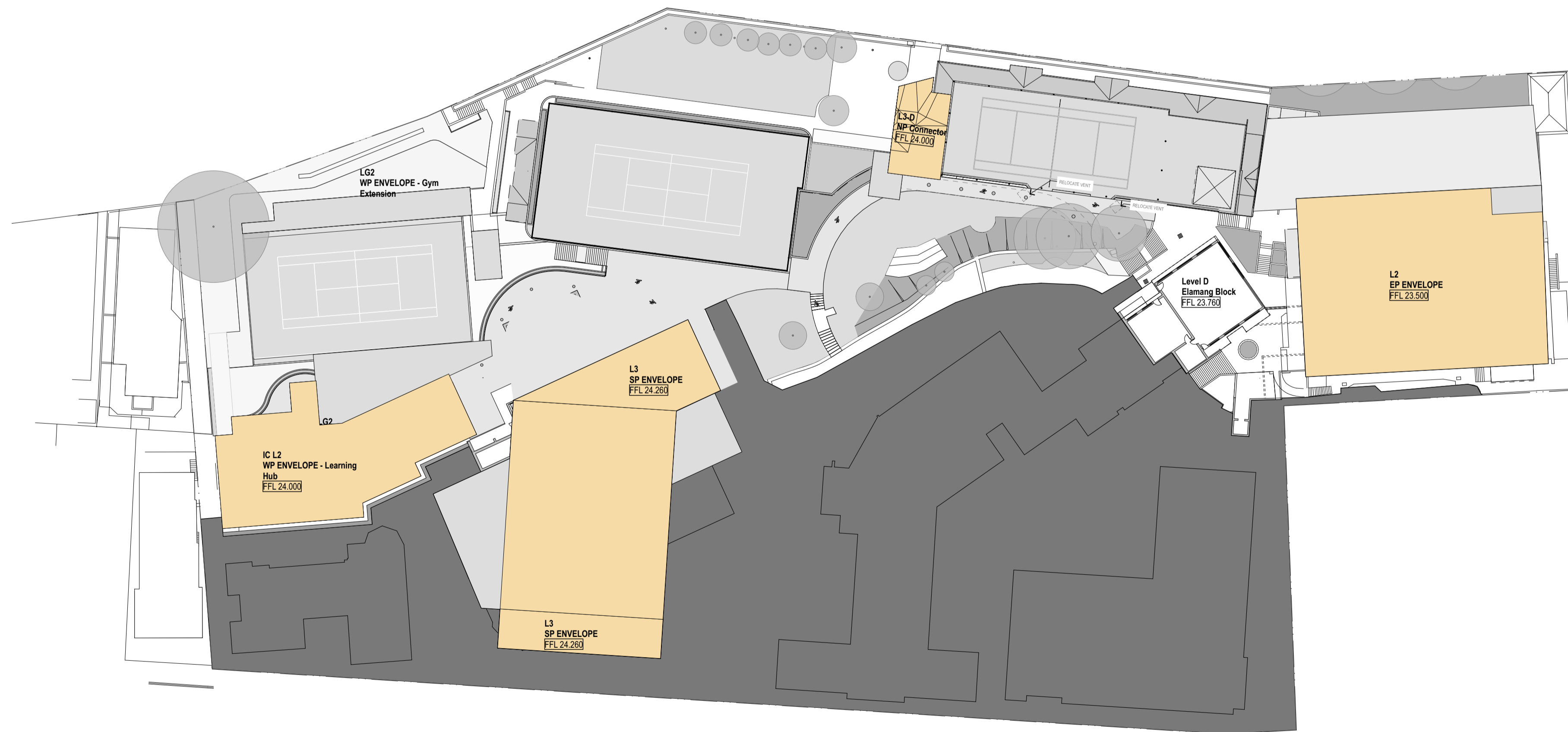
2 PLAN LOWER GROUND 1 1:500