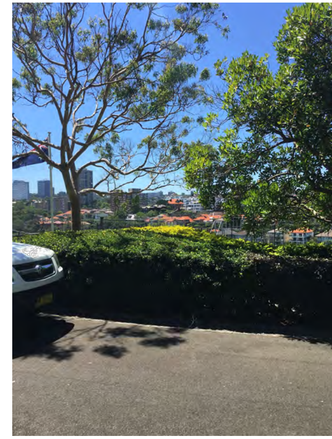
2 Harbour View from base of entry driveway