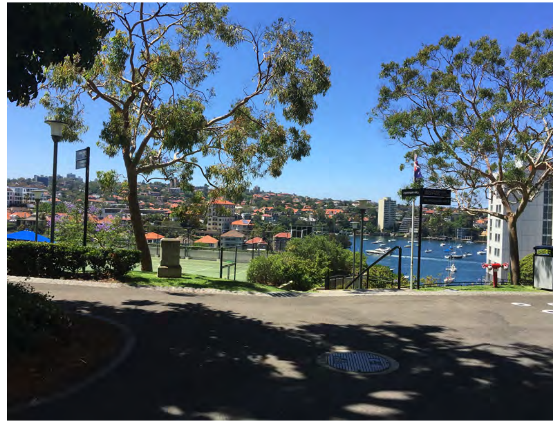
1 Harbour View from base of entry driveway