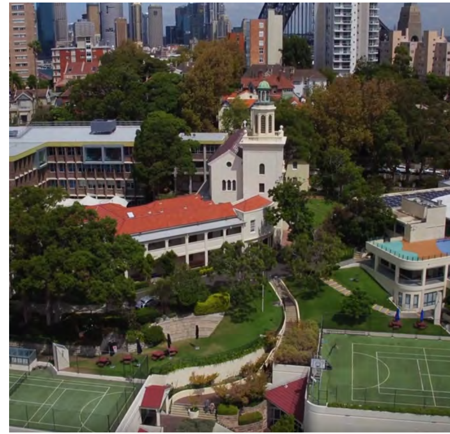
1 Potential Development Site 1 Site Area 500m 2