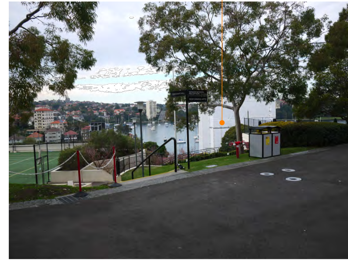
1 Harbour View from base of entry driveway