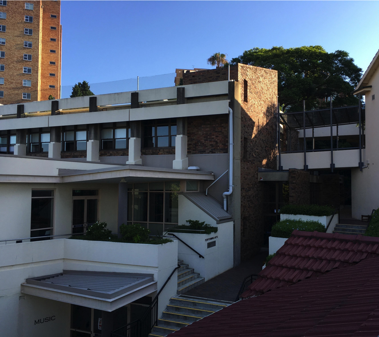
1 View south towards existing Mary Ward