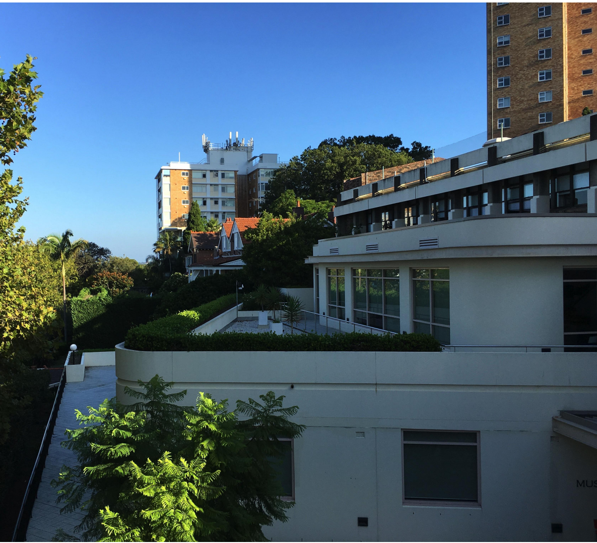
1 View east towards existing Performing Arts Building