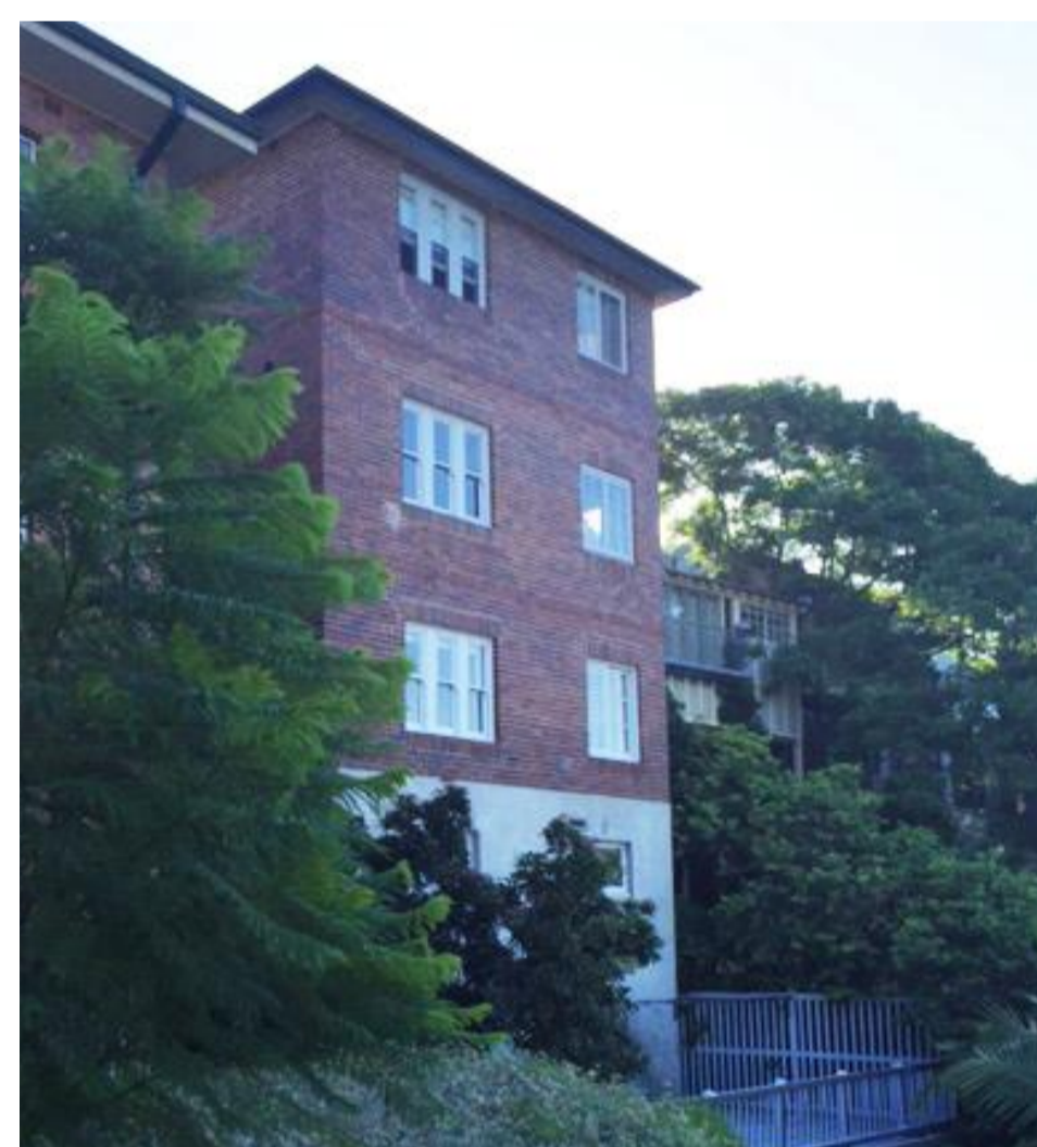
1 No. 111 Carabella Street - NE Elevation