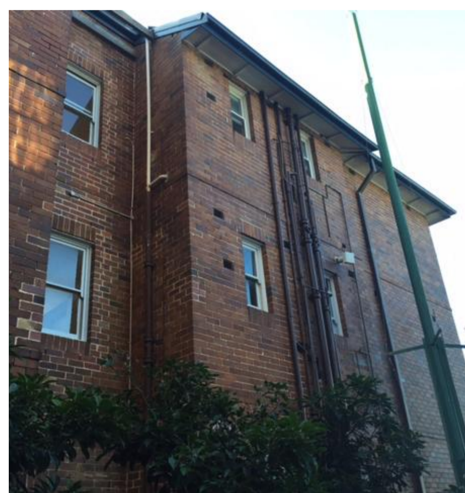
2 No. 111 Carabella Street - SE Elevation (site boundary)