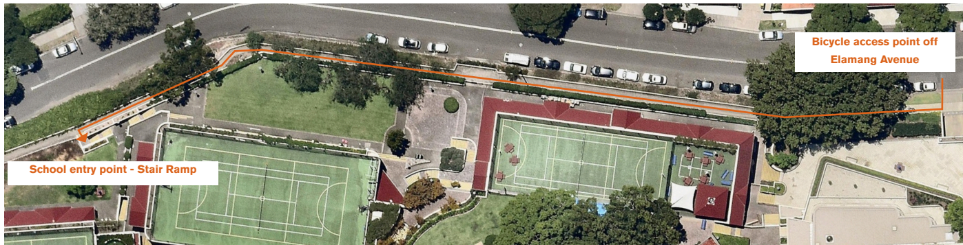
Figure 1 - Proposed access path from Elamang Avenue to School entry point.