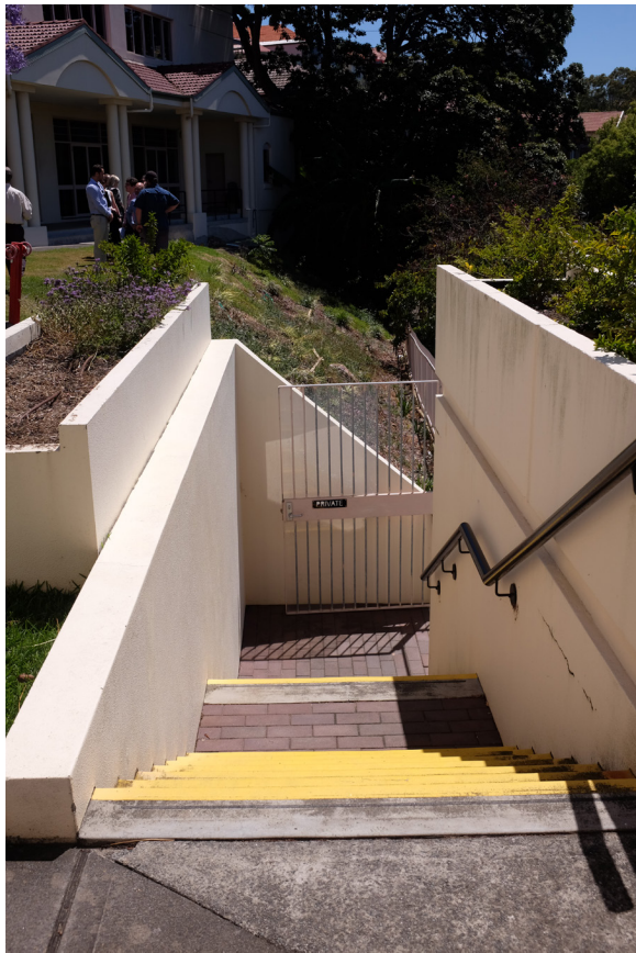
Figure 2 - Existing access stair from Elamang Avenue

Response: Approximately 20 bicycle parking spaces are able to be provided in the existing sports storage area on the lower ground level of Centenary Hall with the end of trip facilities within the adjacent Lower Ground level of the New Learning Hub. Access is able to be provided directly off Elamang Avenue via a stair ramp on the existing stairs.