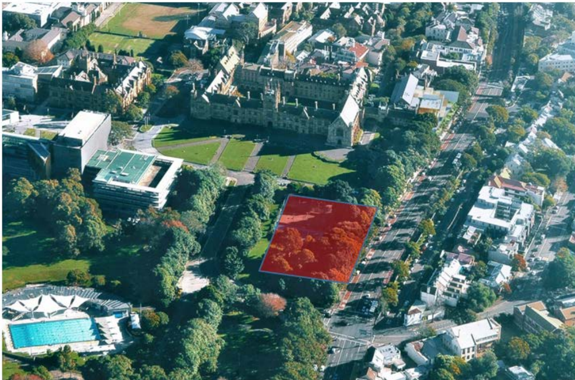
Figure 1: Aerial view of site

The development site is bound on all sides by trees of varying significance.