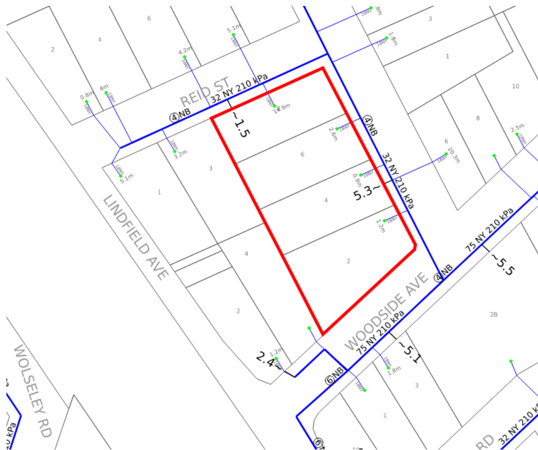
Figure 8. Jemena existing natural gas infrastructure layout for the site as per Dial Before You Dig (BYDA)