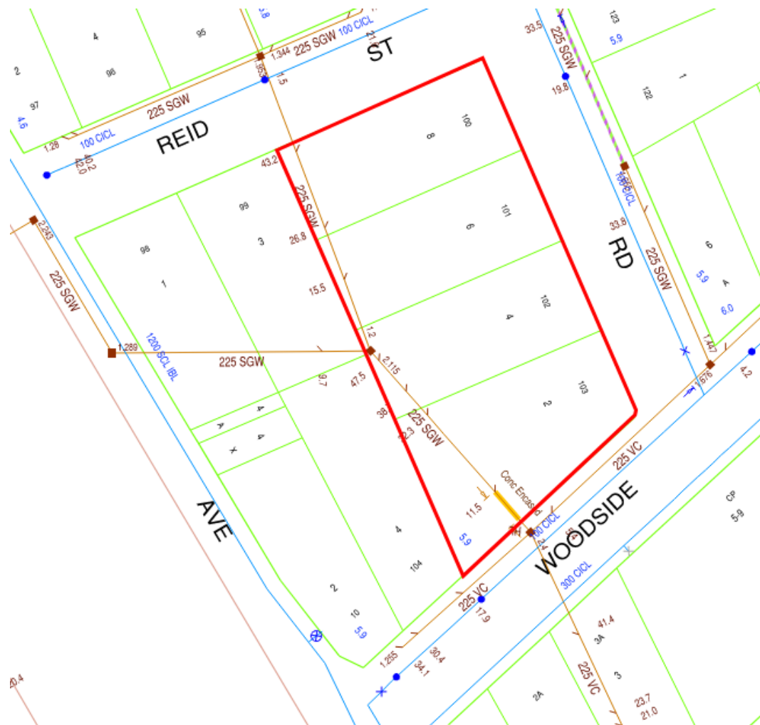
Figure 6. Sydney Water existing sewer infrastructure layout for the site as per Dial Before You Dig (BYDA)

These services can be utilized to accommodate the sanitary drainage connections for the proposed development.