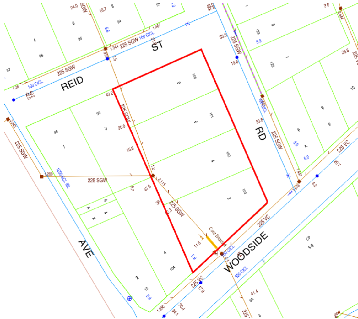
Figure 7. Sydney Water existing watermain infrastructure layout for the site as per Dial Before You Dig (BYDA)