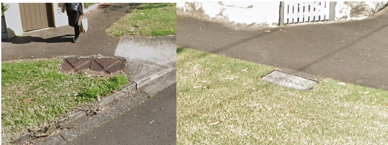
Figure 4. Existing manhole (left) and pit (right)

The various houses at Highgate Road are supplied with telecommunications supplies from the various Telstra pits and manholes along Highgate and Woodside Avenue.