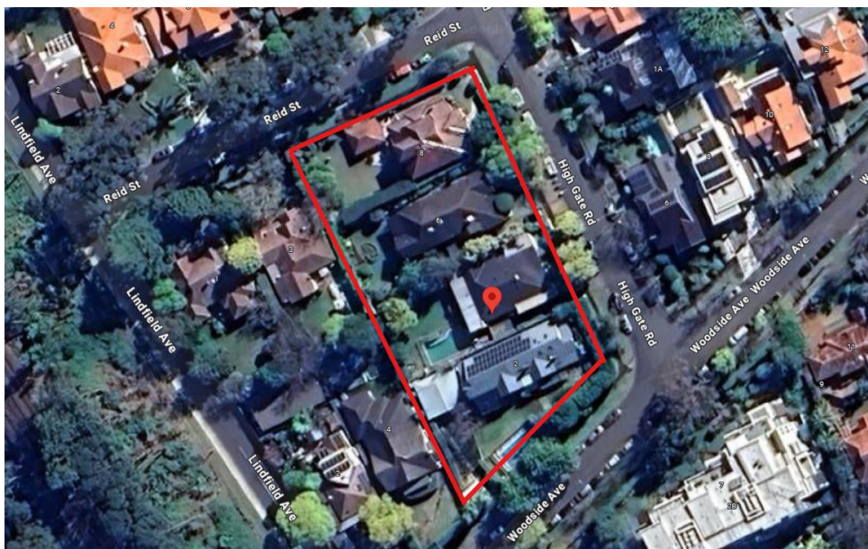
Figure 2. Existing houses

Currently the site is composed of four residential houses. The power is served aerially from two different street power poles which connect each residential house.