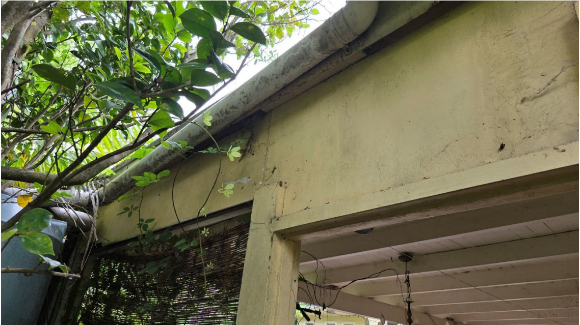
Photograph No. 19: Flat asbestos cement sheet cladding on external side of wall to rear covered verandah at 16 Bent Street