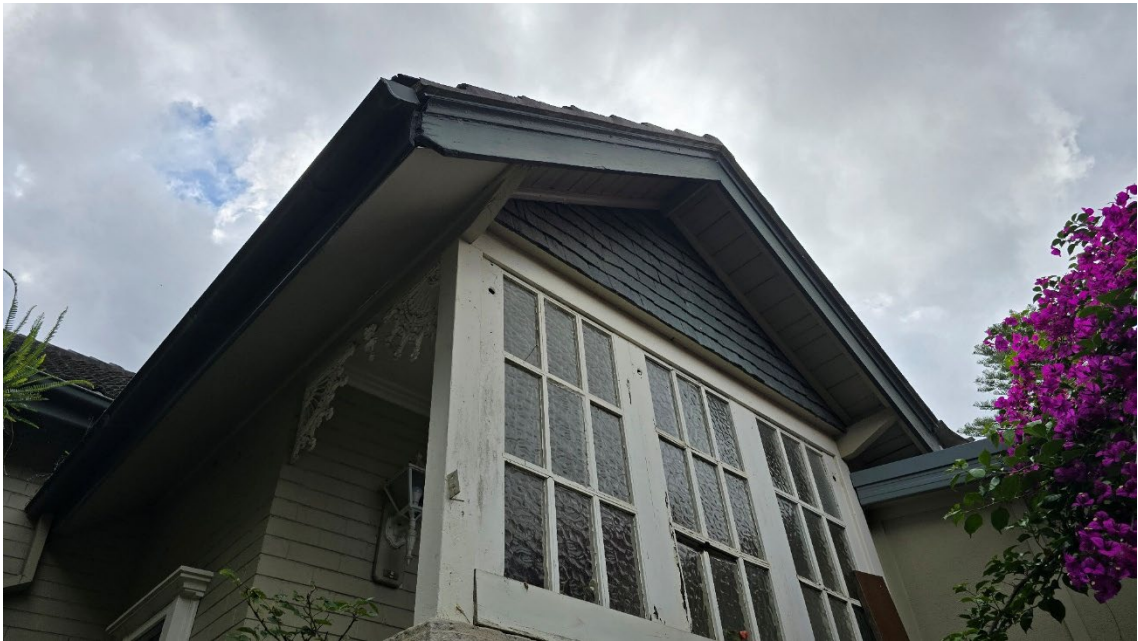
Photograph No. 17: Timber shingles on west side of house at 16 Bent Street. There may be asbestos cement sheet substrate behind these shingles