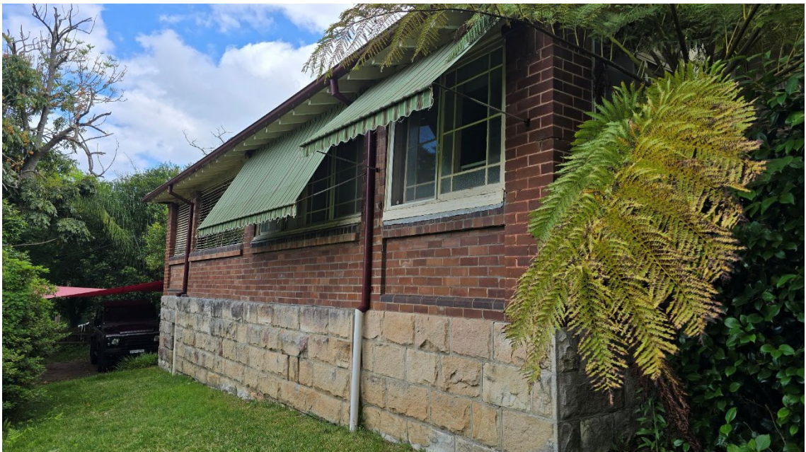
Photograph No. 2: West side of house at 14 Bent Street