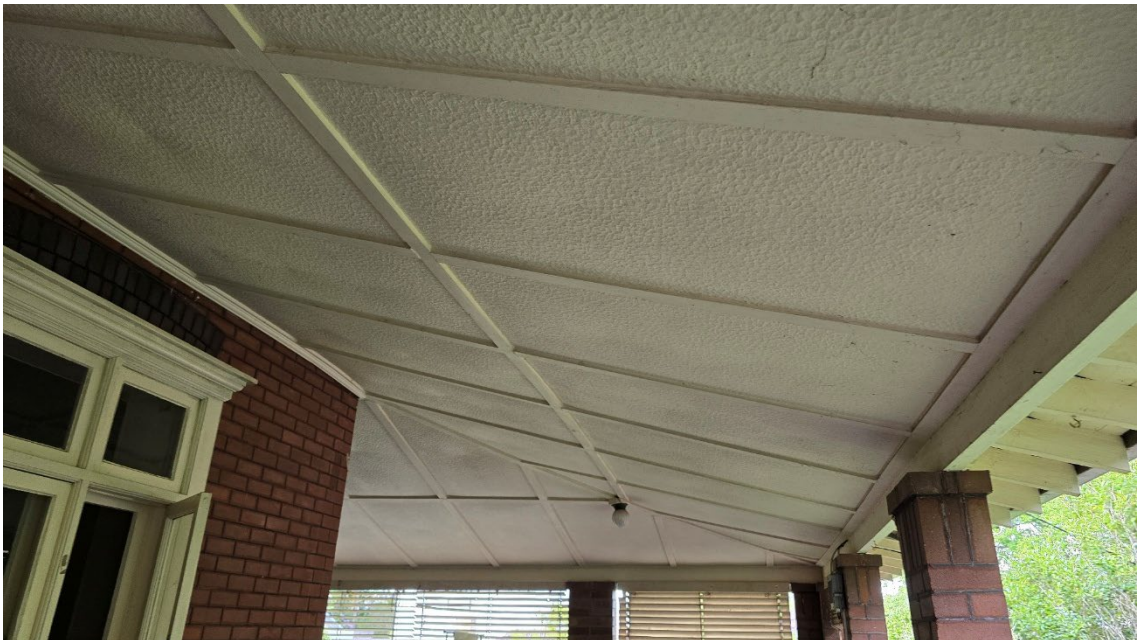
Photograph No. 4: Fibrous plaster ceiling lining over front verandah at 14 Bent Street