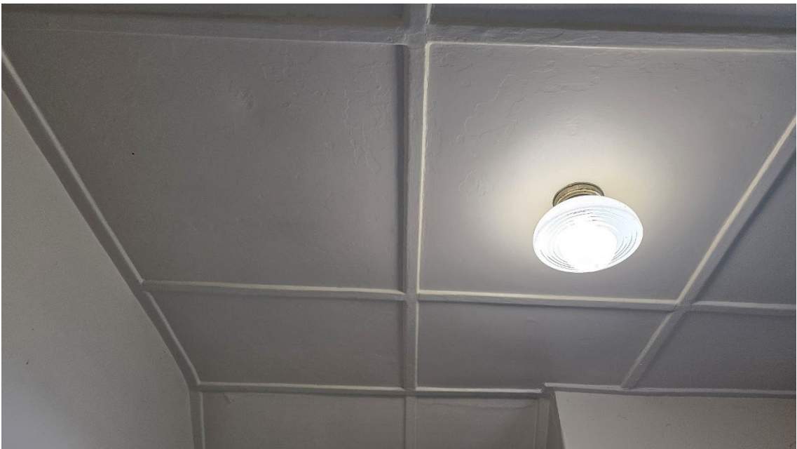
Photograph No. 7: Flat asbestos cement sheet ceiling lining in kitchen at 14 Bent Street