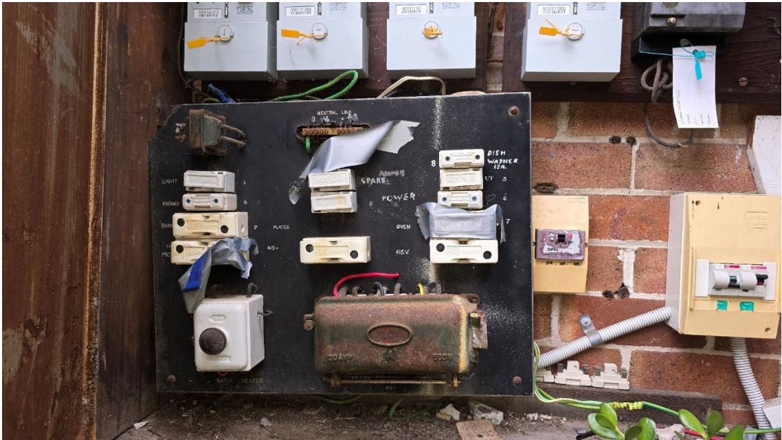
Photograph No. 13: Asbestos based backing board in electrical supply cabinet at 16 Bent Street