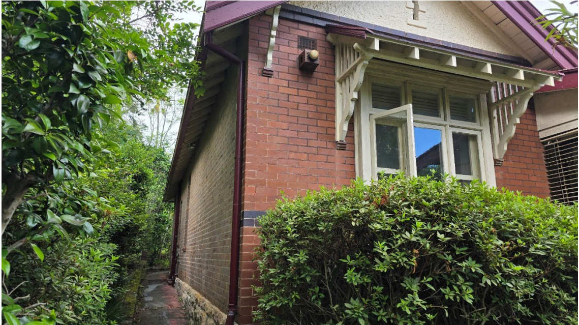
Photograph No. 1: Front north east area of house at 14 Bent Street