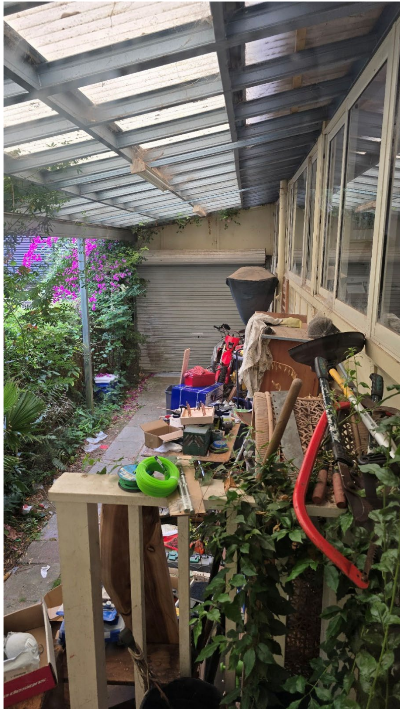
Photograph No. 12: Interior of west side garage at 16 Bent Street. The cladding to the wall of the house and around the roller door is flat asbestos cement sheet