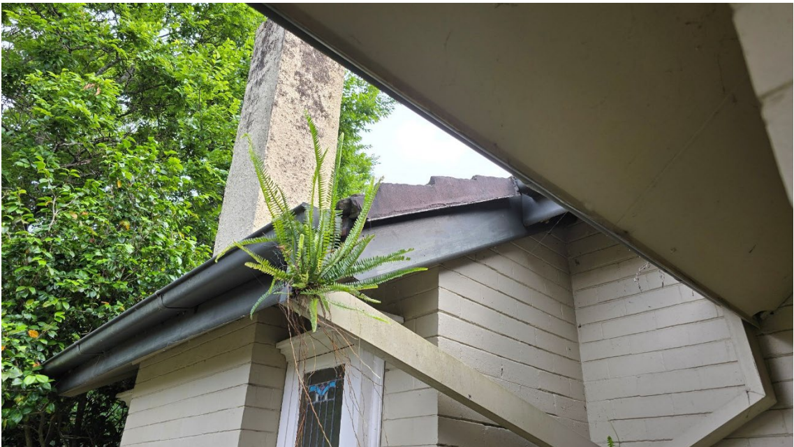
Photograph No. 16: Asbestos cement sheet eave lining and supporting strip below verge tile on west side of house at 16 Bent Street