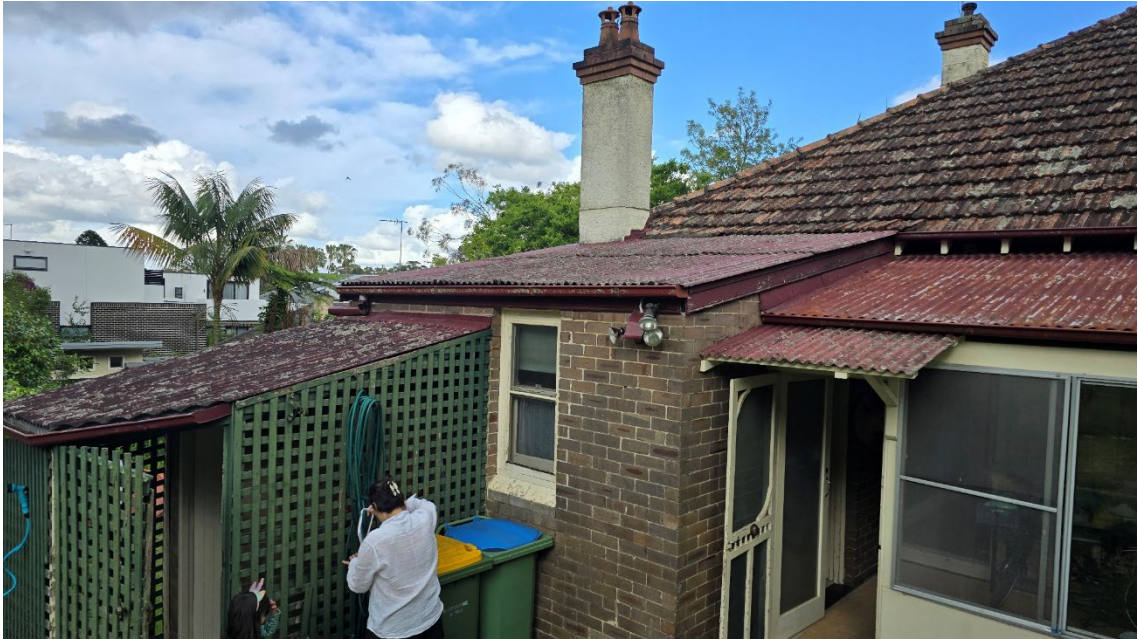
Photograph No. 3: Three asbestos cement sheet roofs on rear side of house at 14 Bent Street. These roofs are over the laundry, rear toilet and rear entry