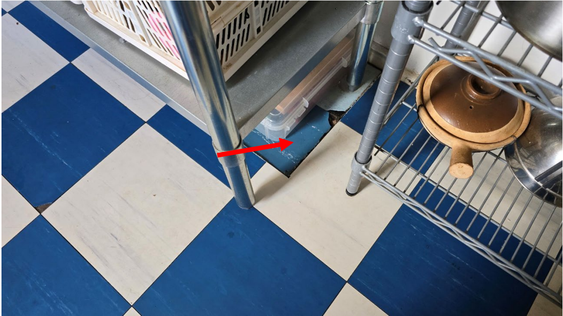
Photograph No. 8: Vinyl floor tiles in kitchen. Arrow indicates lower layer of tiles which were analysed and confirmed to contain chrysotile asbestos