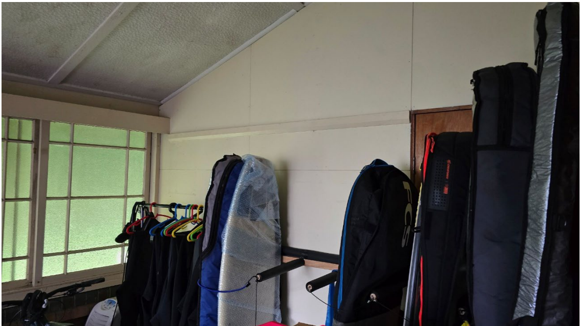
Photograph No. 9: Fibrous plaster ceiling lining and plywood wall lining in centre west enclosed sun room at 14 Bent Street