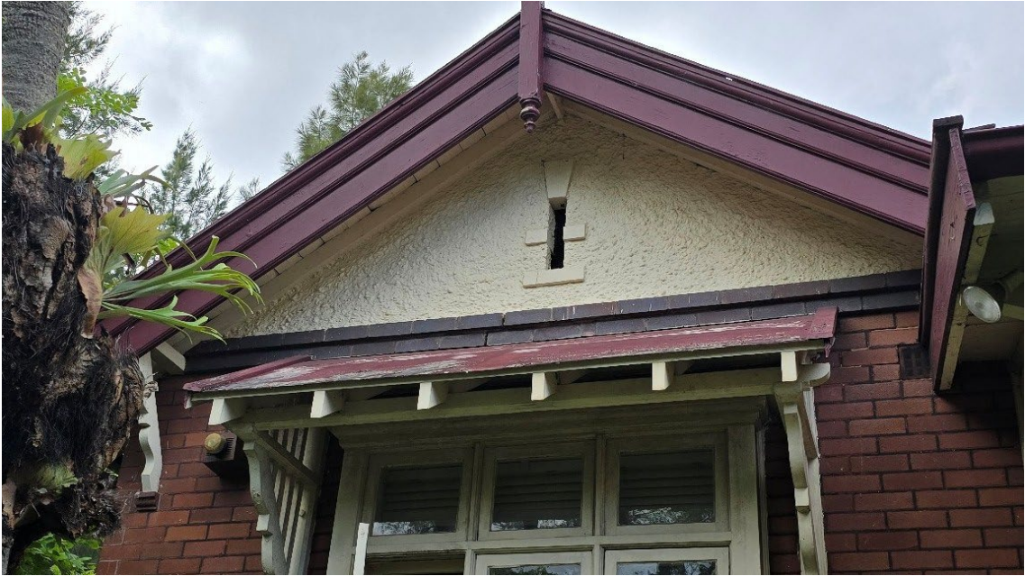
Photograph No. 6: Front of house showing gable roof end where the verge tiles are presumed to be supported on flat asbestos cement sheet. The roof of the window awning is flat asbestos cement sheet