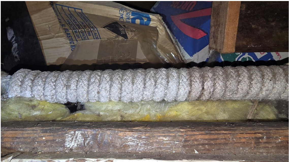
Photograph No. 14: Close view of asbestos rope insulation on pipe in ceiling space at 16 Bent Street