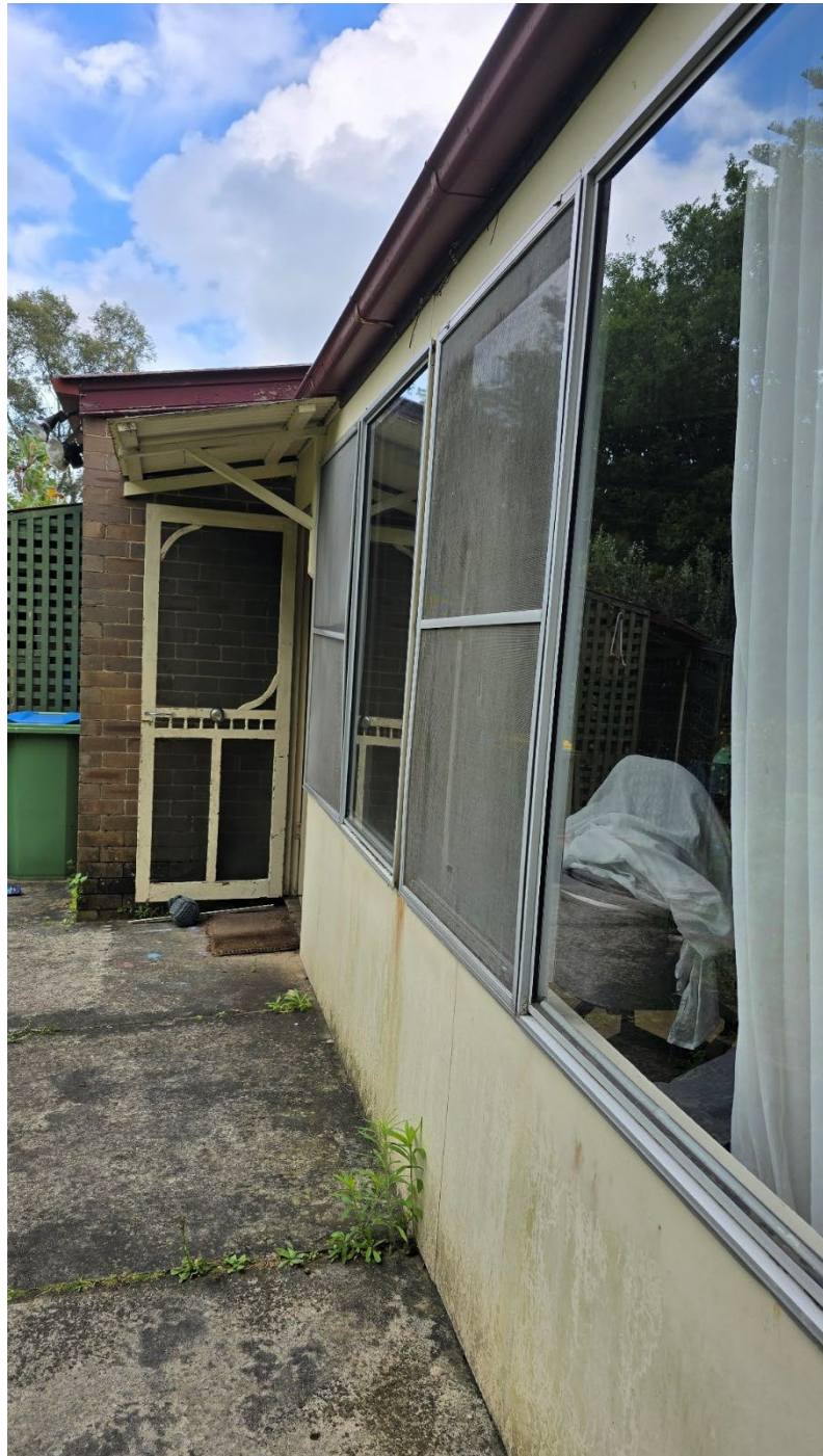
Photograph No. 5: Flat fibrous cement sheet cladding on rear external wall at 14 Bent Street. A sample of this material was found to be free of asbestos