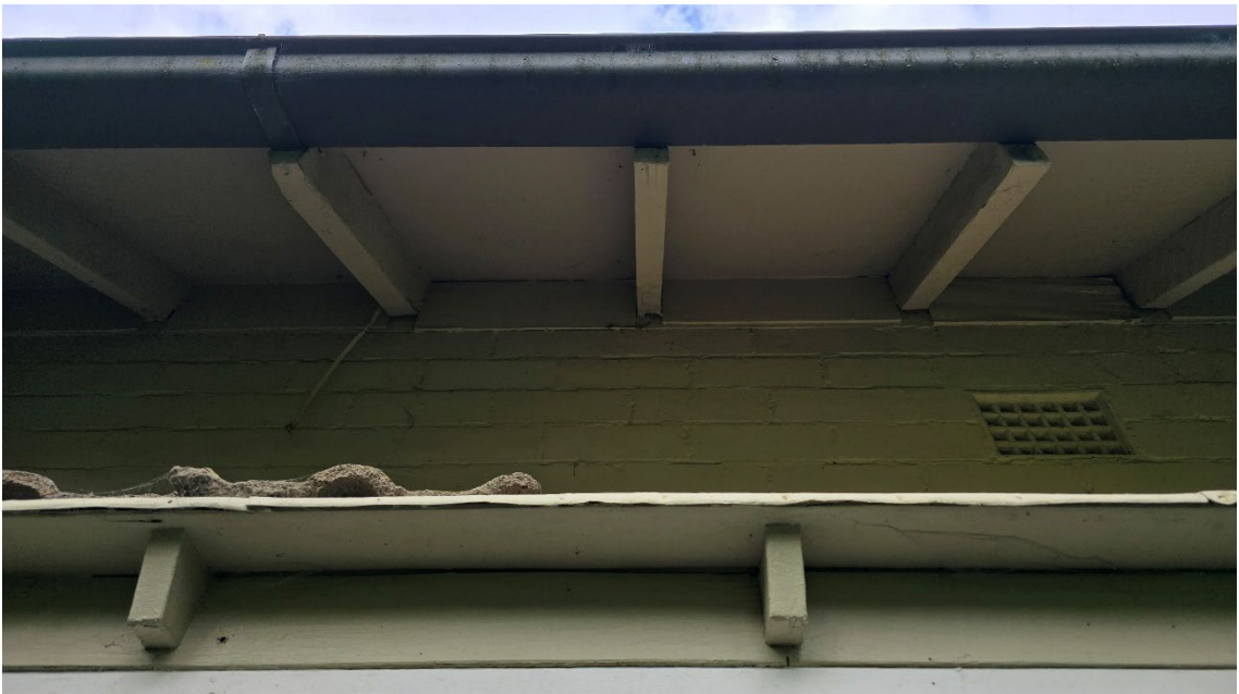
Photograph No. 20: Flat asbestos cement sheet eave lining on east side of house at 16 Bent Street