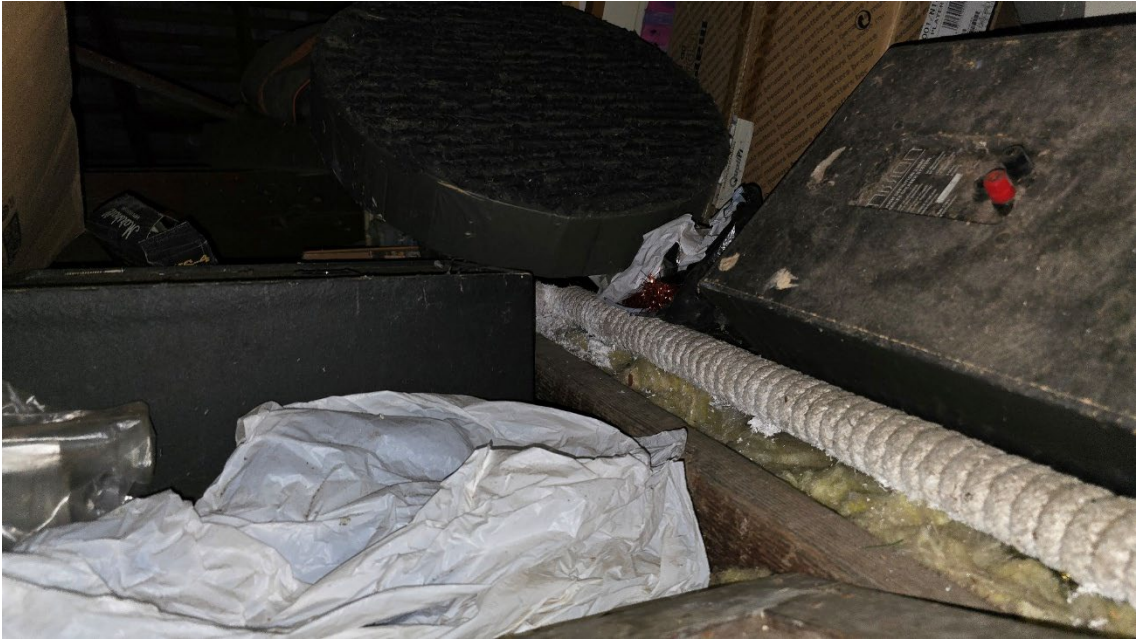
Photograph No. 15: Asbestos rope debris on SMF insulation batts in roof space at 16 Bent Street