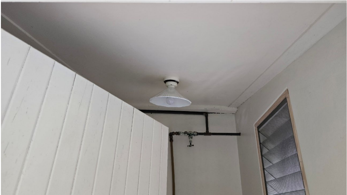
Photograph No. 10: Flat asbestos cement sheet ceiling lining in rear toilet at 14 Bent Street