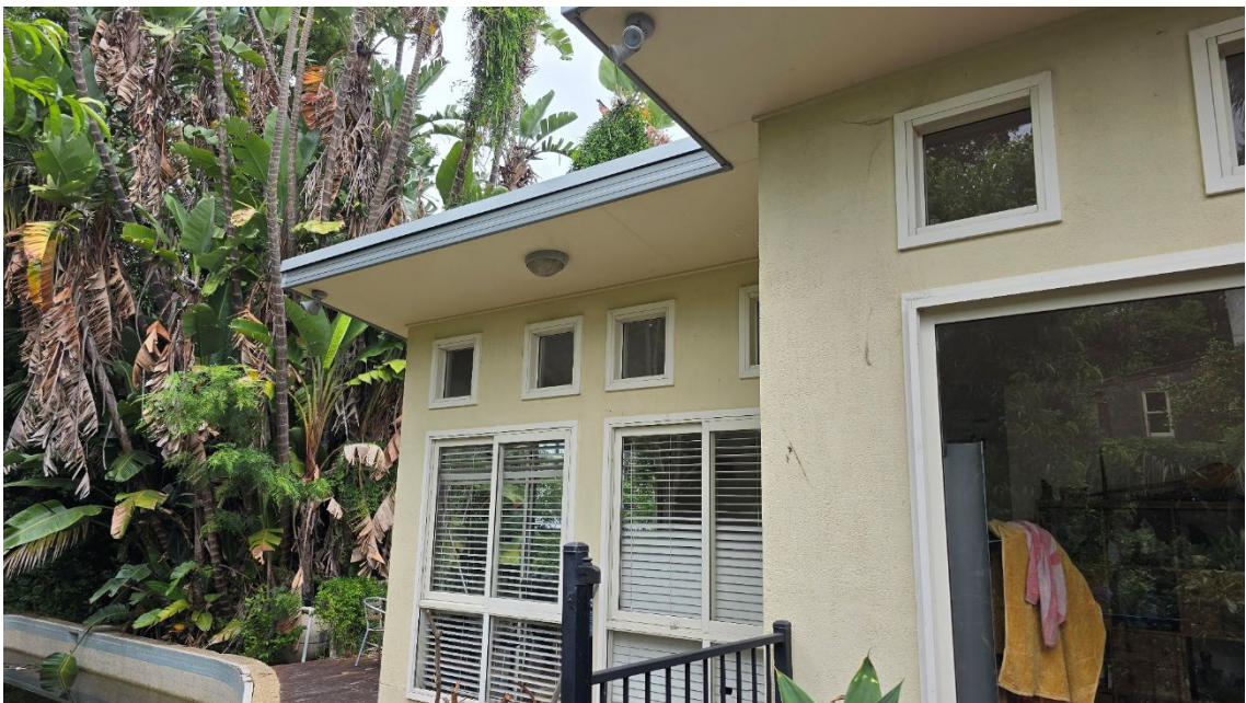
Photograph No. 11: Rear extension on house at 16 Bent Street that has asbestos free fibrous cement sheet eave lining and wall cladding substrate (presumed)