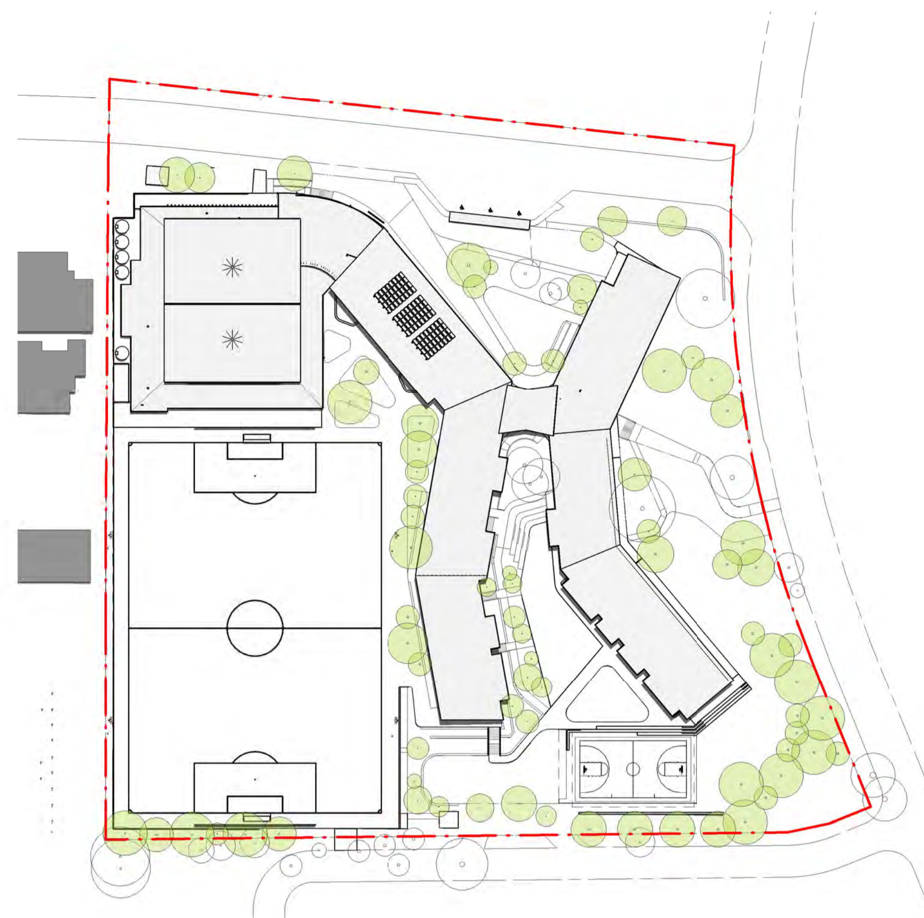
2 Summer 12.00 1 : 1000