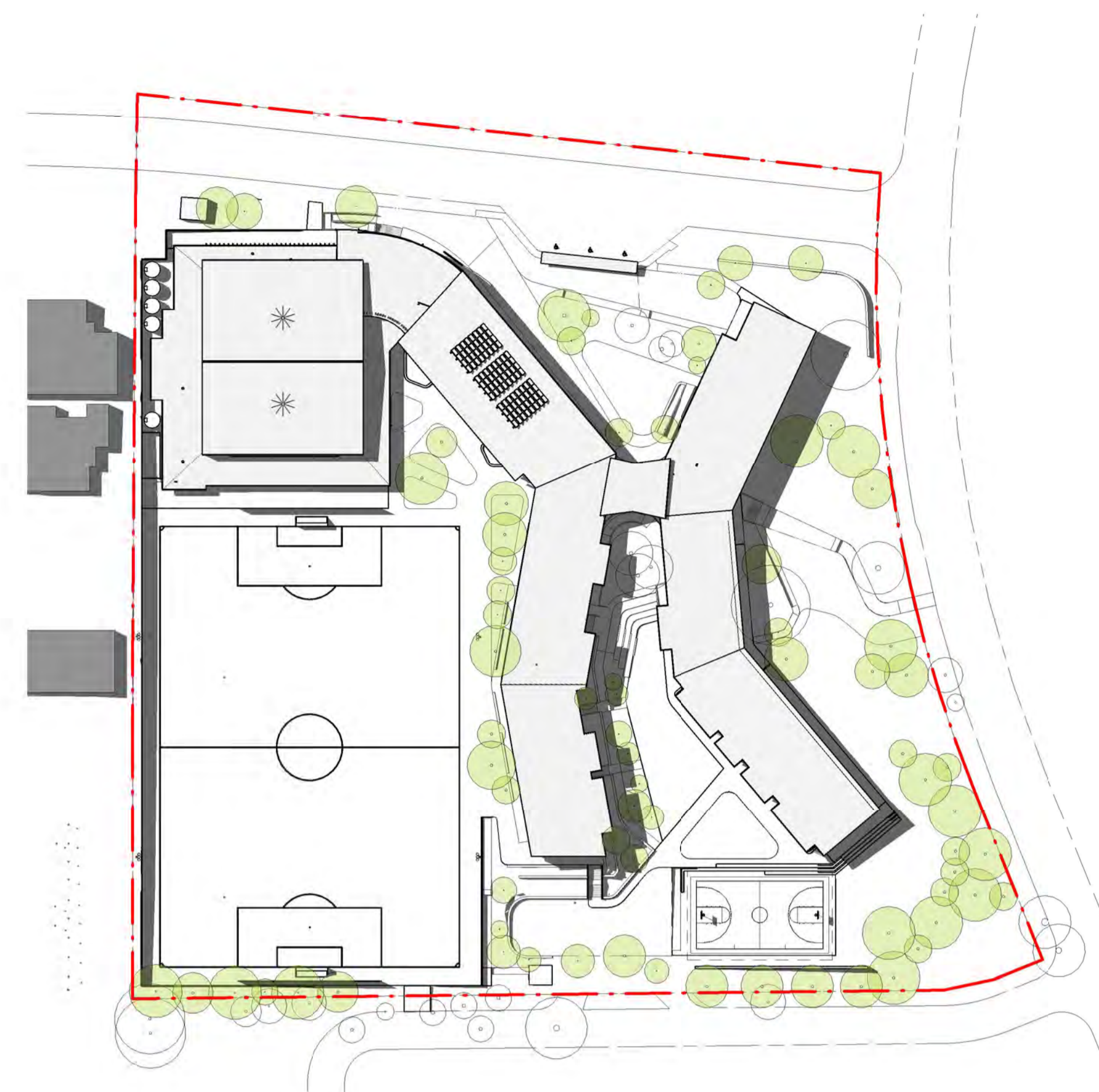
3 Summer 15.00 1 : 1000