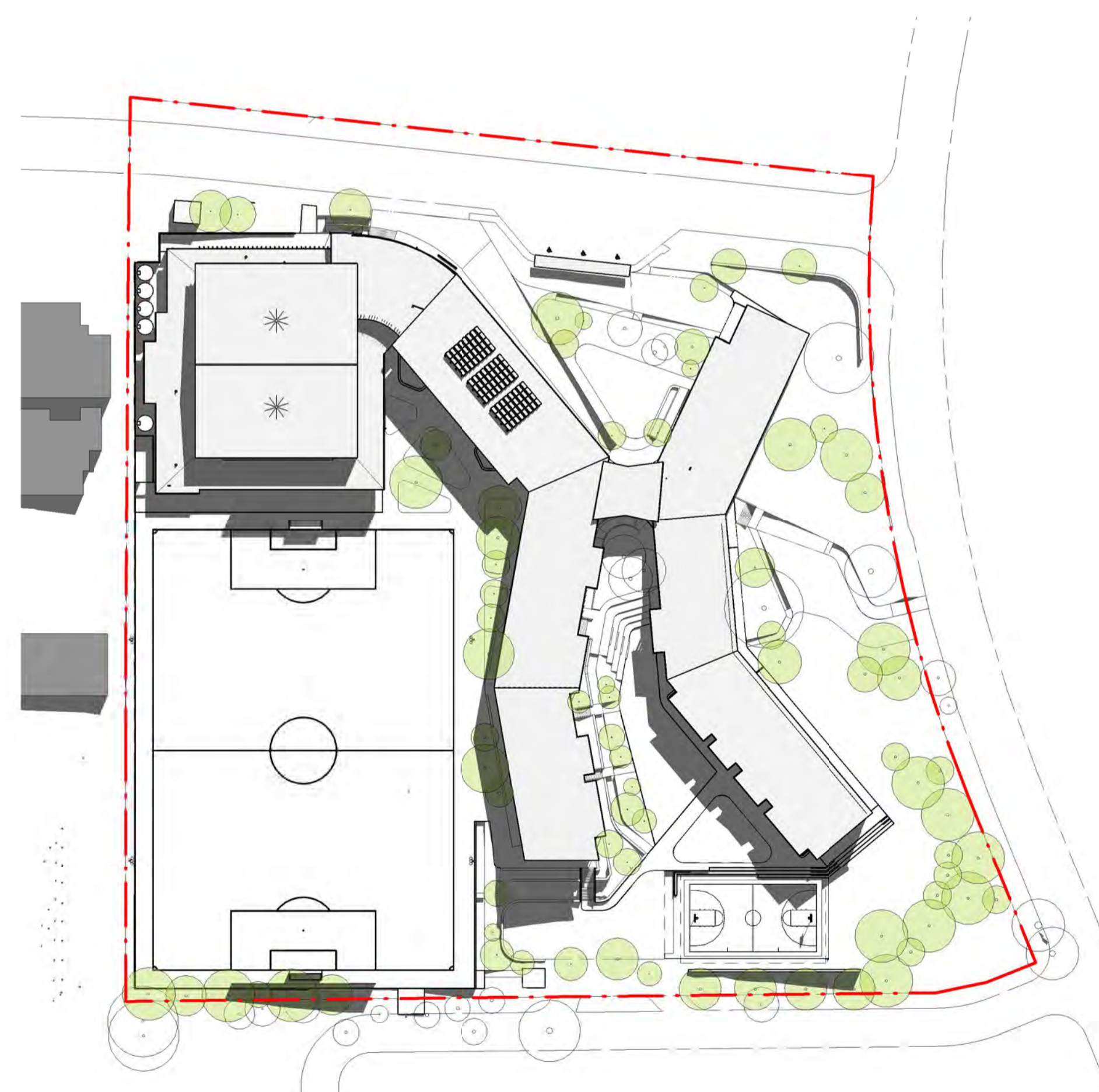
5 Winter 12.00 1 : 1000