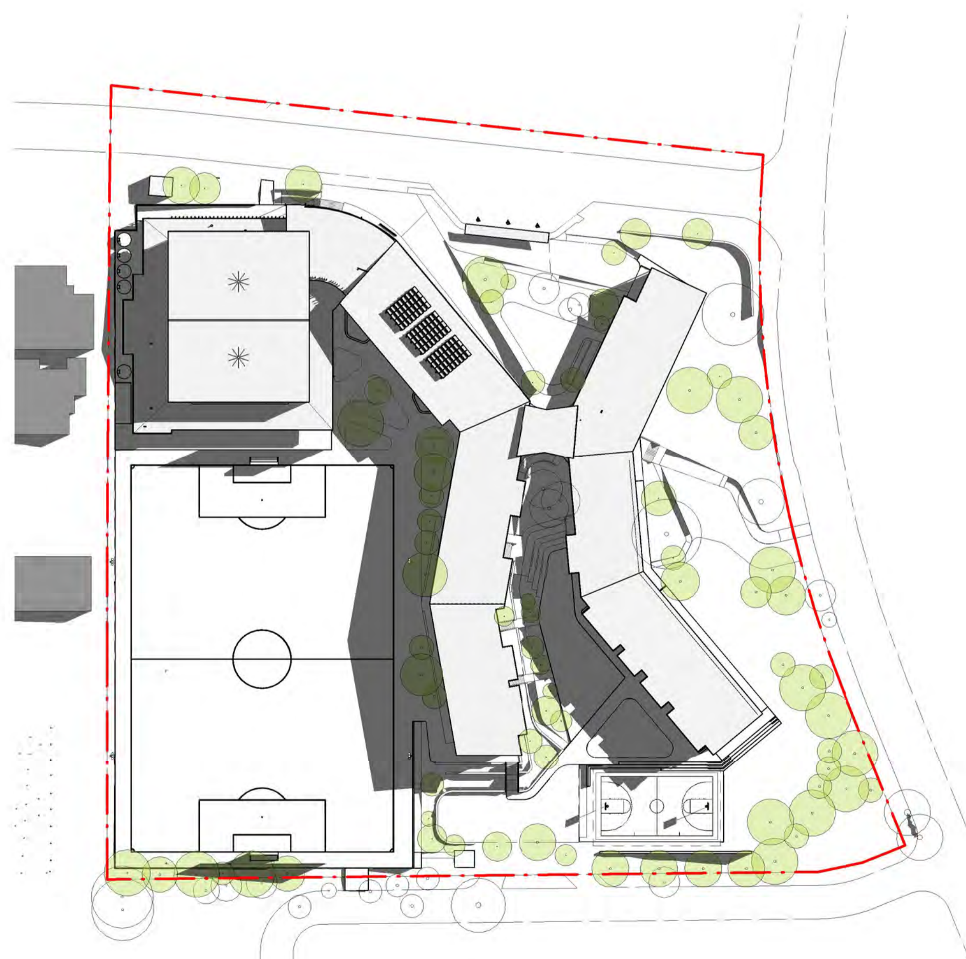
4 Winter 09.00 1 : 1000