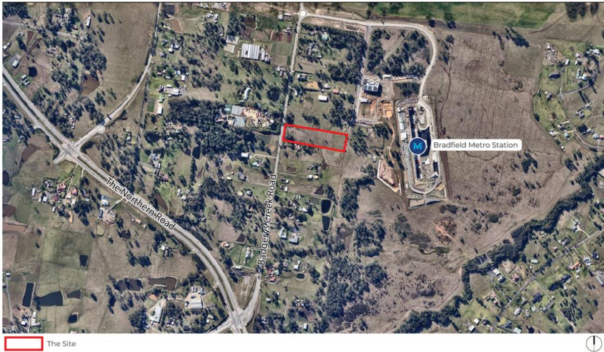
Figure 1: Site Plan

The site is located at 135 Badgerys Creek Rd, Bradfield NSW as shown in Figure.1 (boundaries are indicative only). The site has frontages to Badgerys Creek Road with vehicular access.