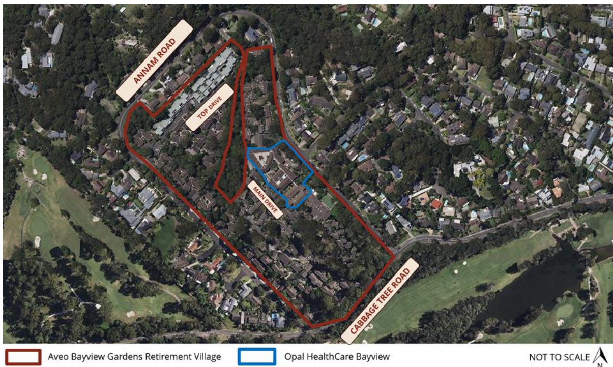
Figure 1 Context of site within the broader Aveo site