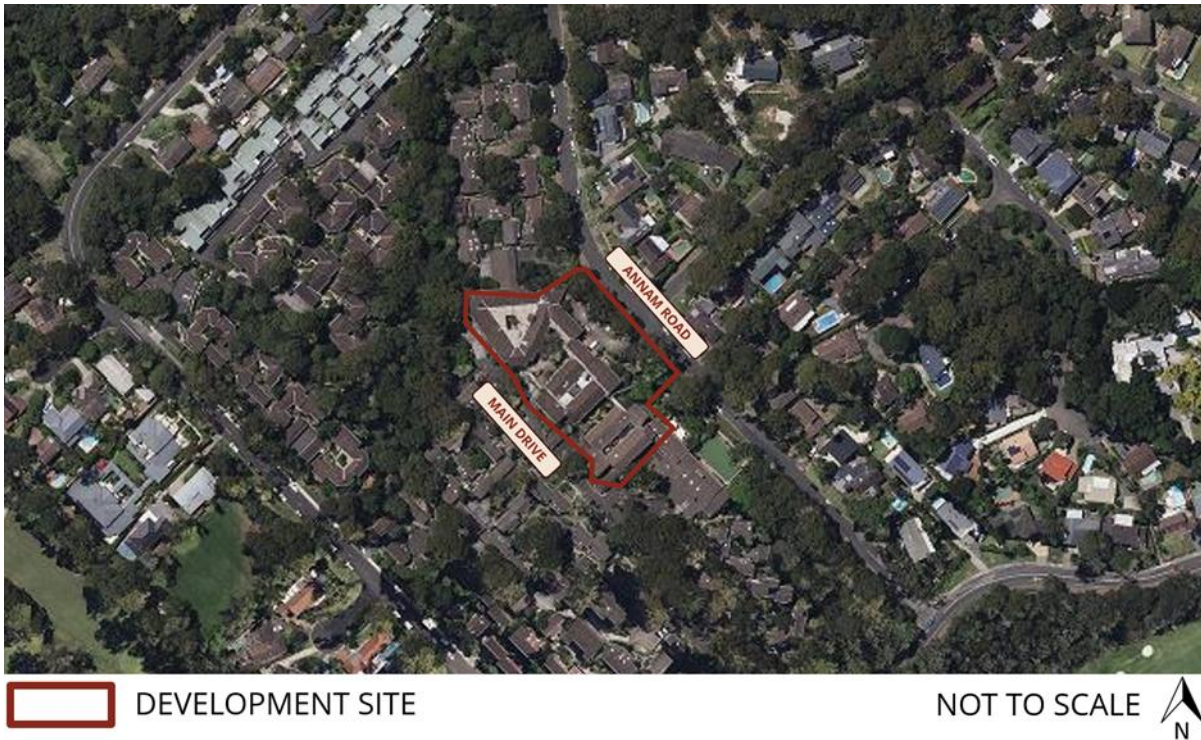
Figure 2 Subdivision site