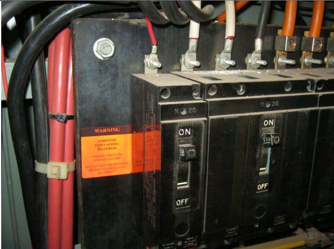
Photograph 23: Maternity, main electrical board (inside)