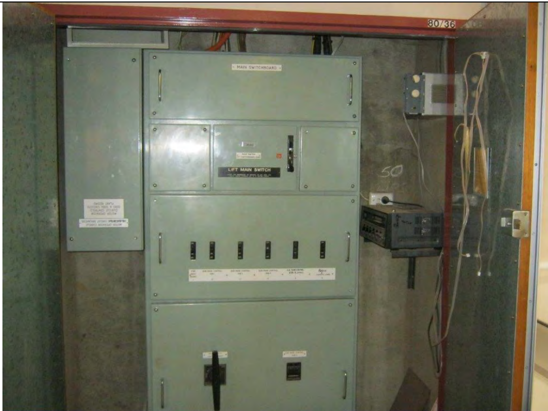
Photograph 22: Maternity, main electrical board (outside)