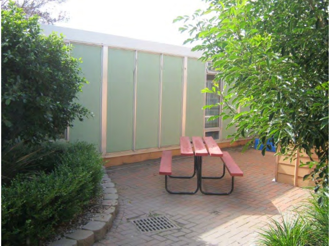
Photograph 37: North / south walkway, green wall panels