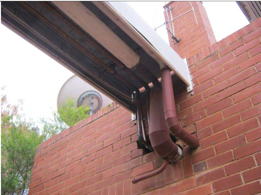
Photograph 10: George Hatch, overhead services ducting, asbestos pipe lagging