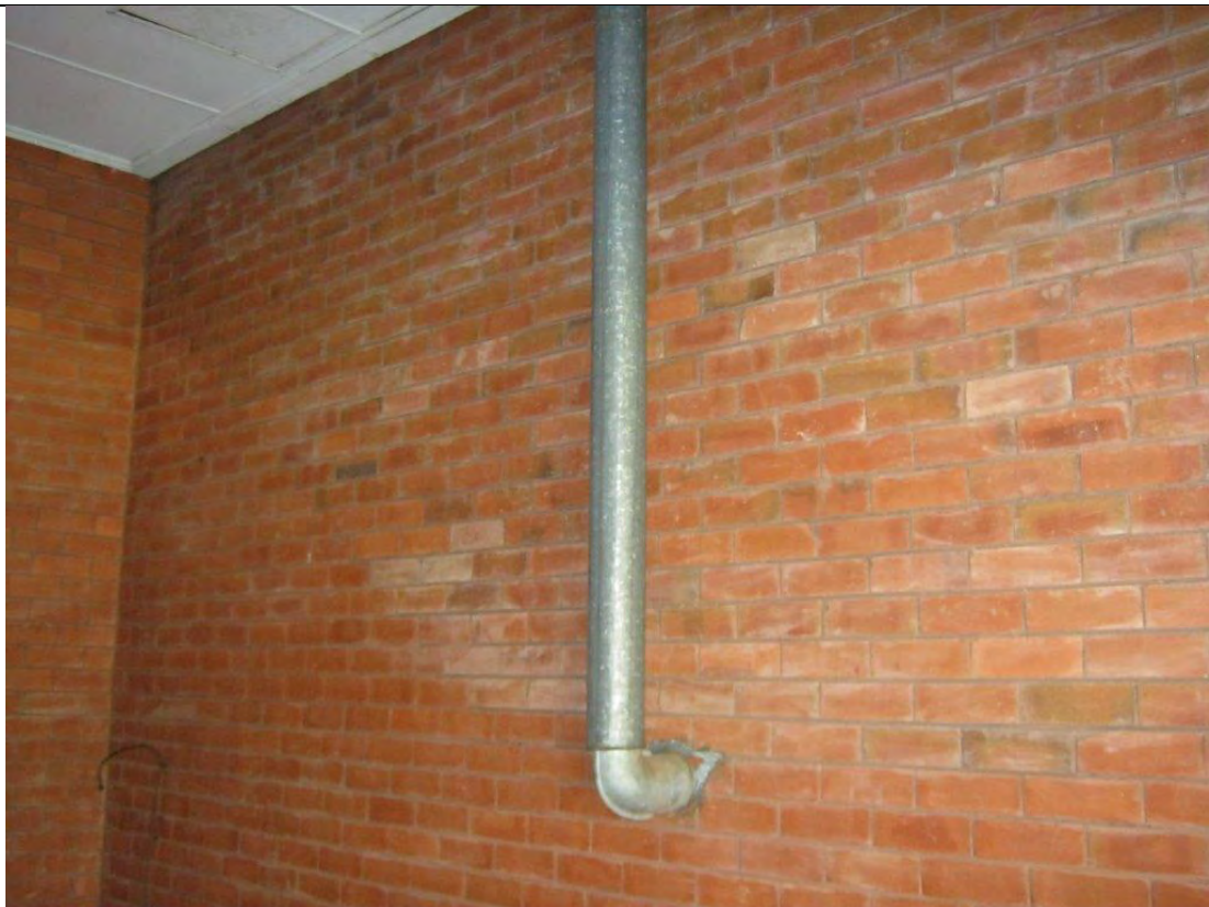
Photograph 28: Doctors accommodation, exhaust chimney in garge