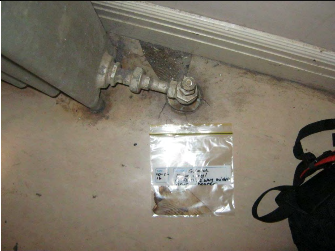
Photograph 11: George Hatch, vinyl floor tile (NAD)