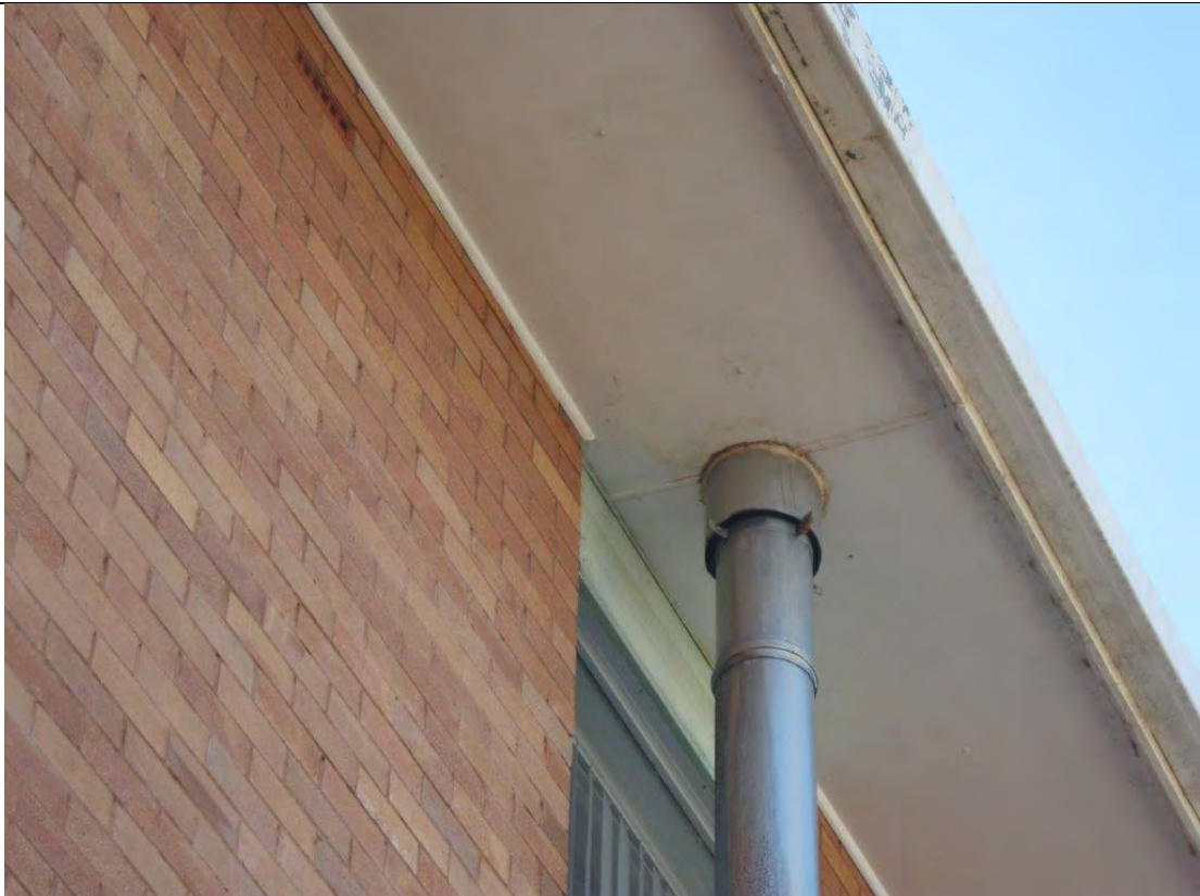
Photograph 24: Maternity, soffit