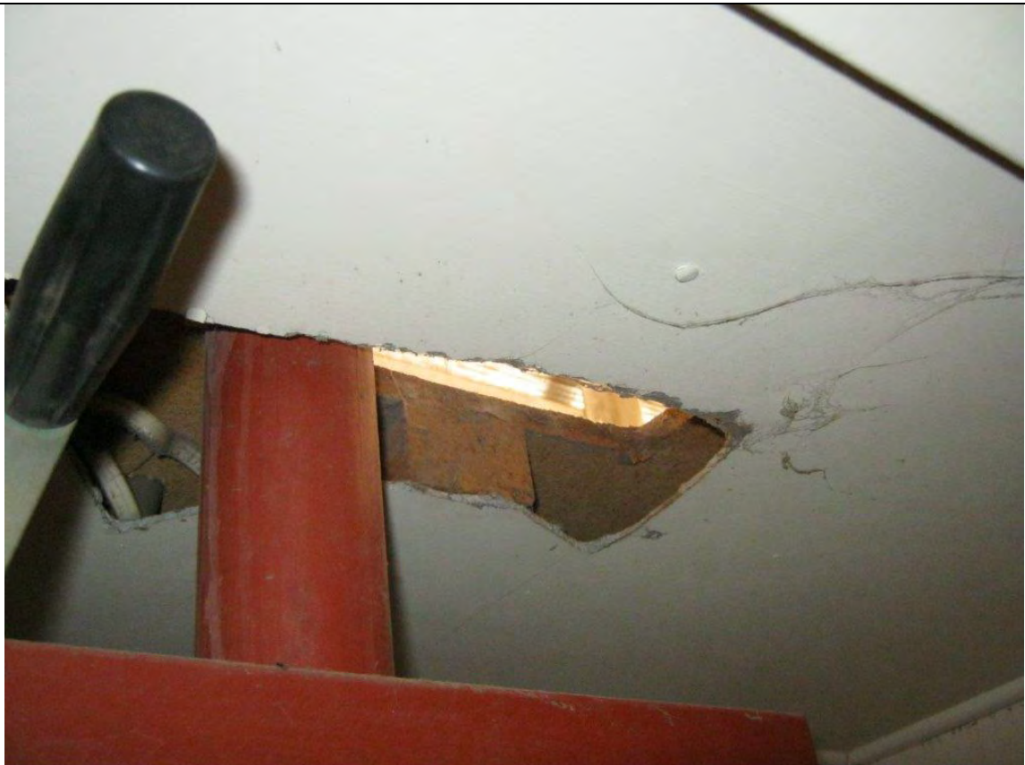
Photograph 14: Maternity, plant room walls and ceiling