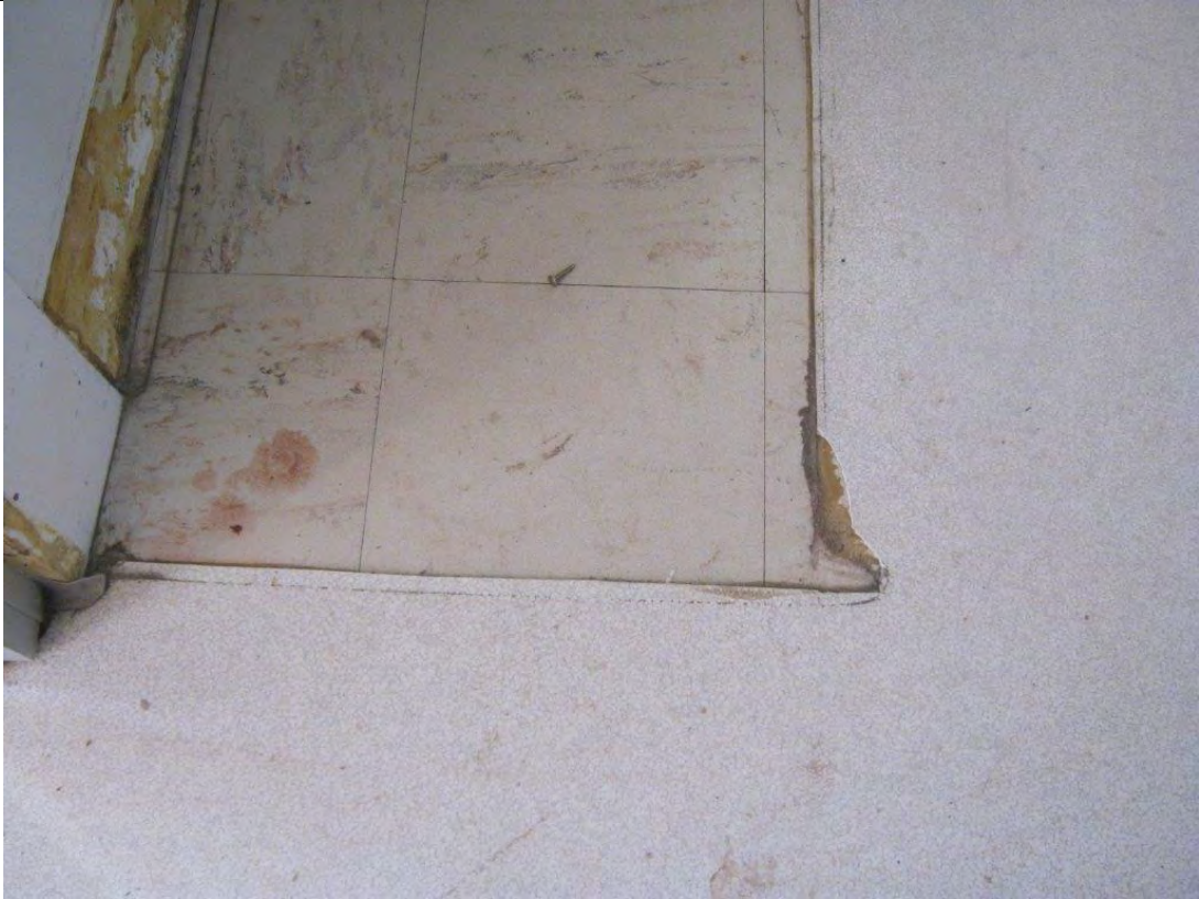
Photograph 15: Maternity, old and new vinyl floor tiles