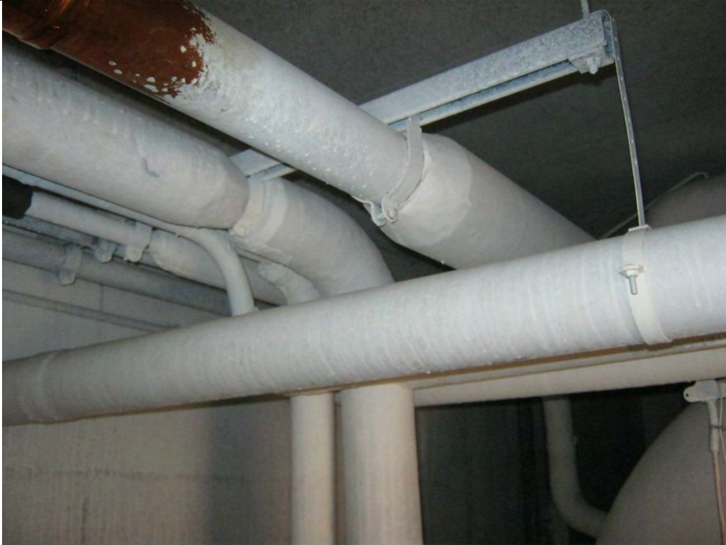
Photograph 3: S Block, Clarifier Room, asbestos pipe lagging