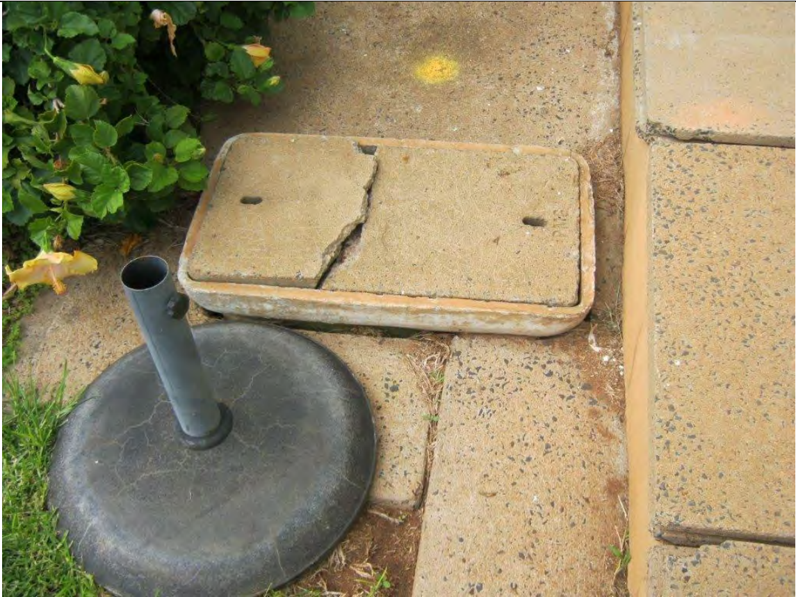
Photograph 35: East / west walkway, Telstra pits (one of three)