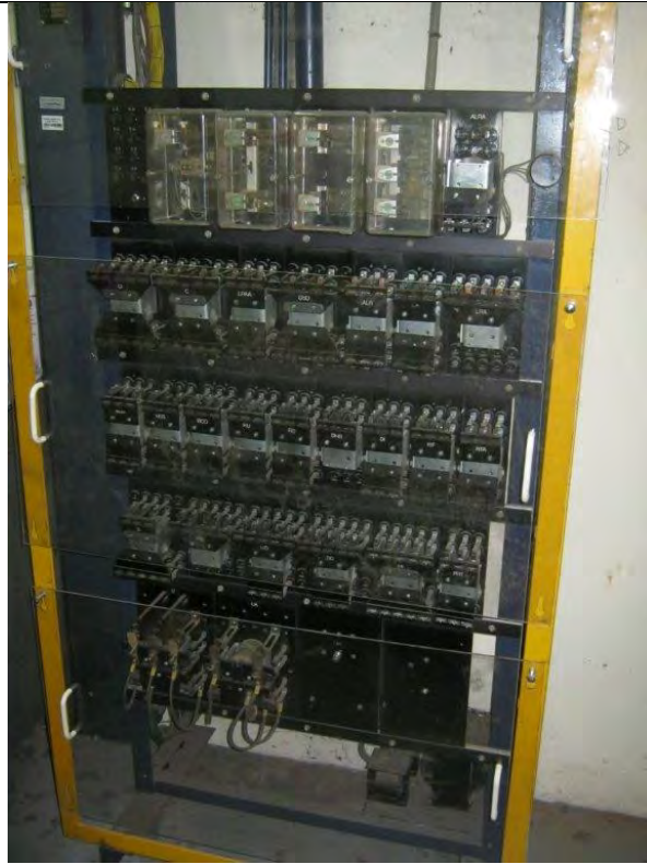
Photograph 19: Maternity, lift room, electrical board