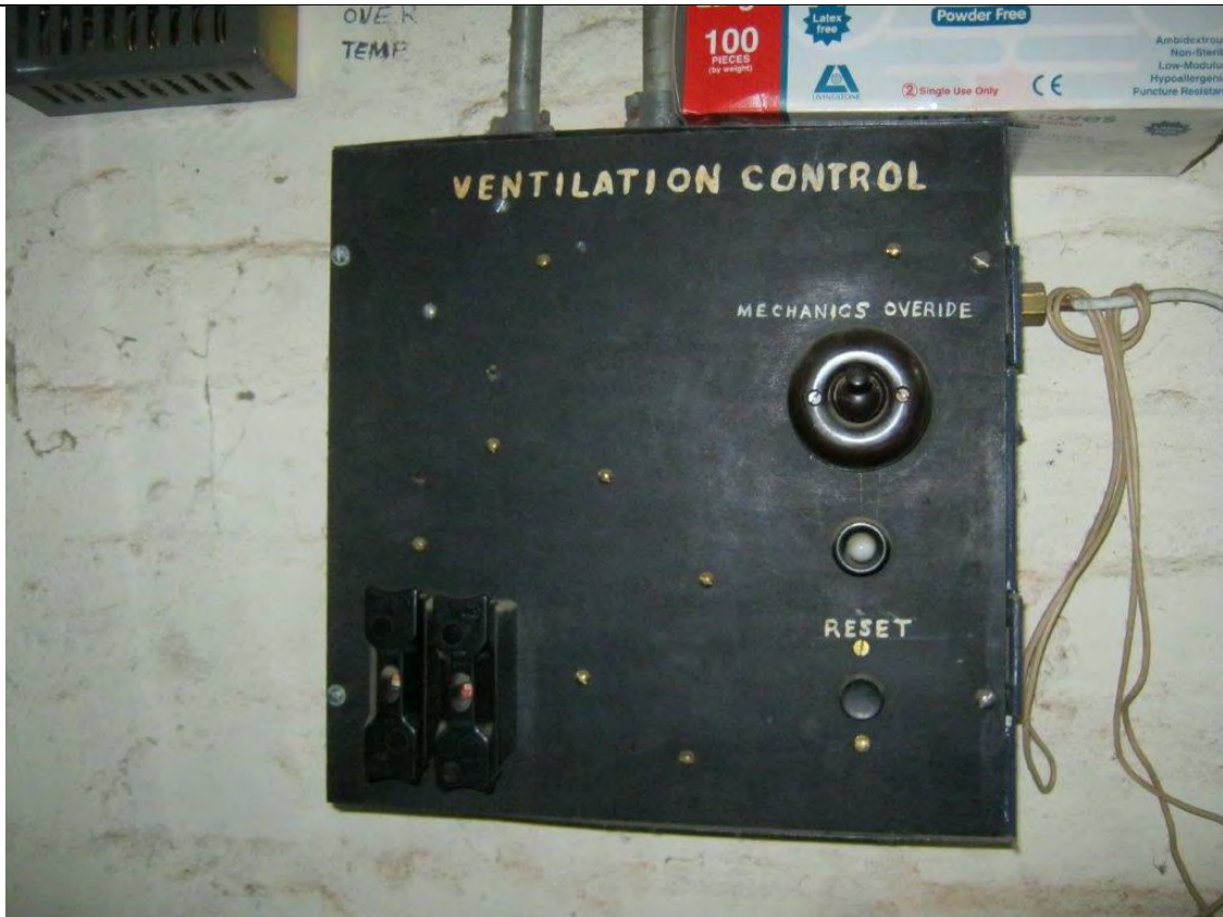
Photograph 20: Maternity, lift room, ventilation control board