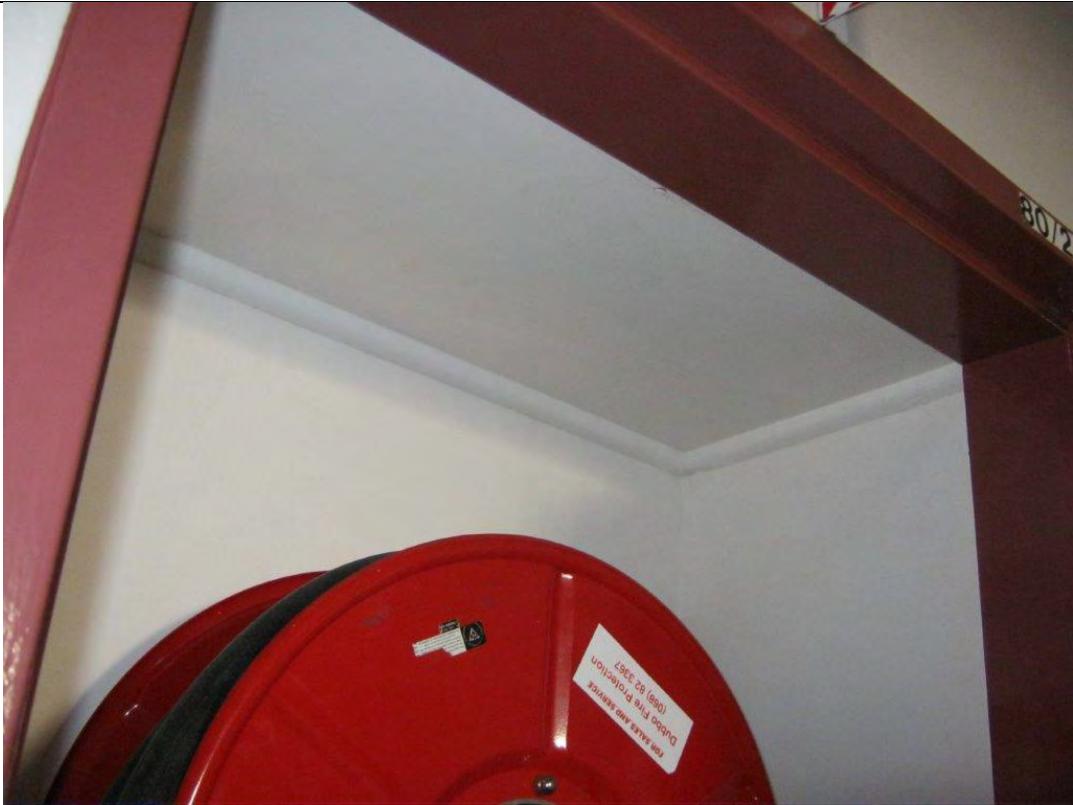
Photograph 17: Maternity, above fire reel