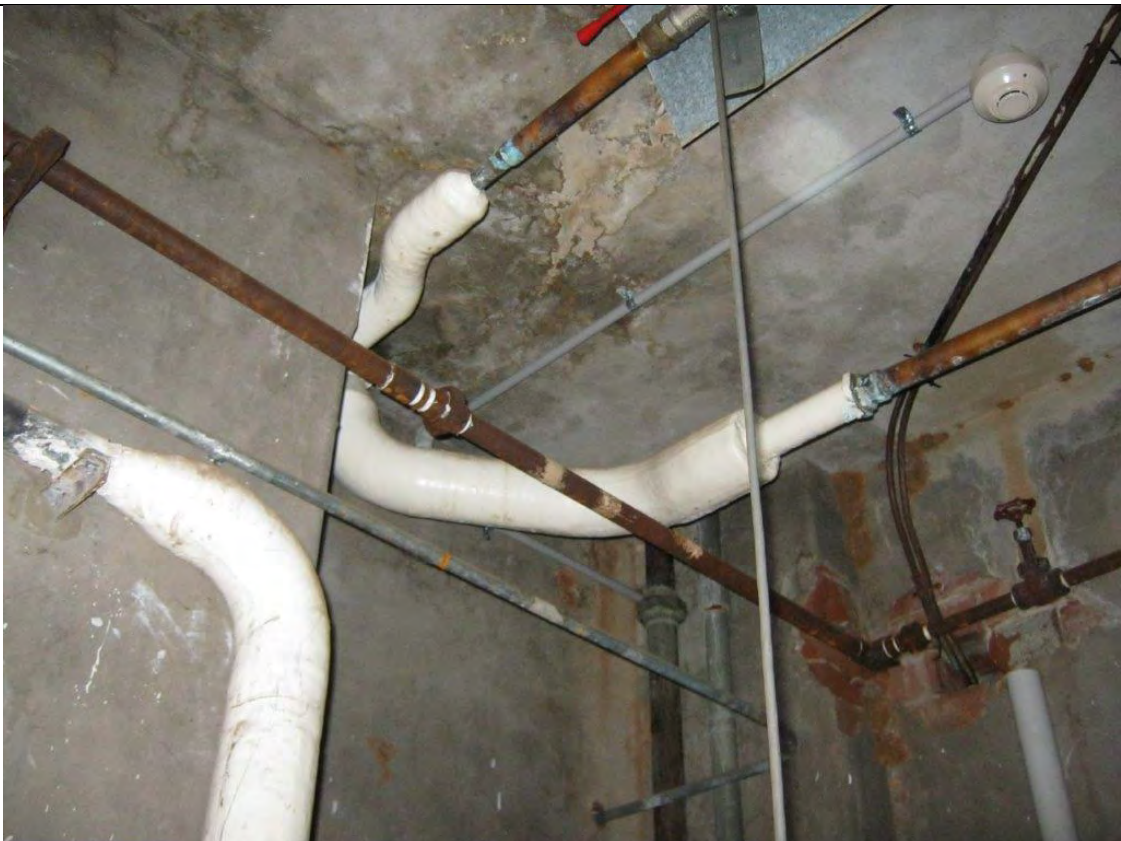
Photograph 12: George Hatch, plant room, asbestos pipe lagging