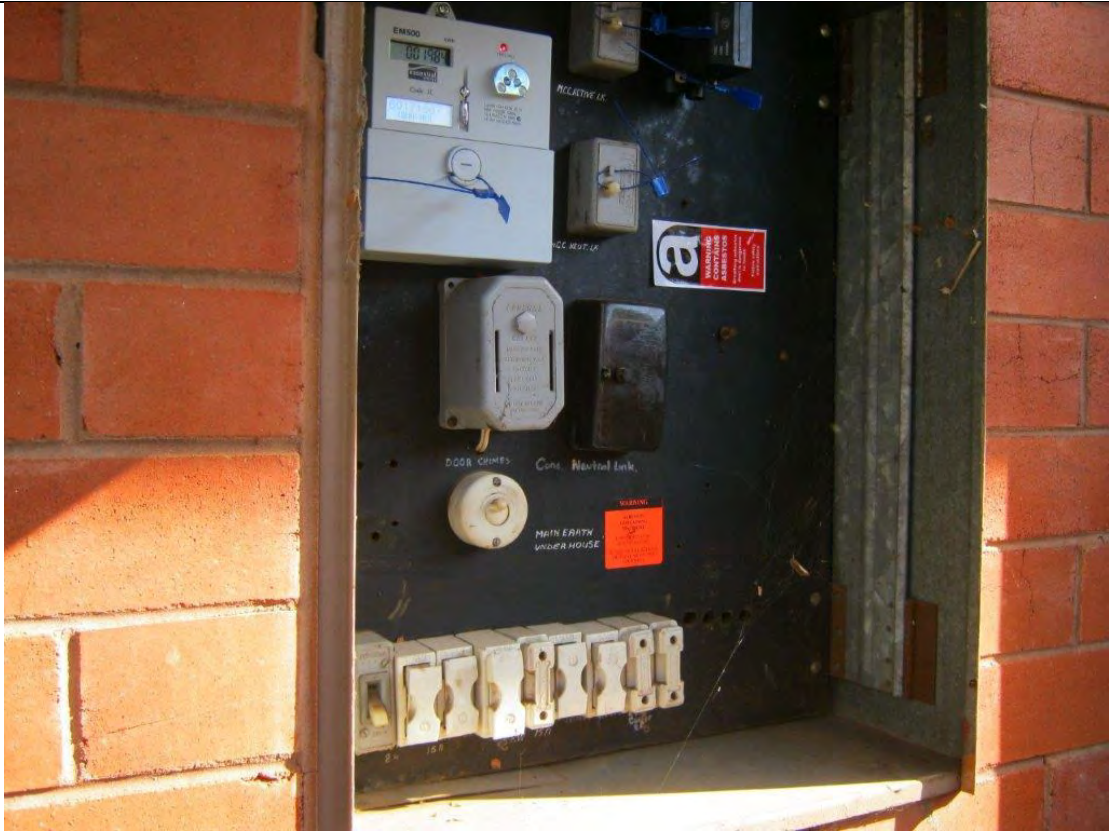
Photograph 27: Doctors accommodation, electrical switchboard, with asbestos label