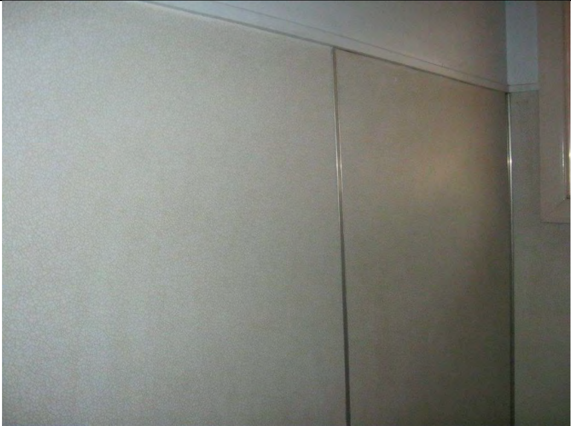
Photograph 2611: Doctors accommodation, bathroom walls