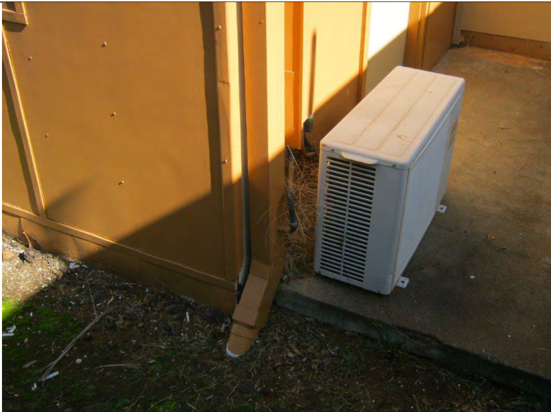
Photograph 34: East / west walkway, adjoining nurses admin