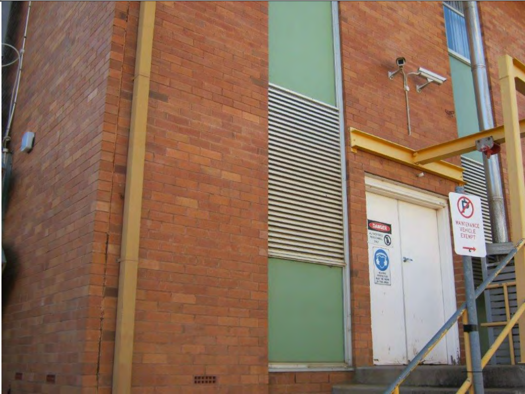
Photograph 25: Maternity, green spandrels