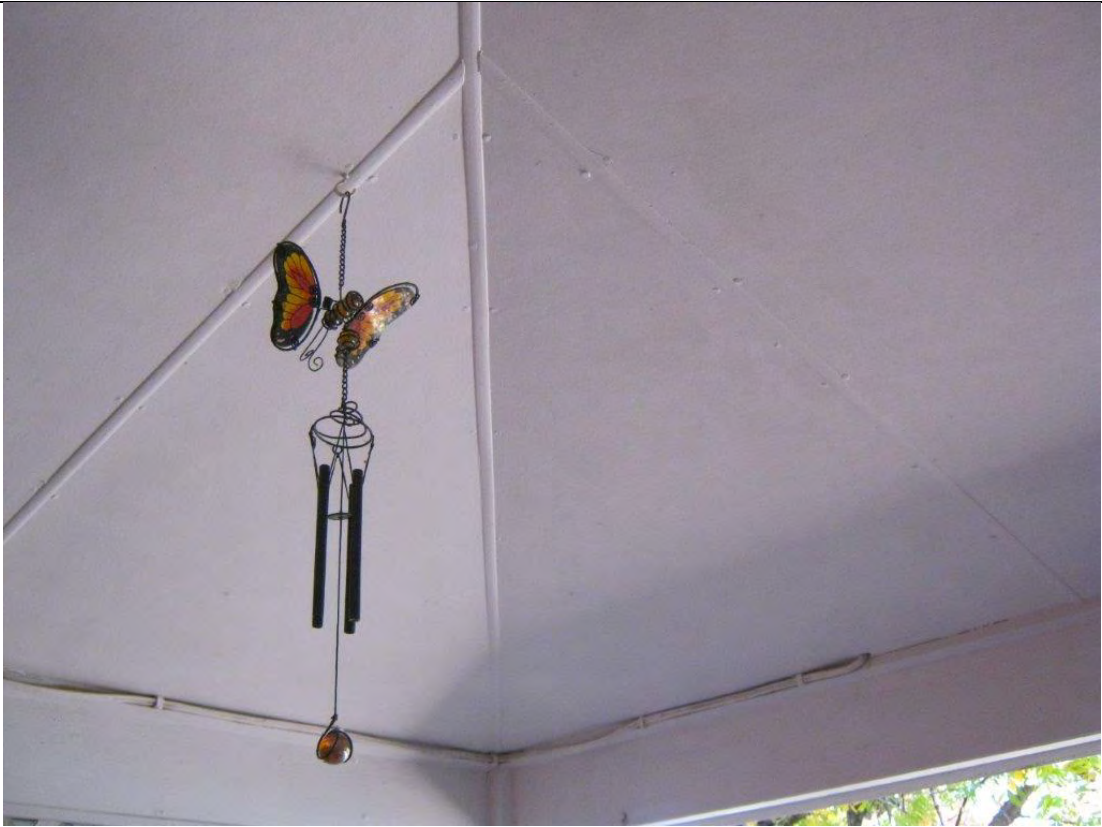
Photograph 29: Playmates Cottage, ceiling to front entry porch