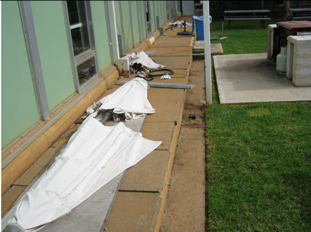
Photograph 36: East / west walkway, belowground trench