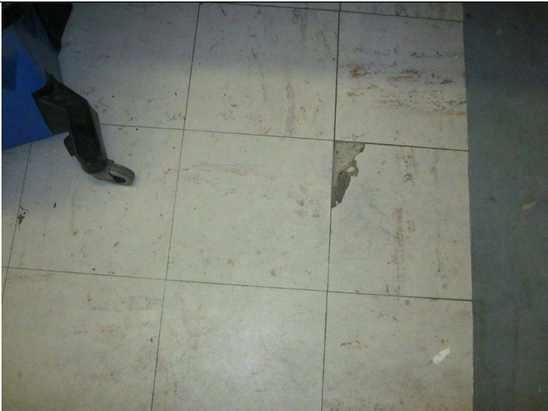
Photograph 16: Maternity, vinyl floor tiles room 80/8