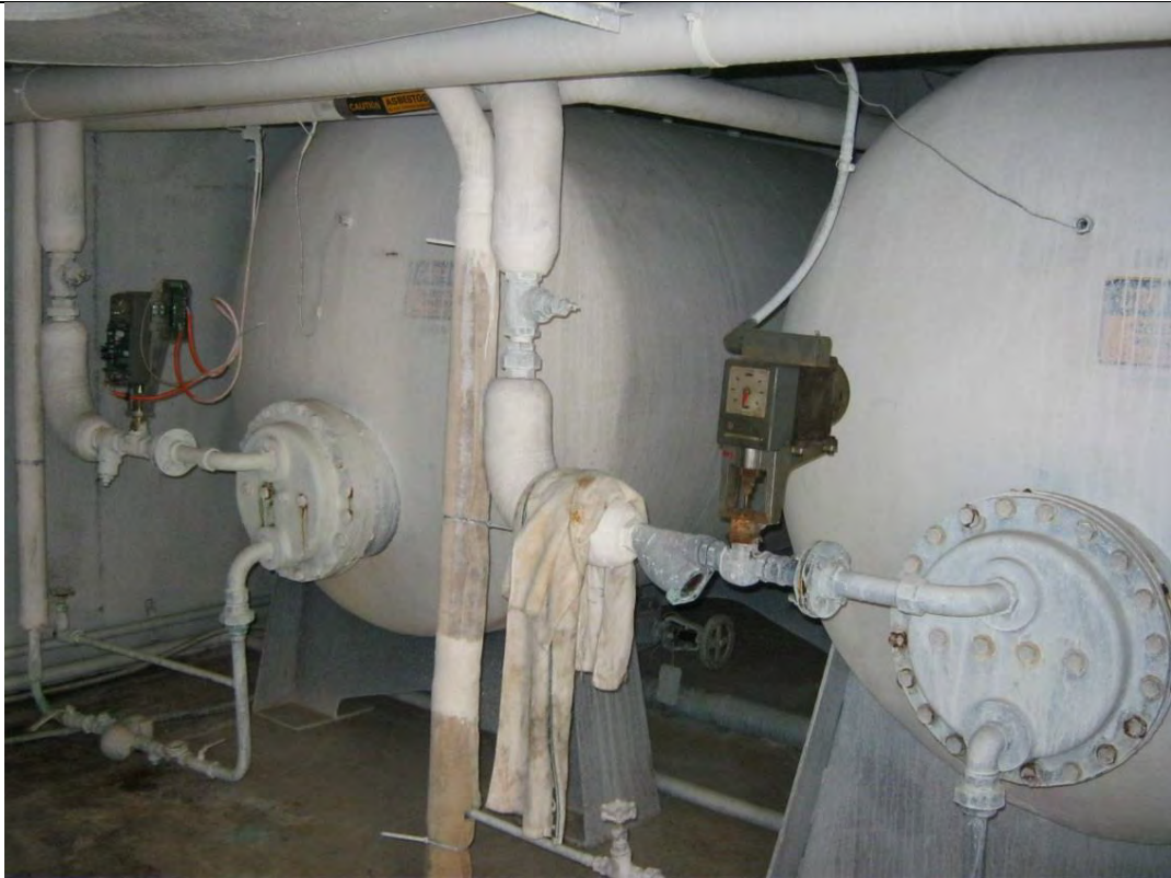
Photograph 1: S Block, Clarifier Room, asbestos insulation