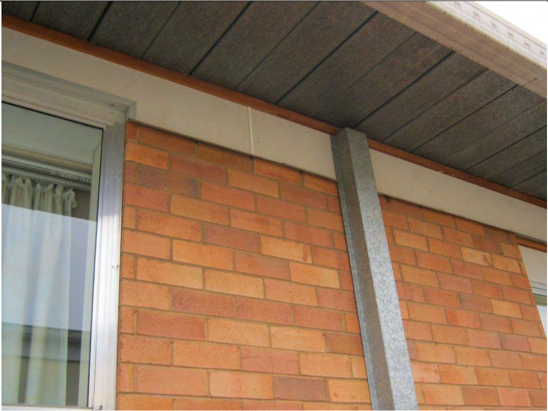
Photograph 7: S Block, Flashing under eaves