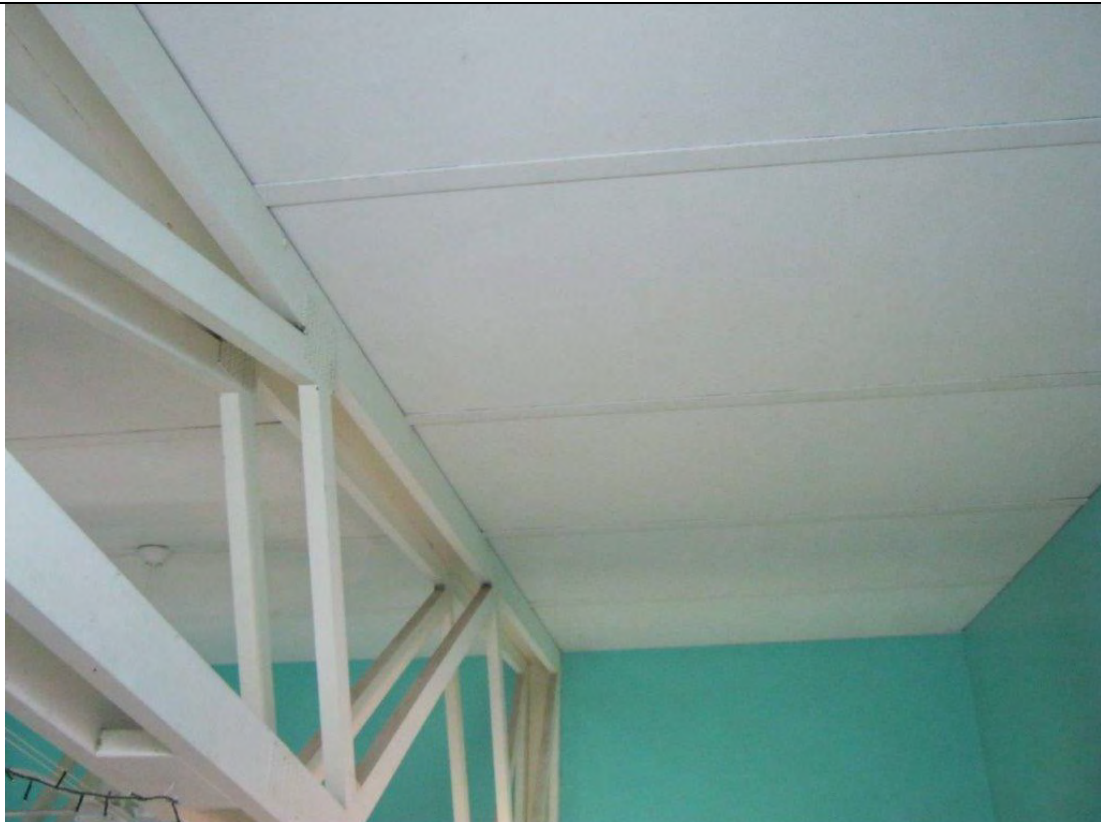
Photograph 3213: Playmates Cottage, ceiling panelling, babies room