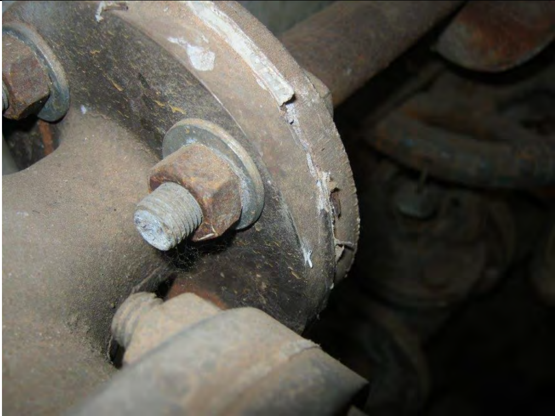
Photograph 18: Maternity, gasket in machinery (NAD)