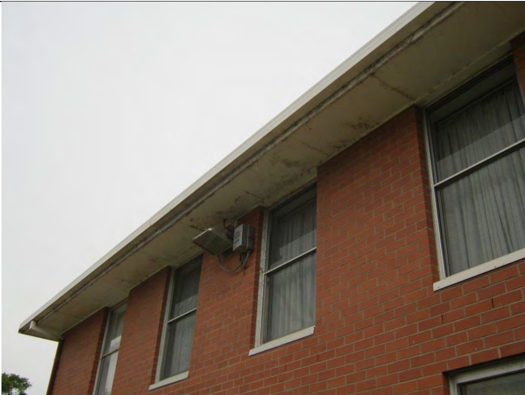
Photograph 8: George Hatch, Soffit