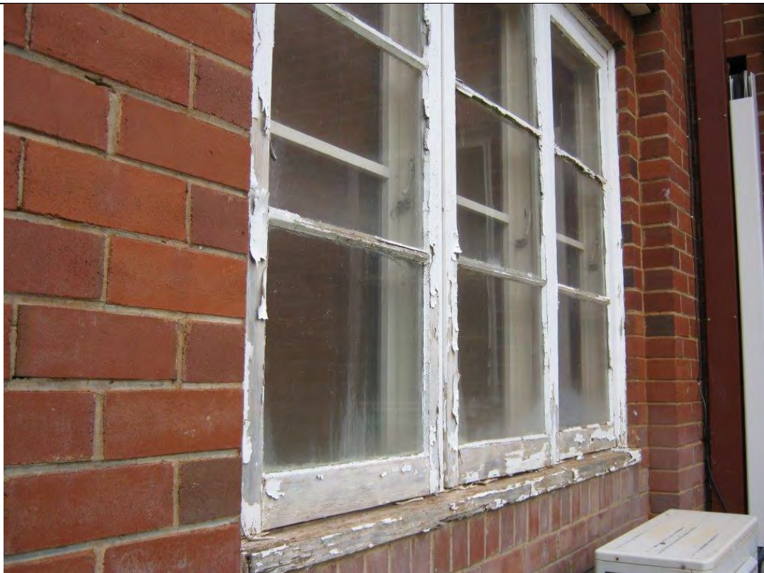
Photograph 38: George Hatch, flaking paint on southern windows