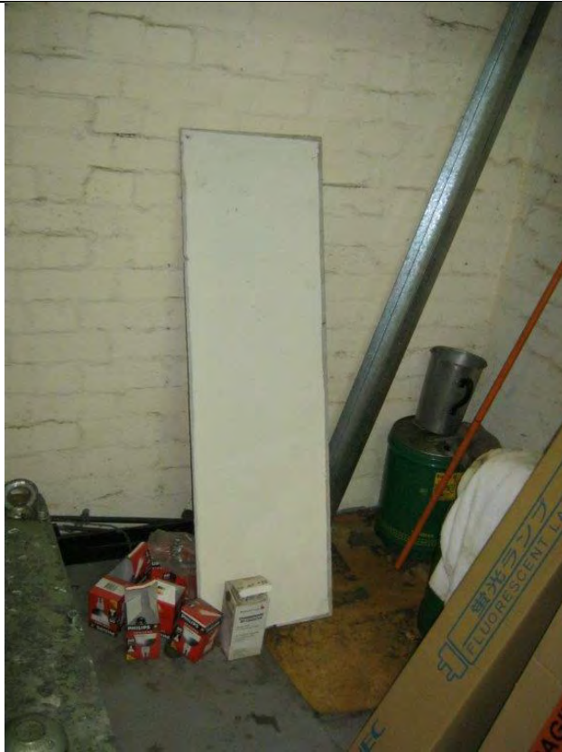
Photograph 21: Maternity, lift room, cover for services