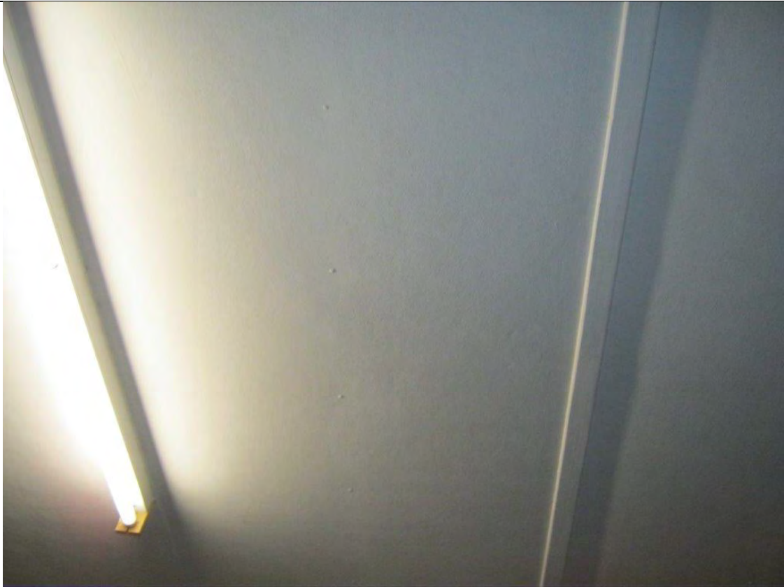
Photograph 9: George Hatch, sheeting under ceiling in enclosed verandahs