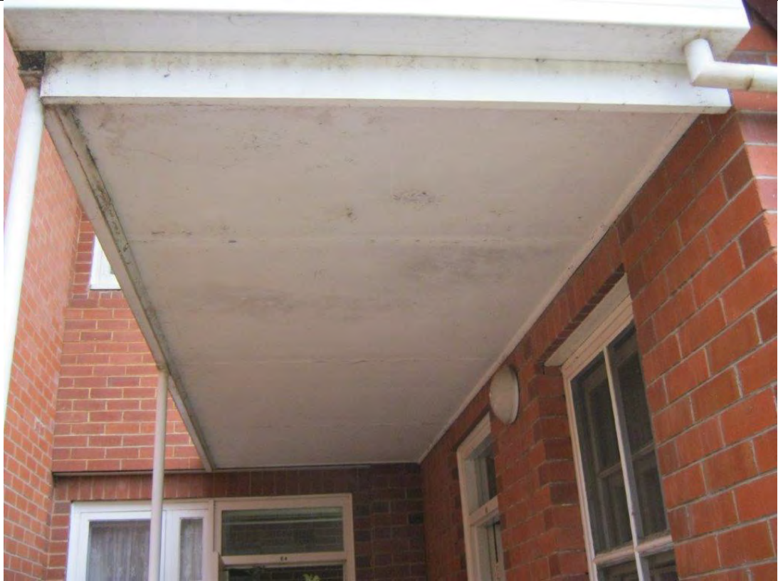
Photograph 13: Maternity, ceiling panelling