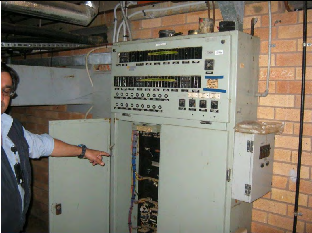
Photograph 5: S Block, Clarifier Room, main switchboard