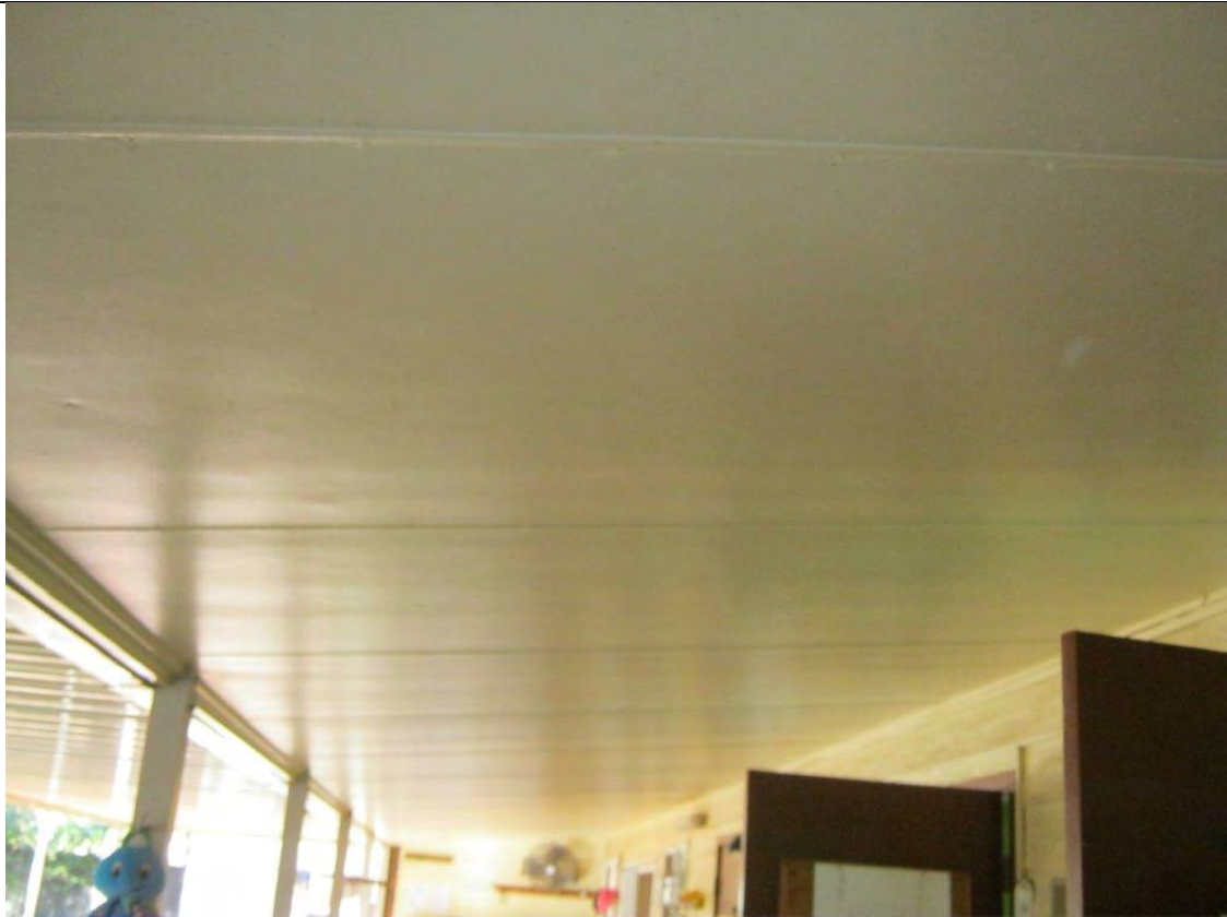
Photograph 31: Playmates Cottage, ceiling panelling to veranda