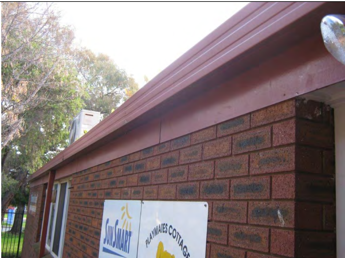
Photograph 3012: Playmates Cottage, fascia panelling