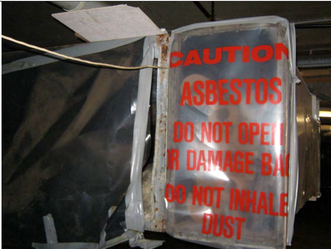
Photograph 4: S Block, Clarifier Room, asbestos waste