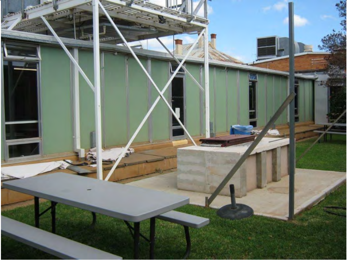
Photograph 33: East / west walkway, wall panels