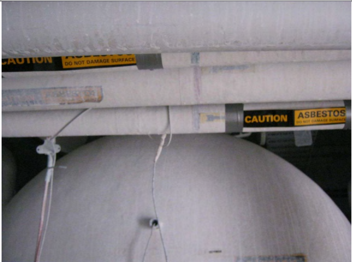
Photograph 2: S Block, Clarifier Room