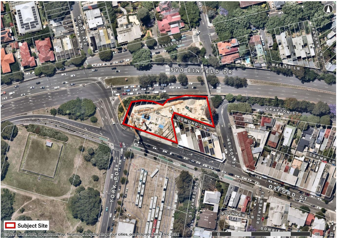
Figure 2 Site map