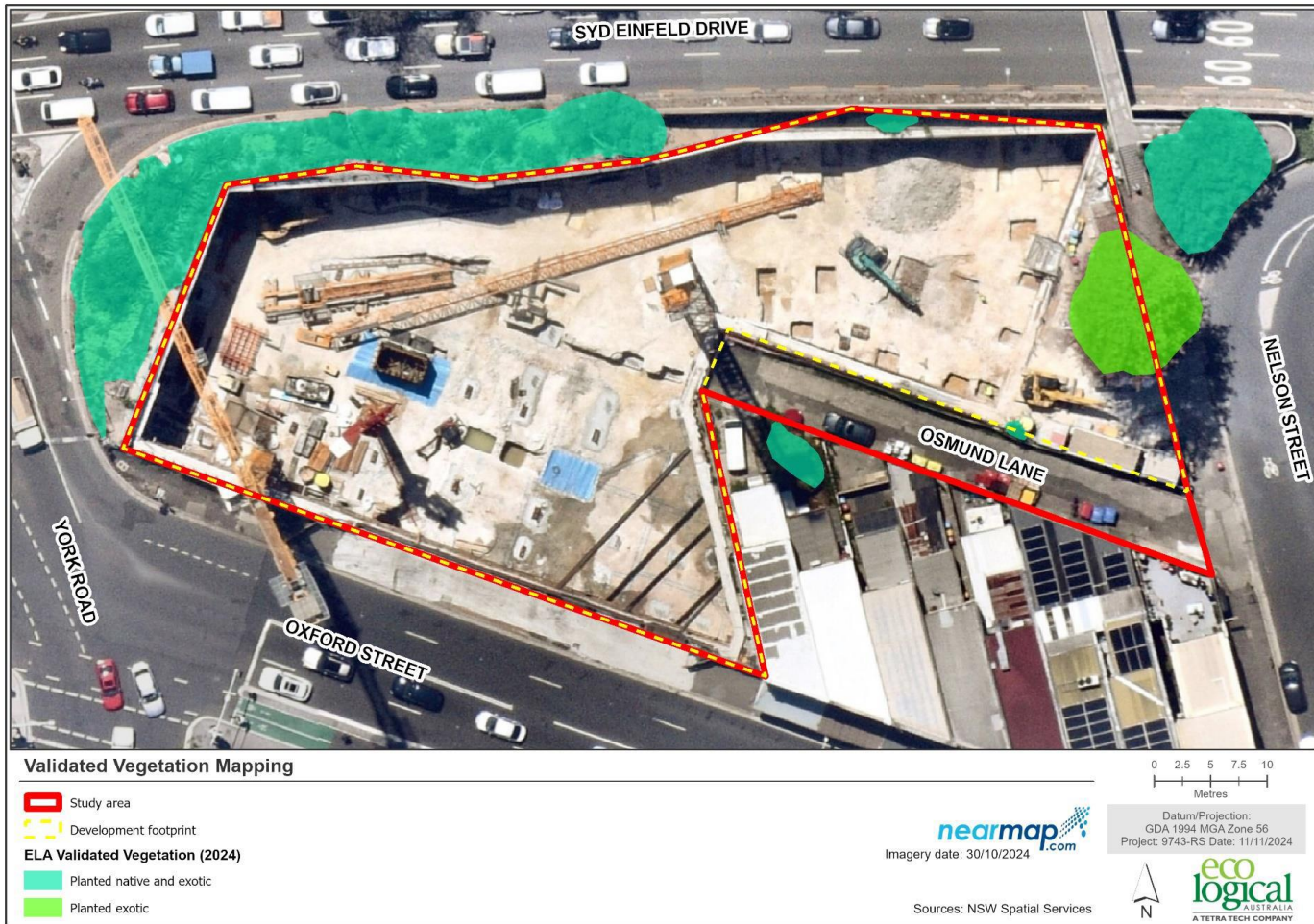
Figure 5: Validated vegetation mapping and fauna habitat within the vicinity of the study area (ELA 2024)