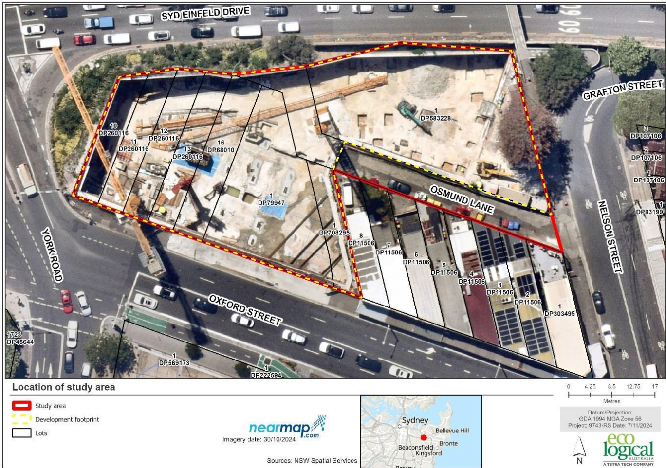
Figure 3 The Site