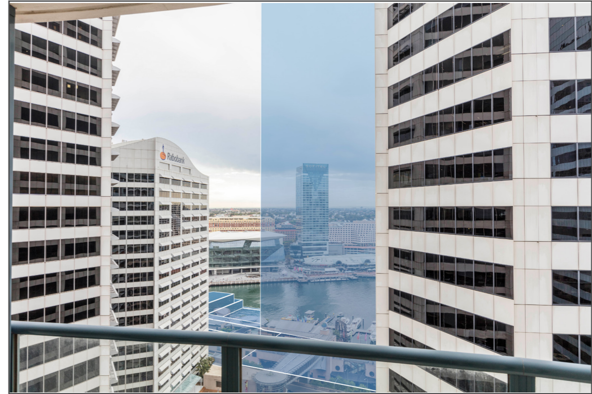
Photograph with proposed building envelope