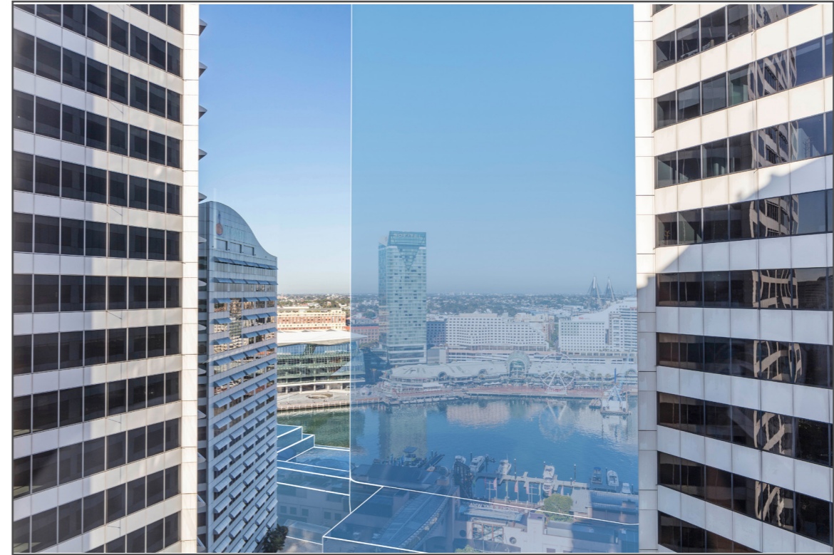
Photograph with proposed building envelope