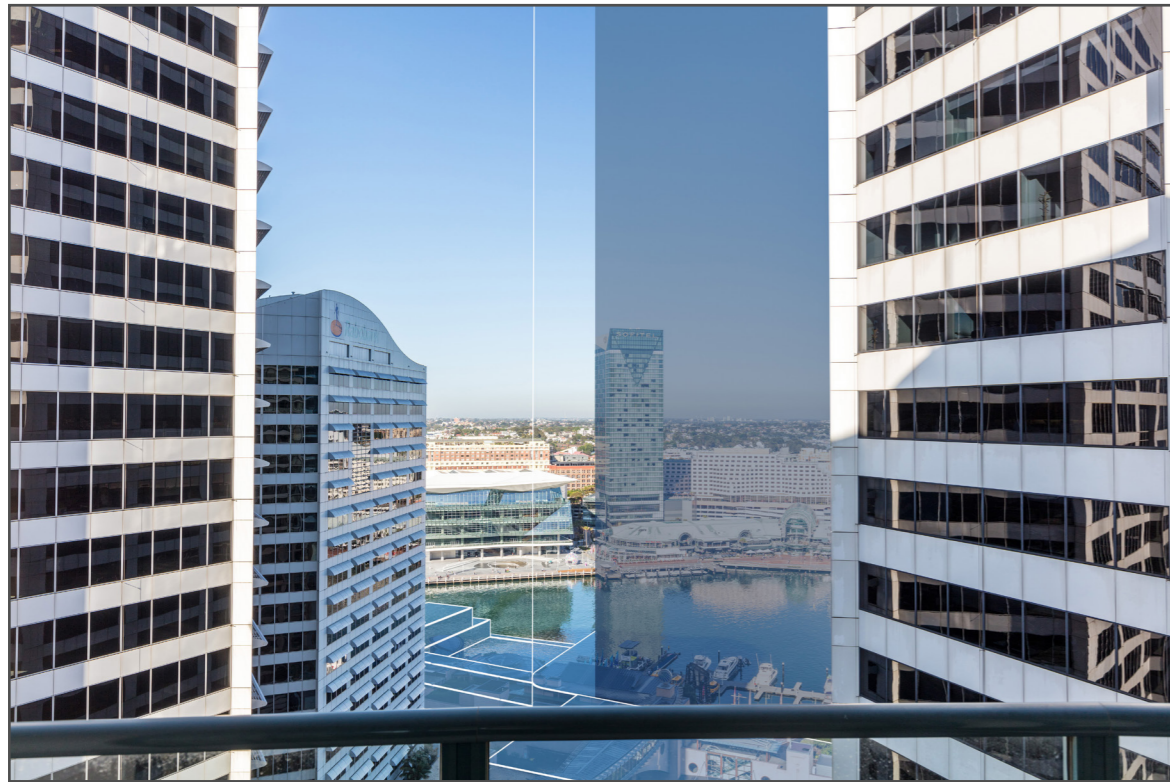
Photograph with proposed building envelope & Indicative massing option 1b