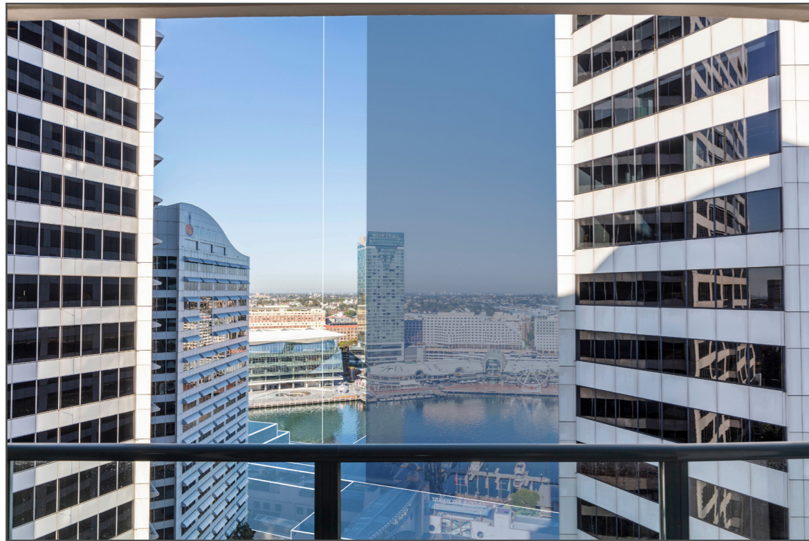
Photograph with proposed building envelope & Indicative massing option 1b