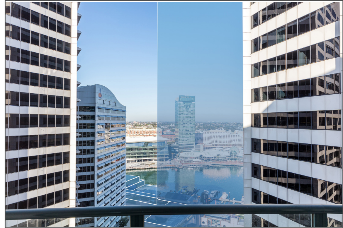
Photograph with proposed building envelope