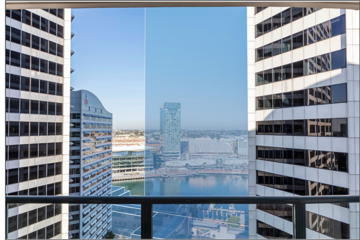
Photograph with proposed building envelope