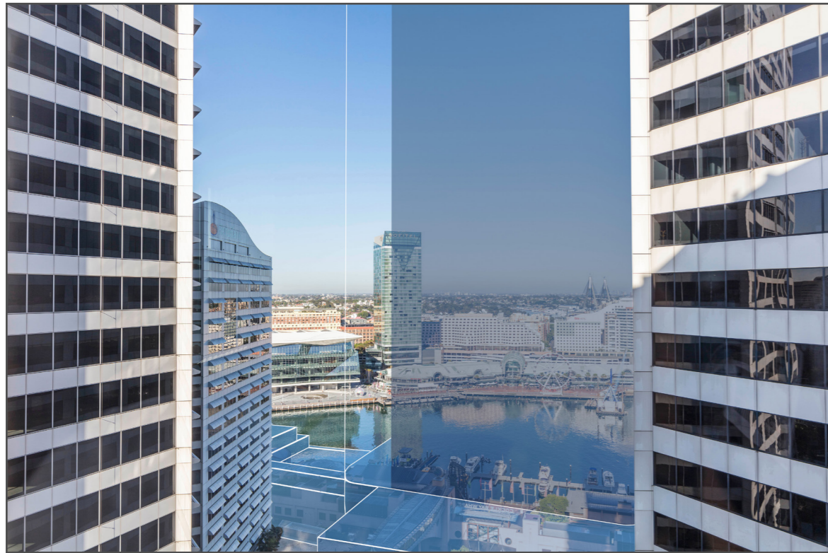
Photograph with proposed building envelope & Indicative massing option 1b