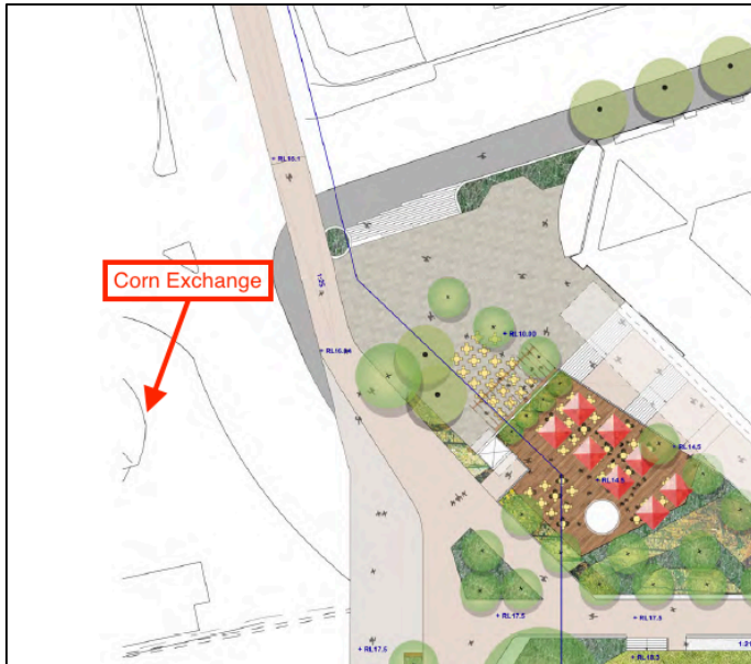
Figure 1: A concept design by Aspect Studio showing the location of the pedestrian bridge link in relation to the Corn Exchange.

The connection of the new pedestrian link and the Pyrmont Bridge will be in line with Policy 6.2 and Policy 10 contained in the Pyrmont Bridge Conservation Management Plan (2006). The policies are quoted below: