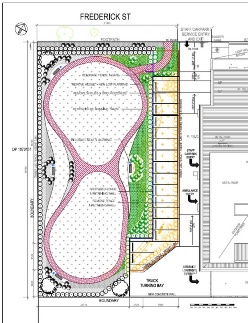
Figure 5 | Revised Landscaping

The landscaped lawn and seating area on the western side of the building is required to be redesigned to accommodate the new parking spaces. A detailed landscape plan was provided with the RtS and is shown in Figure 5 below.