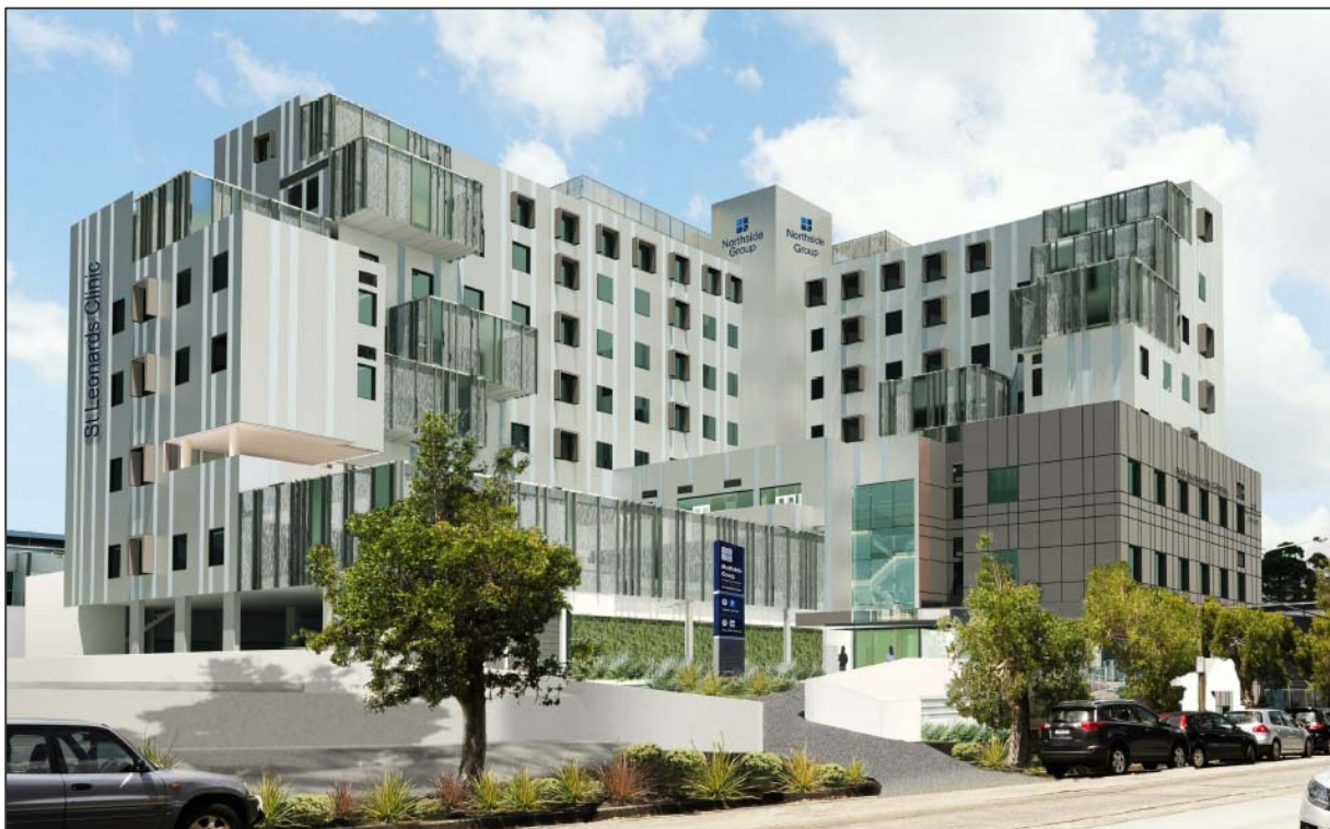
Figure 4 | Perspective of proposed building with additional floor as viewed from Frederick Street

The proposed façade of the additional storey has been designed to be consistent with the approved building design (see Figure 4 ).