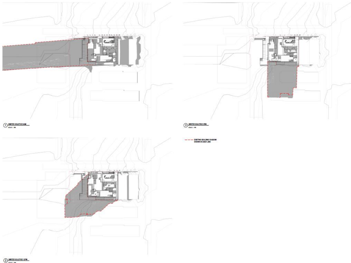
Figure 3 Proposed shadows on the winter solstice (existing building shown in dashed line)

An extract of the amended shadows diagrams at the winter solstice is shown below, indicating the shadow cast by the existing and proposed development.