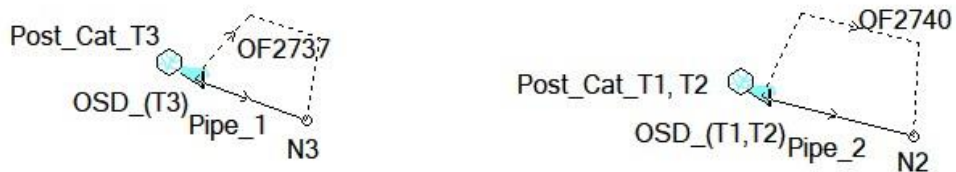
Figure 4.3 Pre-Dev Drains Model Schematics