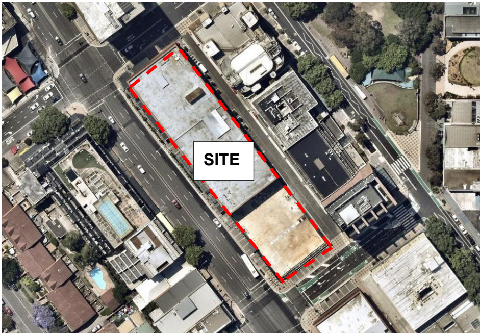
Figure 3.1 Locality Plan