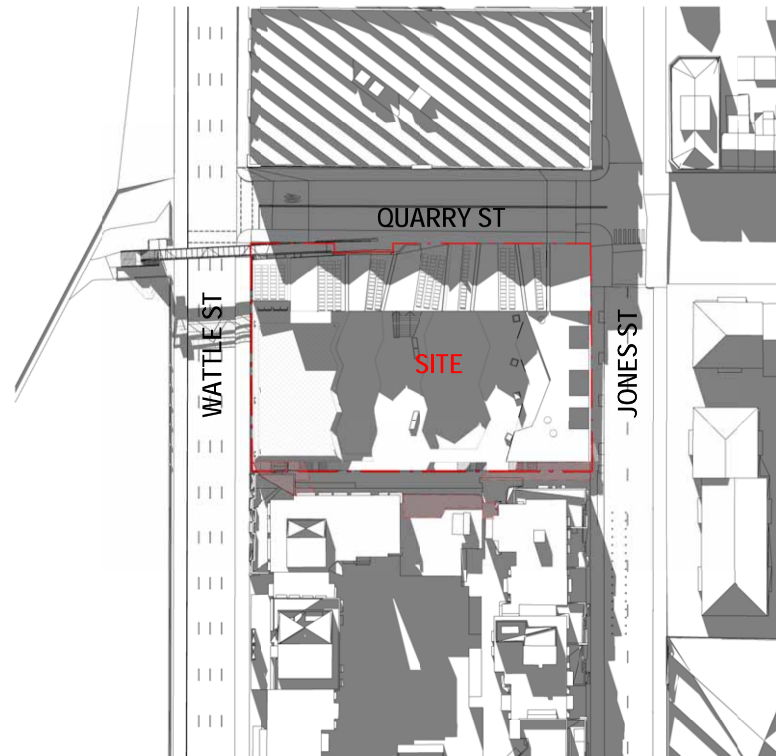
2 SHADOW PLAN - NEW - 21ST JUNE 3PM DA-5002 SCALE 1:1000

ARCHITECTS IN ASSOCIATION Designinc | Lacoste +Stevenson | bmc2 Designinc Sydney PTY LIMITED ACN 003008820 L12 / 77 PACIFIC HWY NORTH SYDNEY NSW 2060 AUSTRALIA PO BOX 651 NORTH SYDNEY NSW 2059 AUSTRALIA T +612 8965 7100 F +612 8965 7199 E sydney@sydney.designinc.com.au www.designinc.com.au