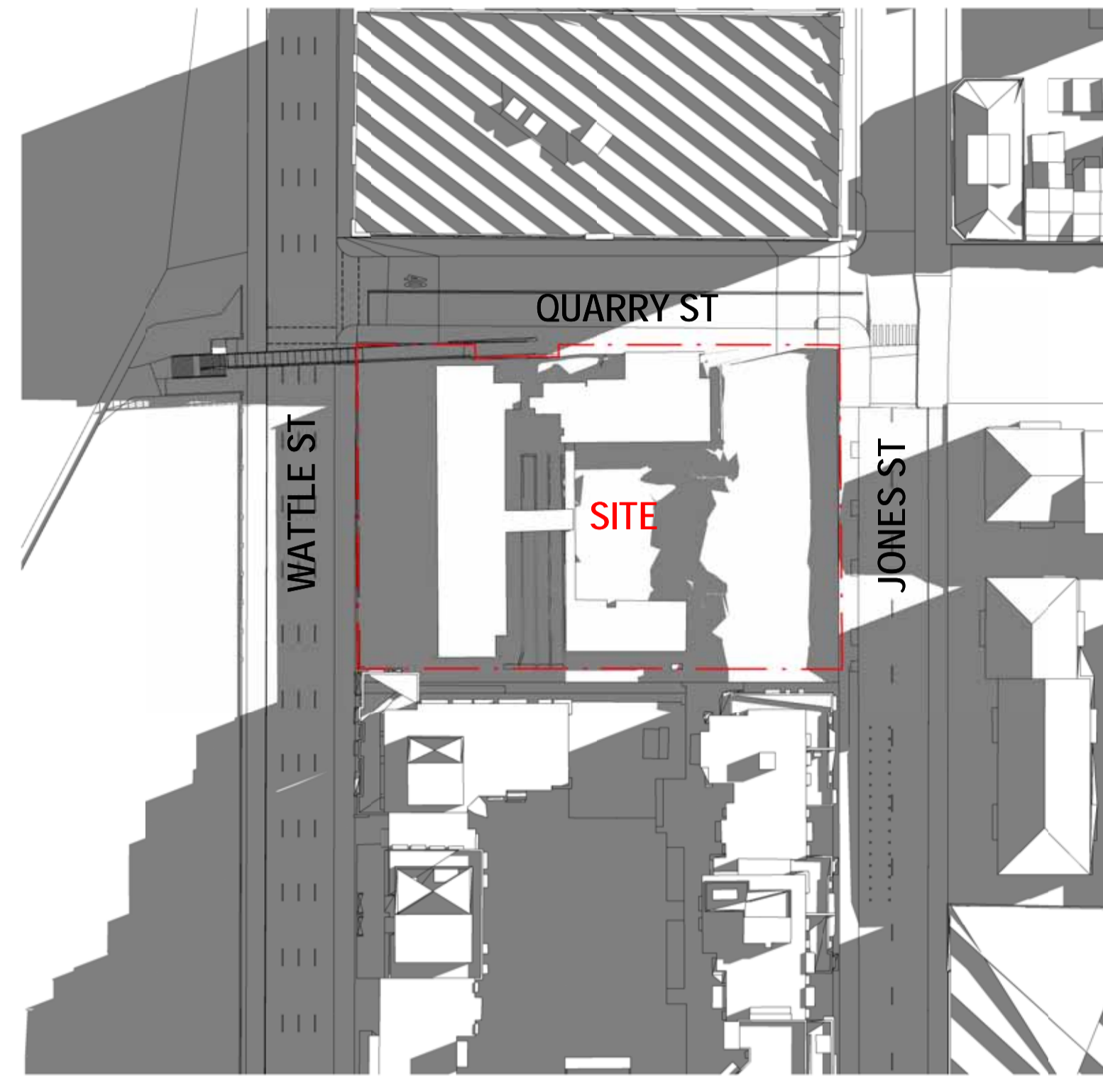
1 SHADOW PLAN - EXISTING - 21ST JUNE 9AM (DA-5000) SCALE 1:1000