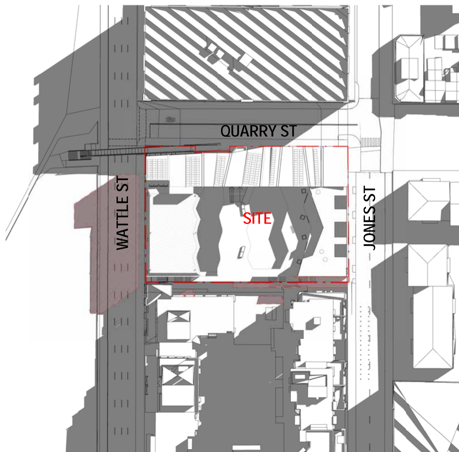
5 SHADOW PLAN - NEW - 21ST JUNE 10AM (DA-5000) SCALE 1:1000