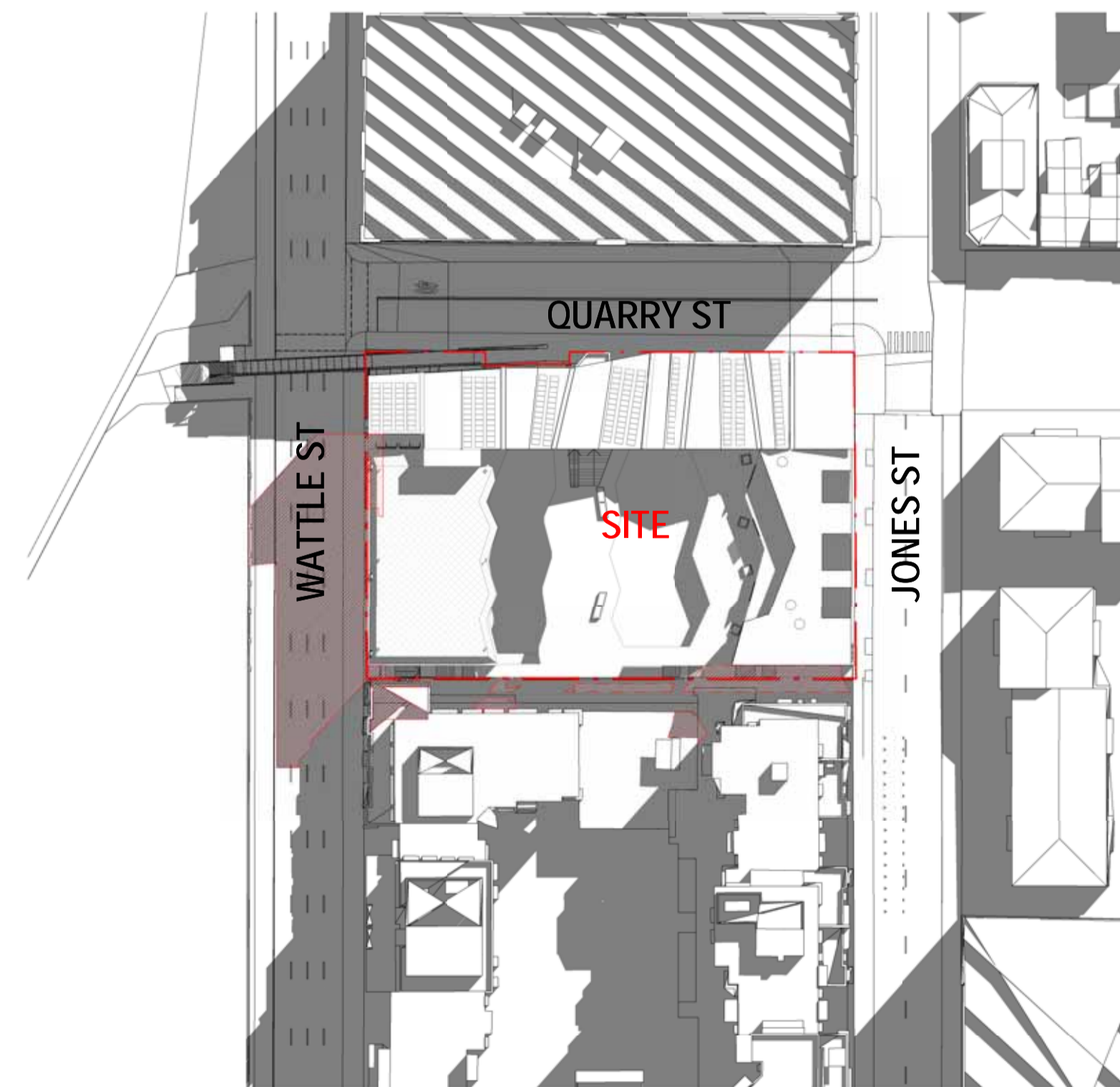
6 SHADOW PLAN - NEW - 21ST JUNE 11AM (DA-5000) SCALE 1:1000

ARCHITECTS IN ASSOCIATION Designinc | Lacoste + Stevenson | bmc2 Designinc Sydney PTY LIMITED ACN 003008820 L12 / 77 PACIFIC HWY NORTH SYDNEY NSW 2060 AUSTRALIA PO BOX 651 NORTH SYDNEY NSW 2059 AUSTRALIA T +612 8965 7100 F +612 8965 7199 E sydney@sydney.designinc.com.au www.designinc.com.au