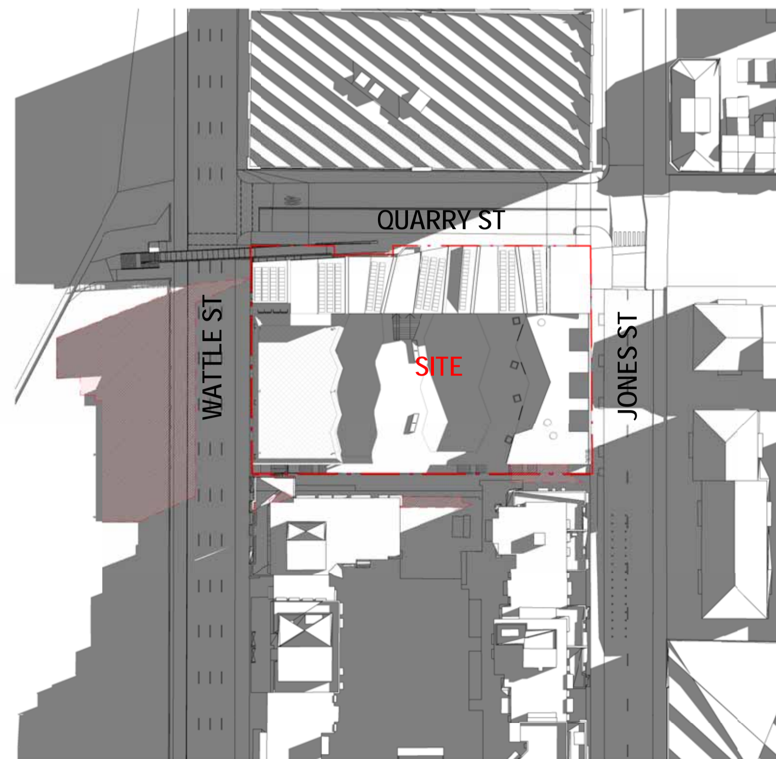
4 SHADOW PLAN - NEW - 21ST JUNE 9AM (DA-5000) SCALE 1:1000