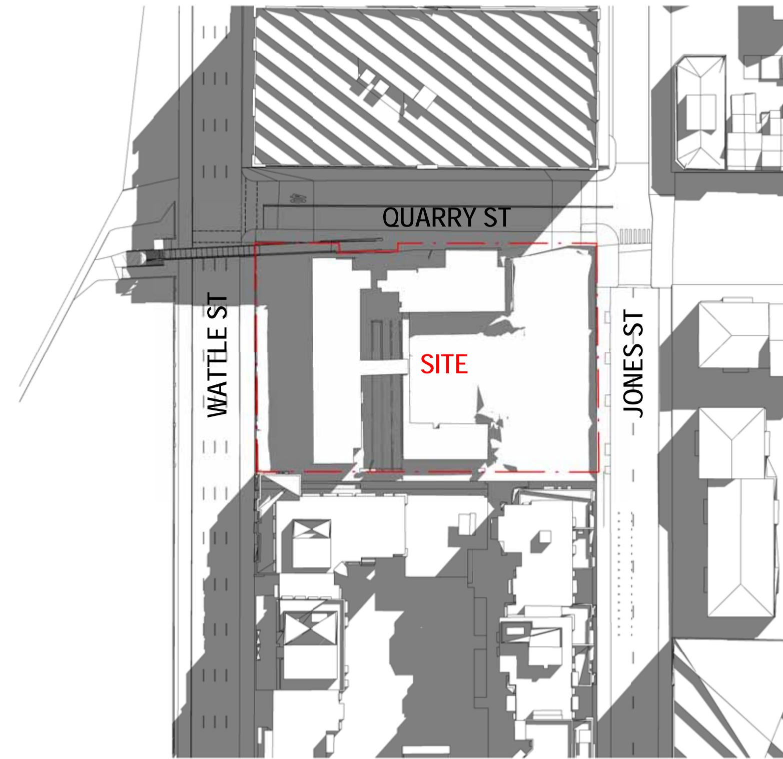
3 SHADOW PLAN - EXISTING - 21ST JUNE 11AM (DA-5000) SCALE 1:1000