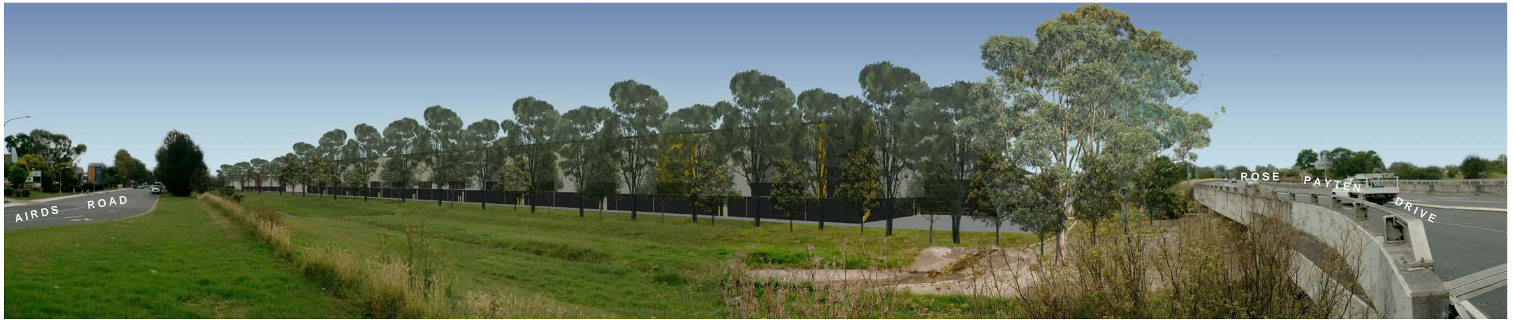
PERSPECTIVE VIEW A